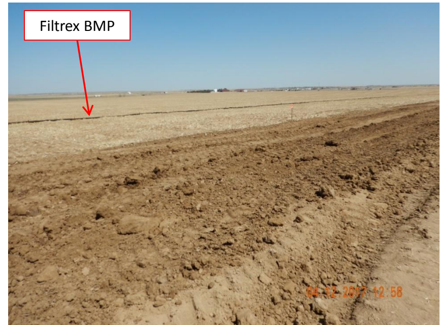
Photo 2. Photo taken from the access road, facing Northeast. Topsoil has been stripped off from the access road and subsoil material is being used to build up the access road. Temporary stormwater BMP installed along the north, east, and south of the location in the form of a filtrex wattle.