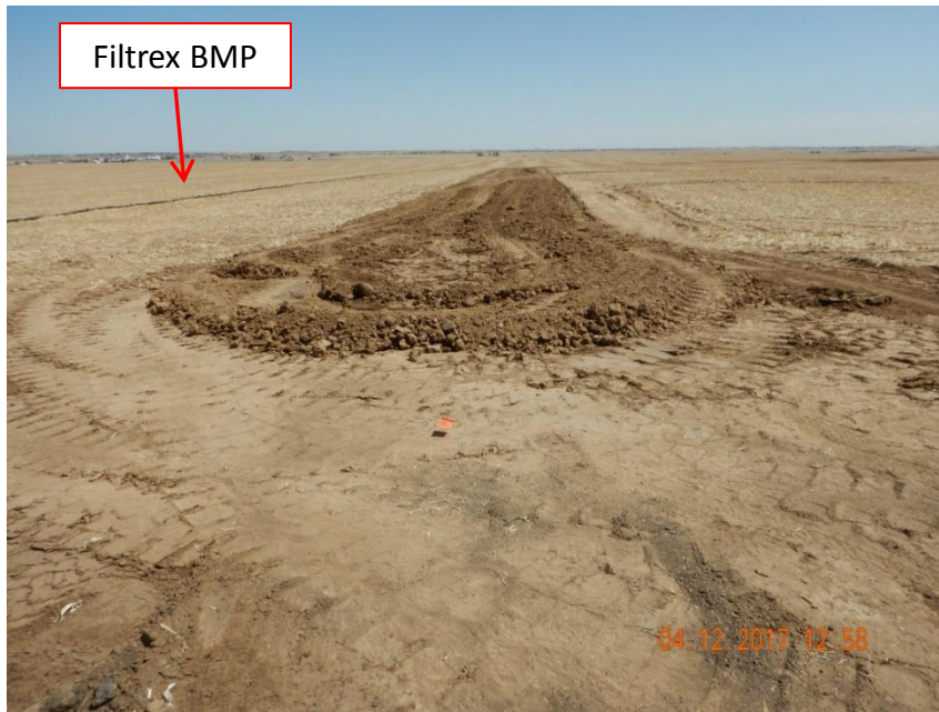
Photo 1. Photo taken from the access point off North Haysmount Road, facing East. Topsoil has been stripped off from the access road and subsoil material is being used to build up the access road. Temporary stormwater BMP installed along the north, east, and south of the location in the form of a filtrex wattle.