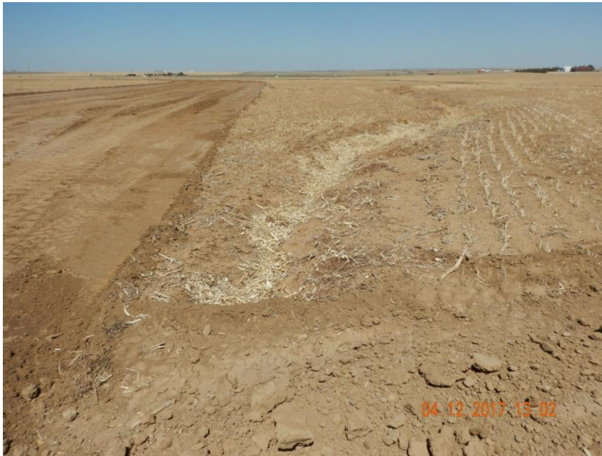
Photo 3. Photo taken along the northern location perimeter and the intersection of the eastern access point, facing North. Photo illustrates swale area where potential stormwater runoff would likely flow.