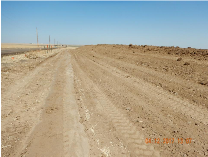
Photo 7. Photo taken from the western perimeter of the location, facing North. Ditch BMP has been installed along the western side of the topsoil stockpile.