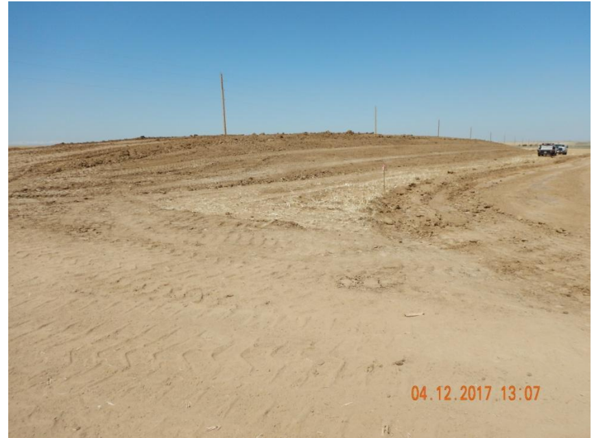
Photo 6. Photo taken from the southern location, facing Northwest towards the topsoil stockpile. Topsoil did not appear to be evenly salvaged throughout portions of the location.