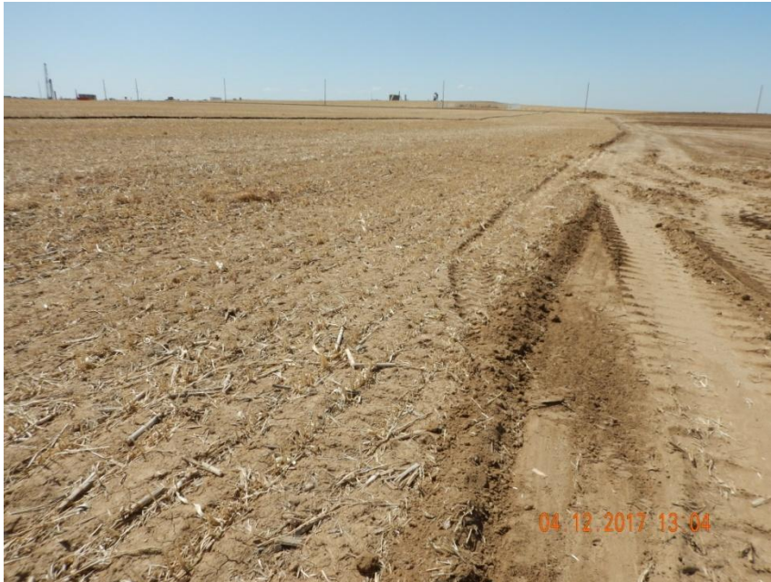
Photo 5. Photo taken from the southern perimeter of the location, facing West. Topsoil is in the process of being salvaged. Topsoil did not appear to be evenly salvaged throughout portions of the location. Temporary stormwater BMP installed along the north, east, and south of the location in the form of a filtrex wattle.