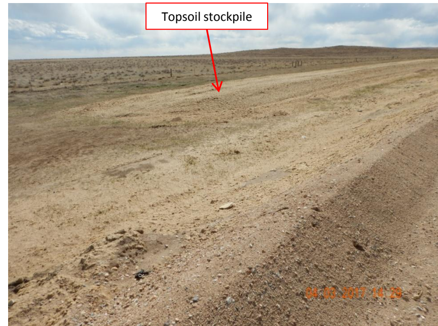
Photo 4. Photo taken from the southeast location, facing Southwest. Topsoil stockpile has been stored along the southern location and a tackifier applied.