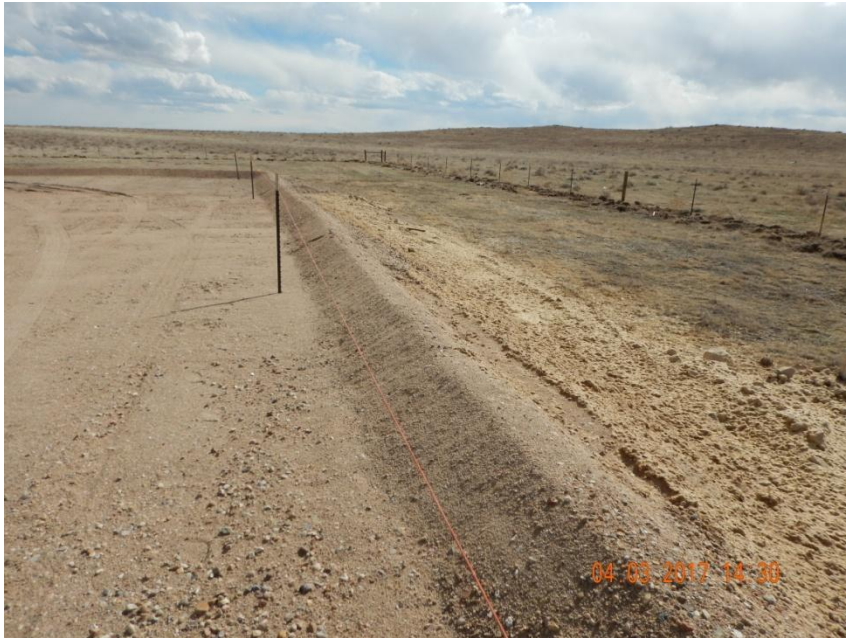
Photo 5. Photo taken from the western location, facing South. Surface roughening has been installed along the perimeter of the location, in conjunction with a tackifier along portions of the fill slope. A 12"-16" berm has been installed along the production area.