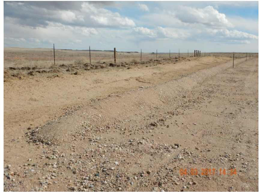
Photo 2. Photo taken from the northeast location, facing Southeast. Photo illustrates current stormwater BMPs.