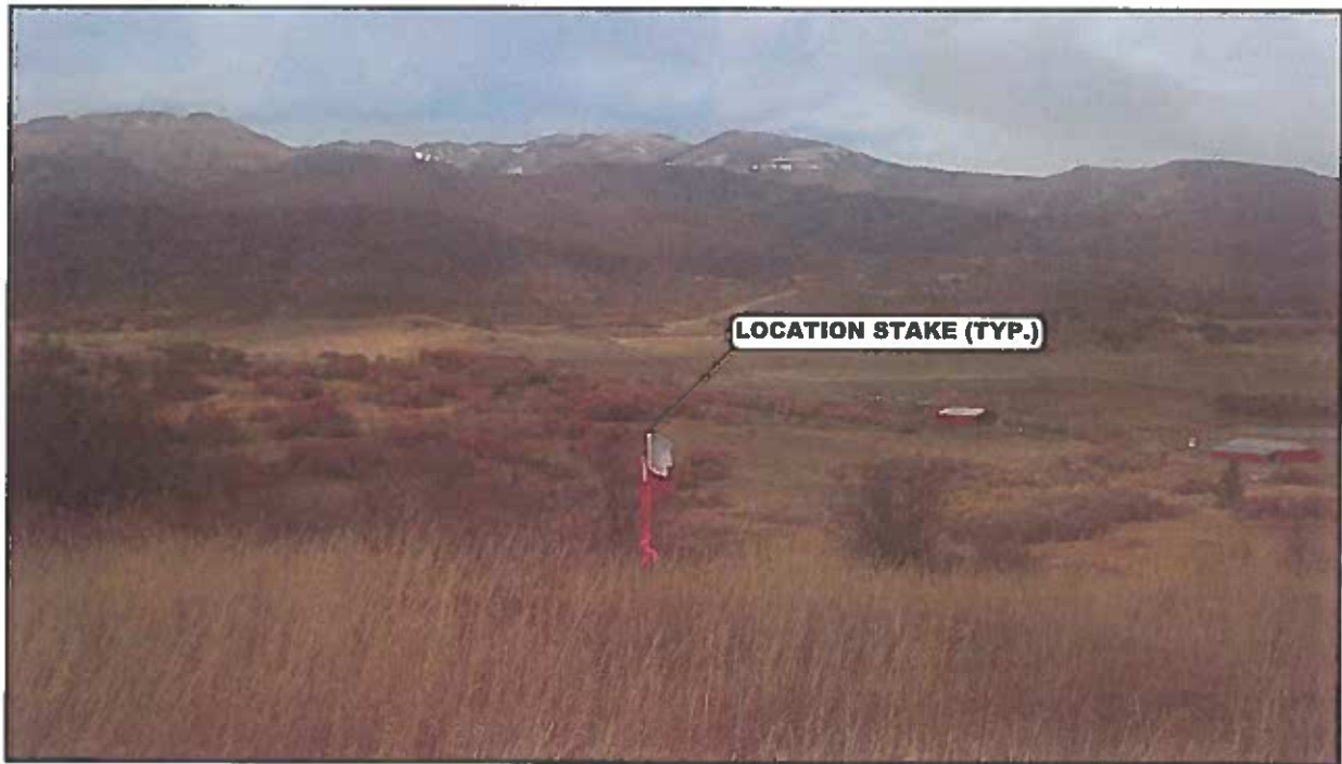
PHOTO: VIEW OF LOCATION STAKES