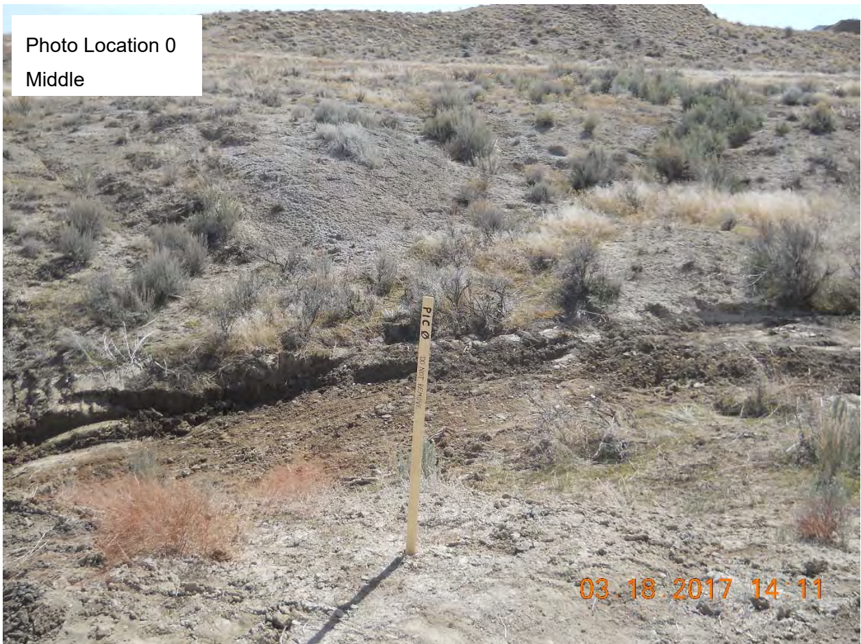
Photo Location 0 Middle