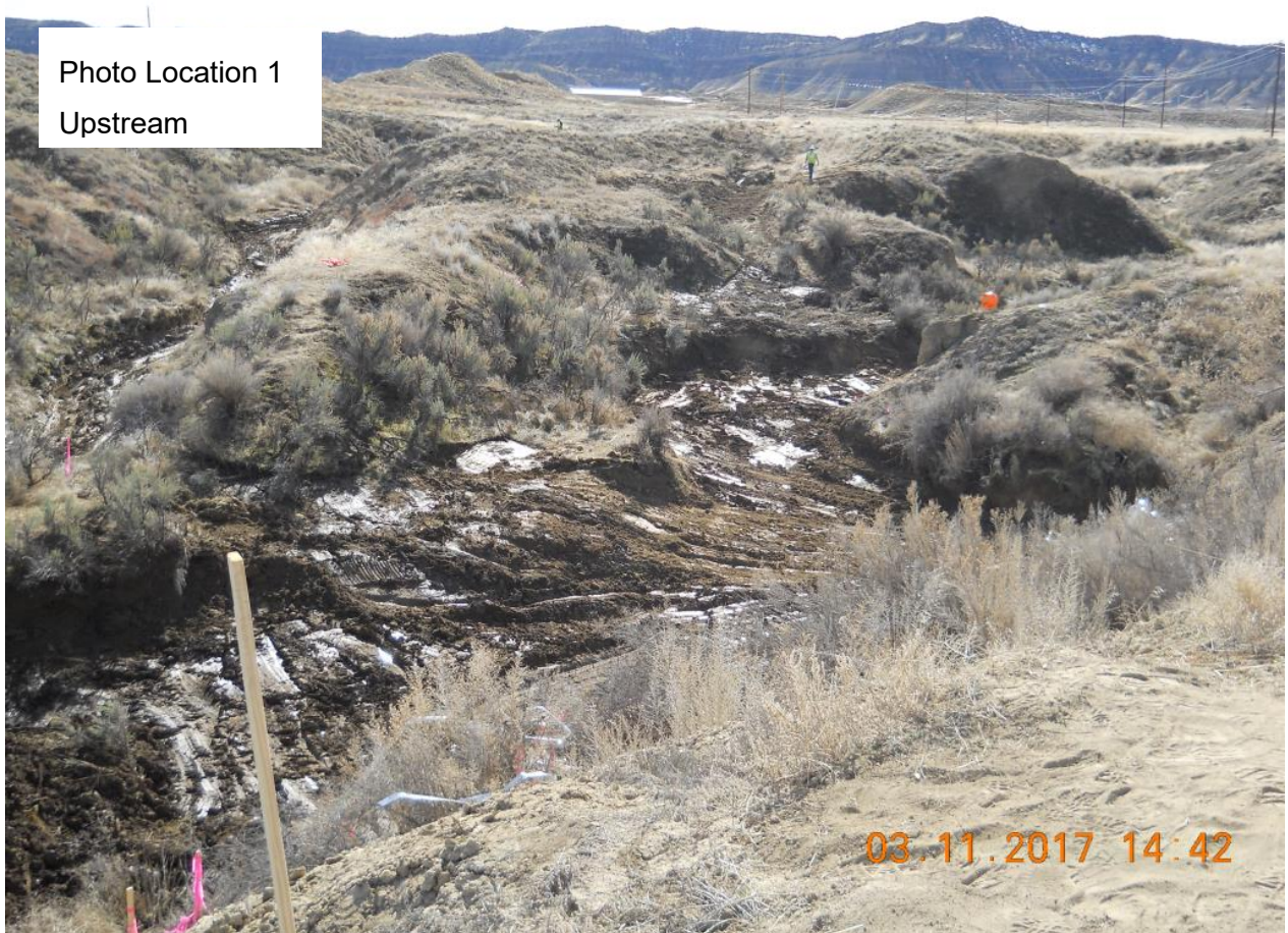
Photo Location 1 Upstream