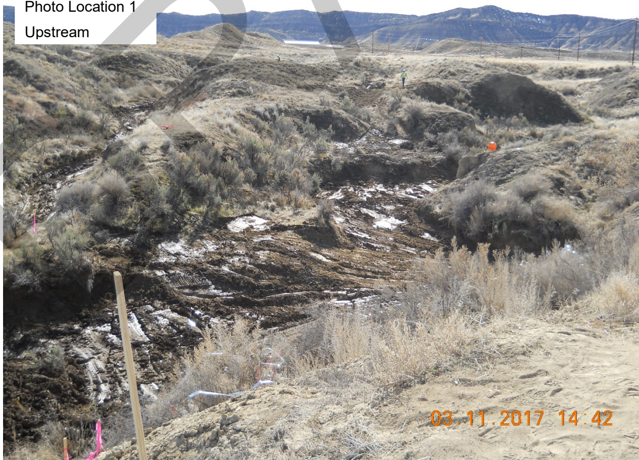
Photo Location 1 Upstream