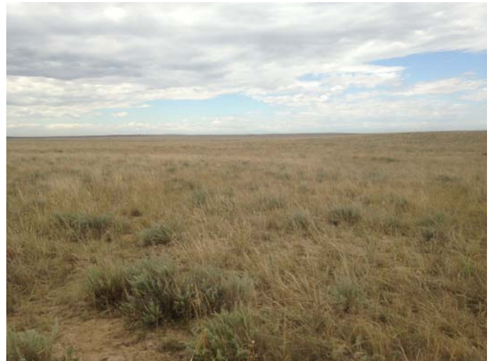
REFERENCE LOOKING SOUTH