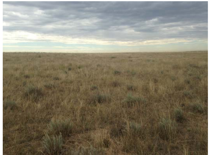
REFERENCE LOOKING NORTH