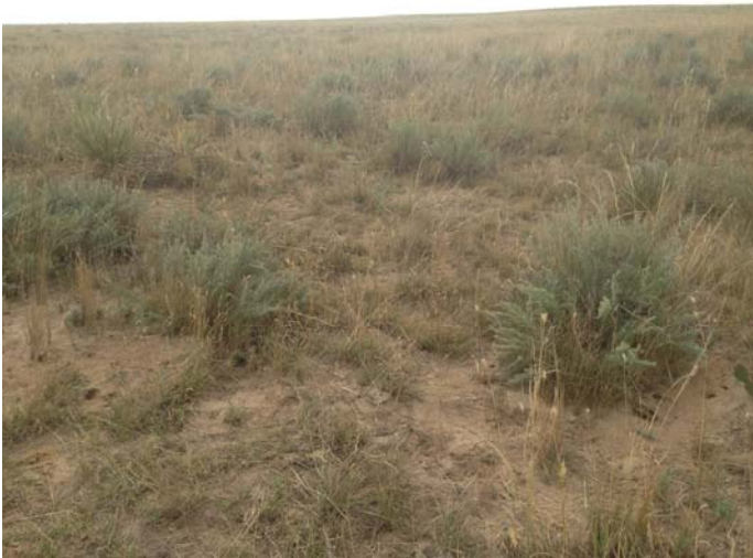
REFERENCE LOOKING WEST