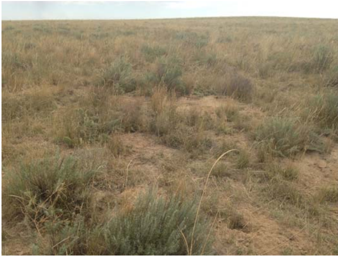
REFERENCE LOOKING EAST