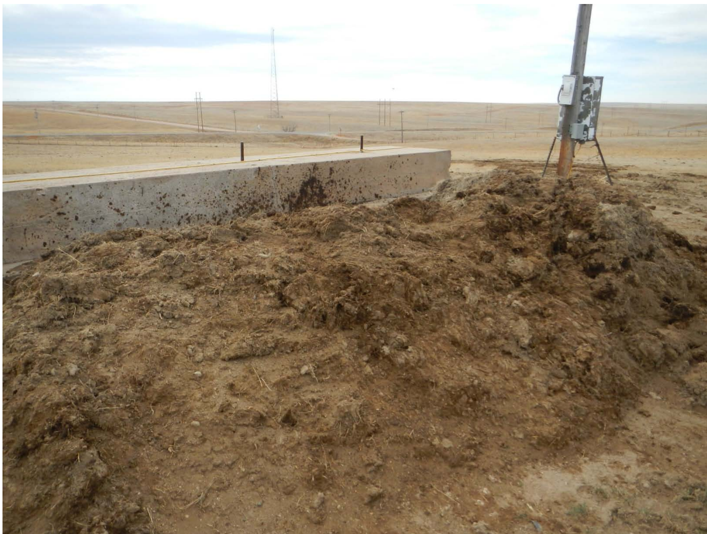
3/10/2017. View SW – oily soil stockpiled west of wellhead.