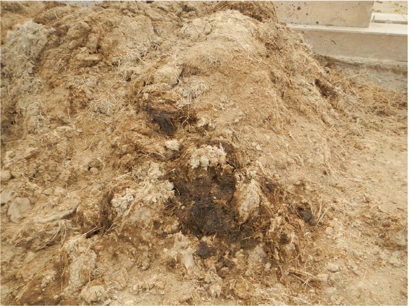
3/10/2017. Oily soil in stockpile immediately west of wellhead.