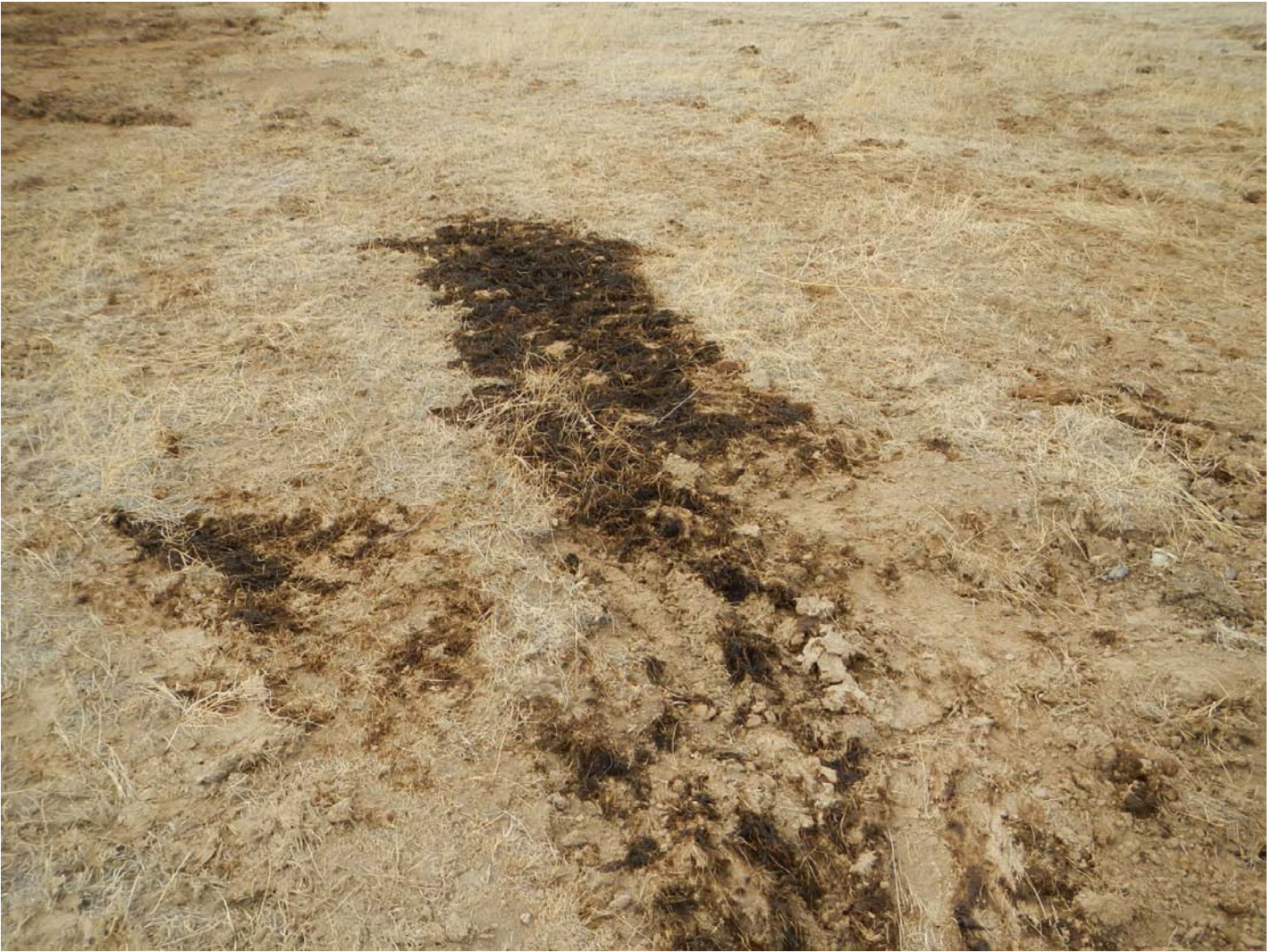
3/10/2017. Residual oil on the surface in the spill area.