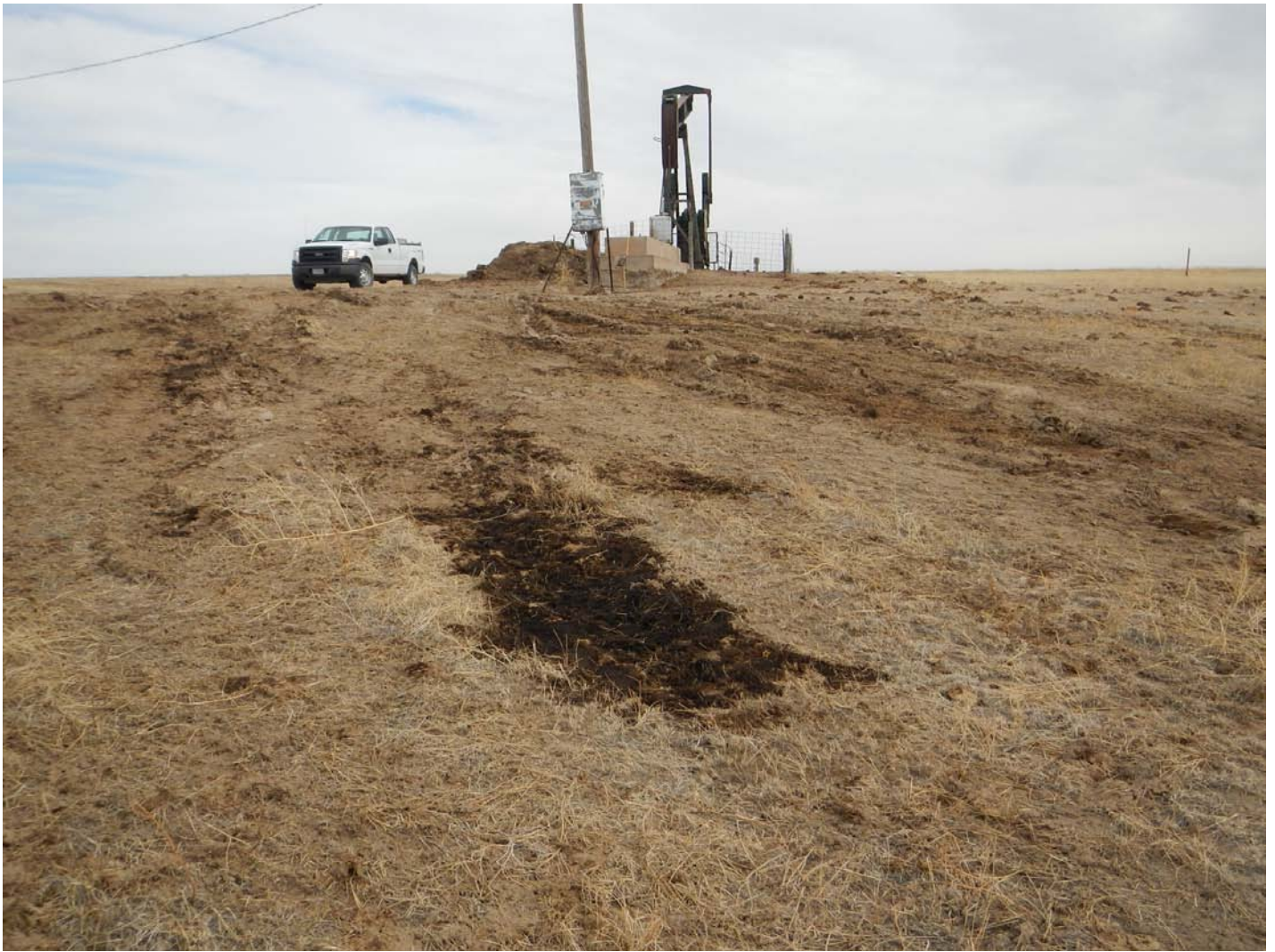
3/10/2017. View east, uphill toward Wright #1 wellhead including residual oil and heavy equipment track and scrape marks.