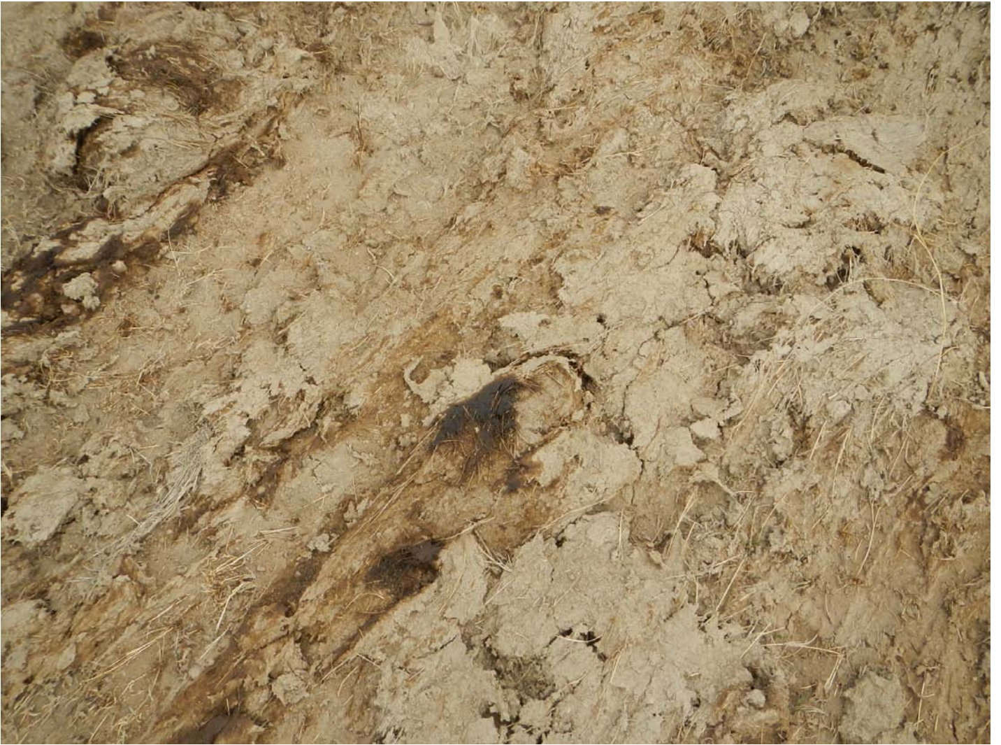
3/10/2017. Residual oil on the ground surface in the spill area.