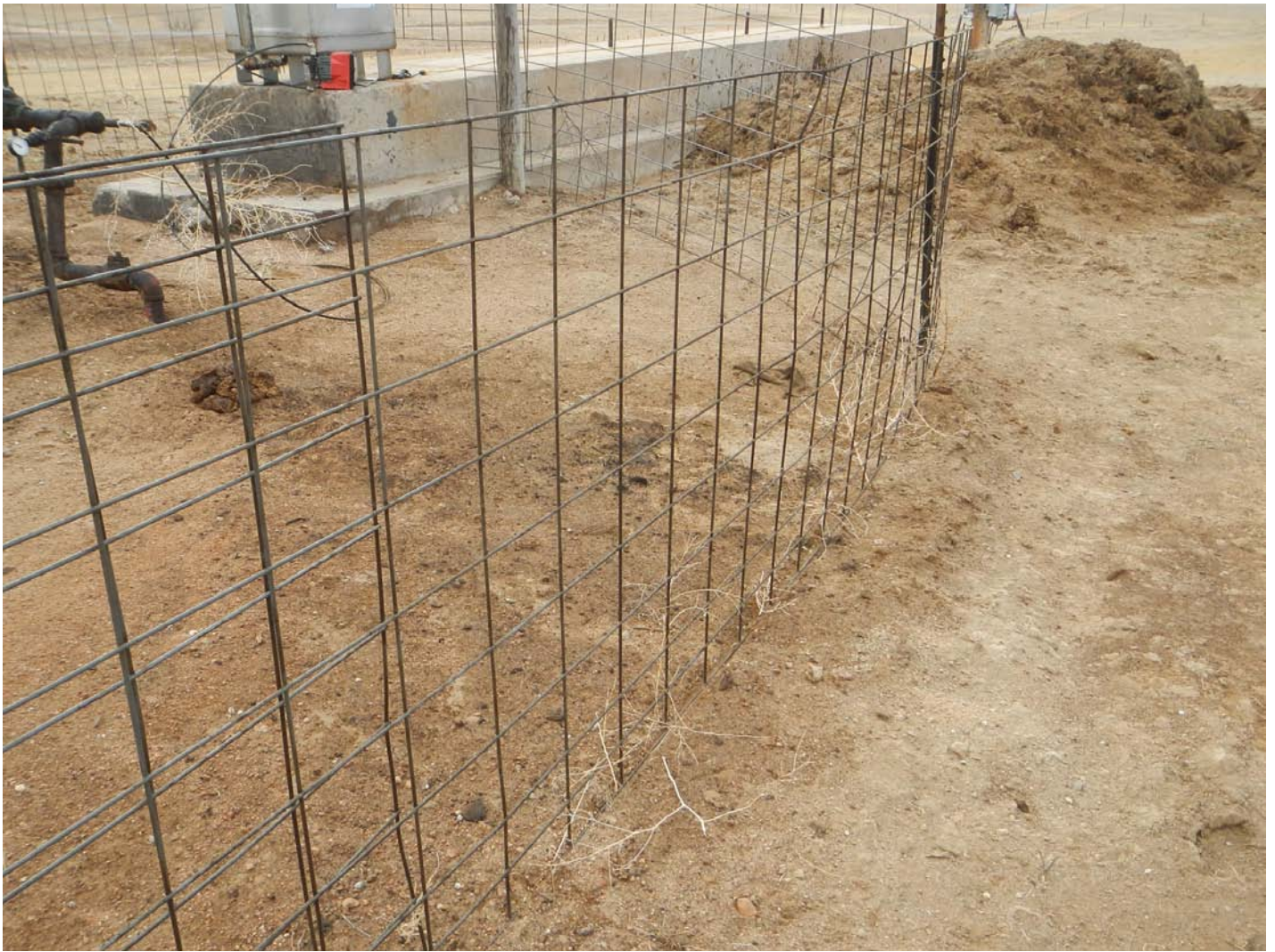
3/10/2017. Wright #1 wellhead and oily soil stockpile, view southwest.