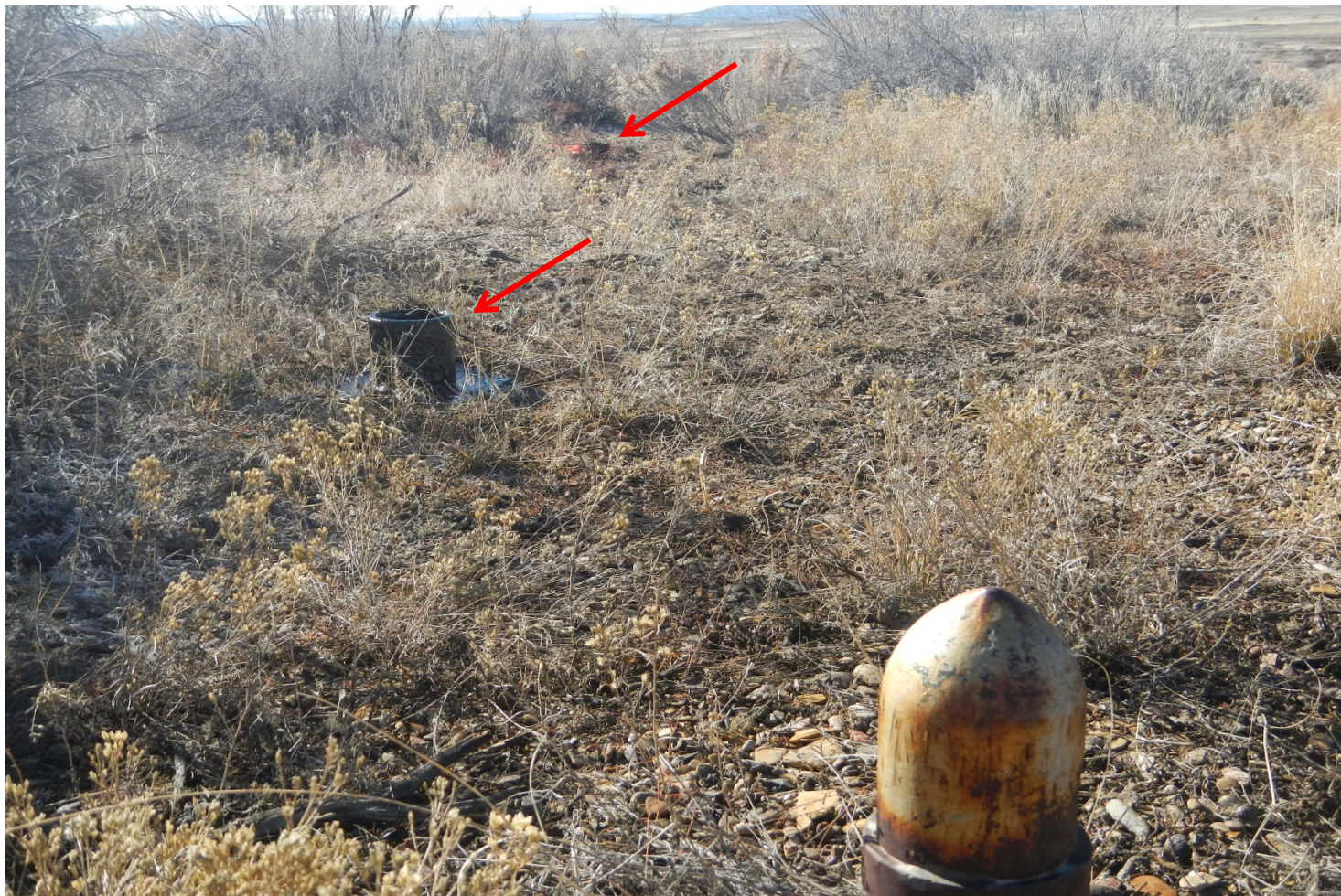
Photo#11: View N to S of stubbed pipe; With arrows indicating open Pipe riser positions.