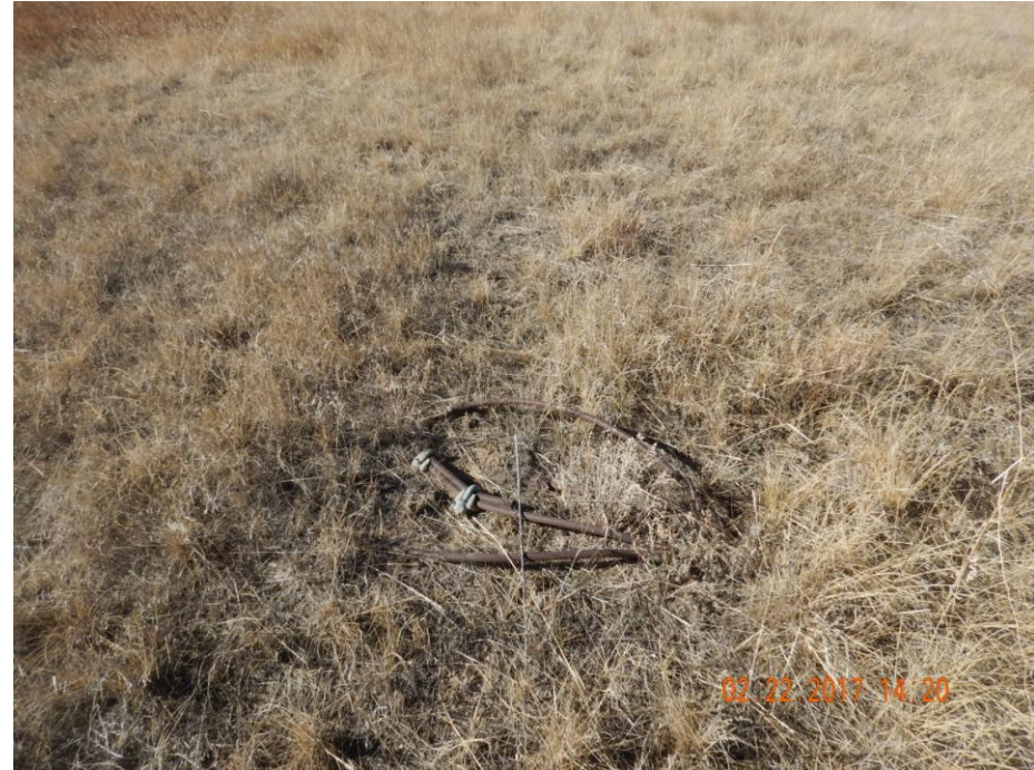
Photo 2: Photo taken south of the well pad. Photo shows cable debris remaining on location.