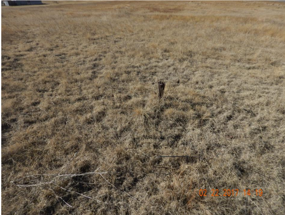
Photo 1: Photo taken southeast of the well pad. Photo shows pipe sticking out of ground.