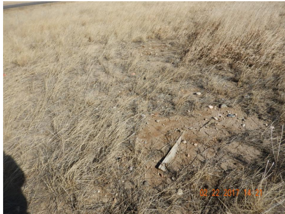
Photo 4: Photo taken at the well pad. Photo shows what appears to be stained soil found on location.