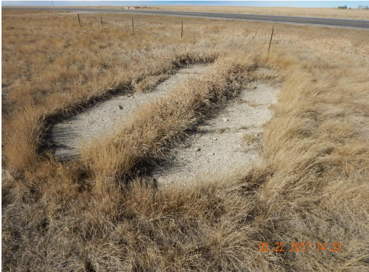
Photo 5: Photo taken north of the location. Photo shows concrete pad remaining.