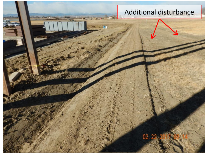
Photo 4. Photo taken from the northern location, facing Southwest. Ditch and berm BMP installed.