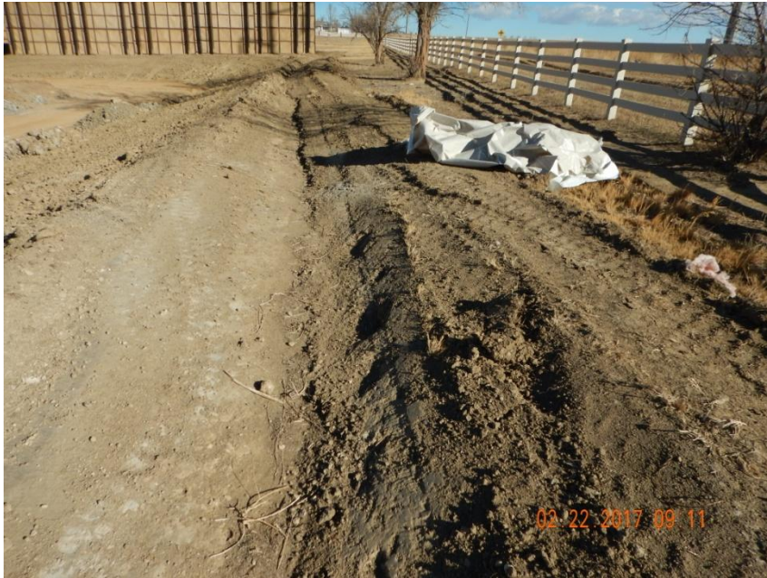
Photo 1. Photo taken from the eastern location, facing North. Ditch and berm BMP installed. Need to remove trash from perimeter of location.