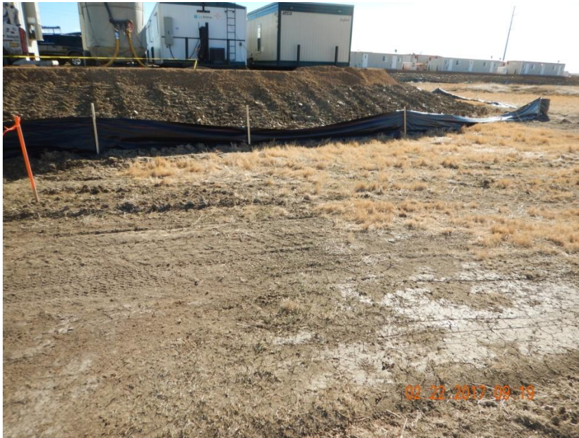
Photo 7. Photo taken from the southwestern location, facing East. Silt fence BMP installed but needs maintenance and repairs. BMP not in proper functioning condition. Stakes appear to be installed too far apart (i.e., 15' or more apart).