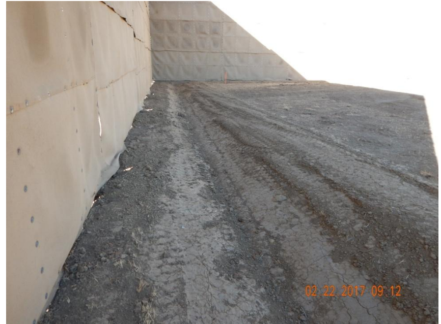
Photo 2. Photo taken from the northeast location, facing West. Ditch and berm BMP installed.