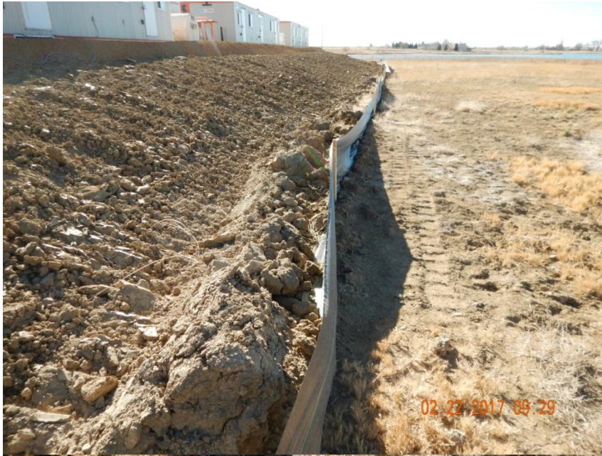
Photo 11. Photo taken from the southwestern location, facing South. Silt fence BMP installed but needs maintenance and repairs. BMP not in proper functioning condition. Stakes appear to be installed too far apart (i.e., 15' or more apart) and excessive soil material against BMP.