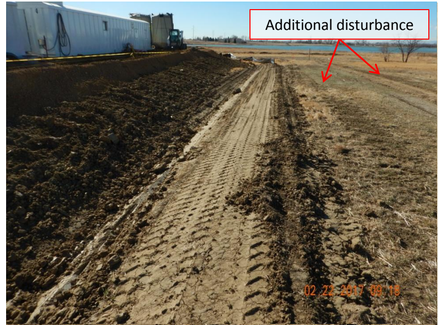
Photo 6. Photo taken from the western location, facing South. Ditch and berm BMP installed.