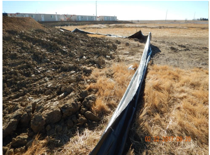
Photo 8. Photo taken from the southwestern location, facing South. Silt fence BMP installed but needs maintenance and repairs. BMP not in proper functioning condition. Stakes appear to be installed too far apart (i.e., 15' or more apart).