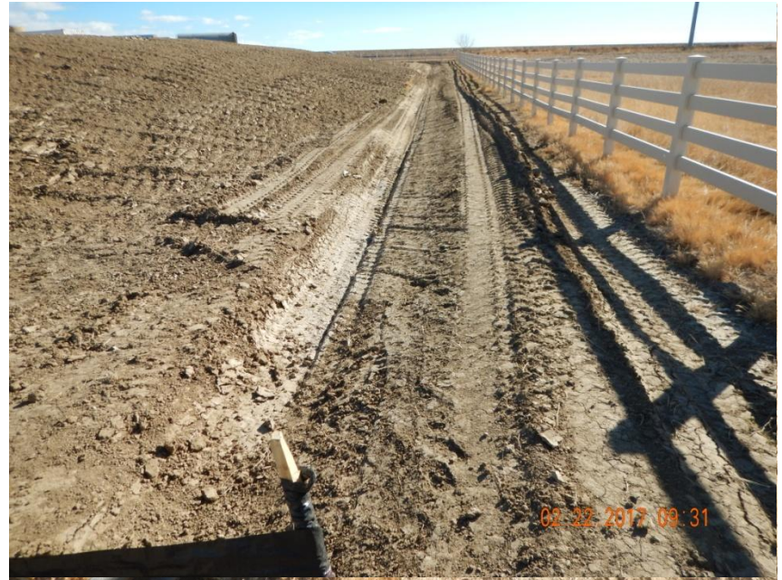
Photo 14. Photo taken from the southwest location, facing East. Ditch and berm BMP installed outside of the topsoil stockpile.