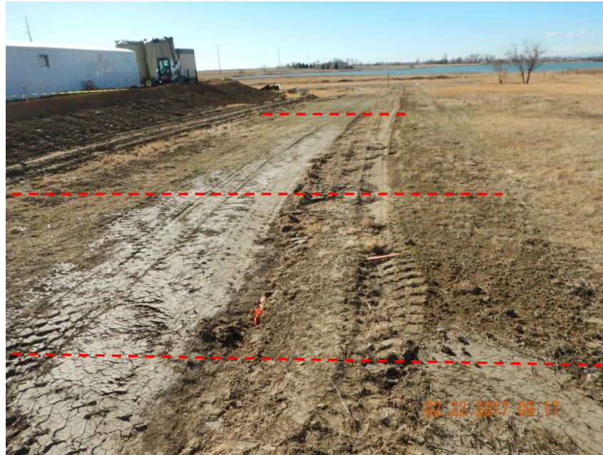
Photo 21. Photo taken from the southwestern location, facing South. Operator created additional disturbance from initial construction build which is outside of the current construction area (red-dashed line).