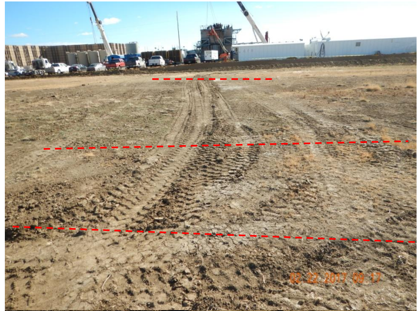
Photo 20. Photo taken from the western location, facing East. Operator created additional disturbance from initial construction build which is outside of the current construction area (red-dashed line).