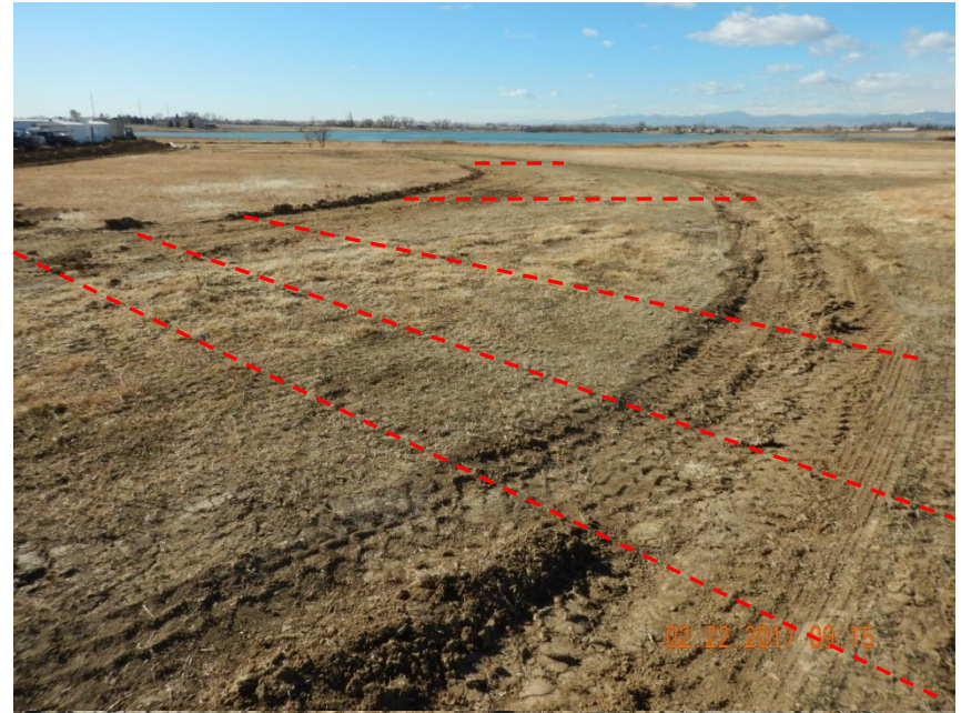
Photo 18. Photo taken from the northwest location, facing Southwest. Operator created additional disturbance from initial construction build which is outside of the current construction area (red-dashed line).