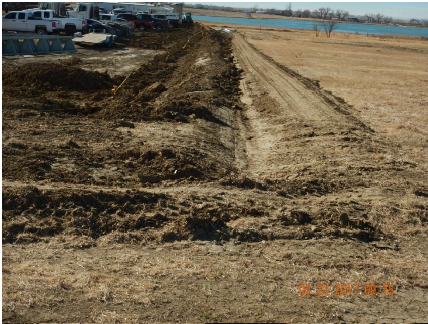
Photo 5. Photo taken from the northwest location, facing South. Ditch and berm BMP installed.