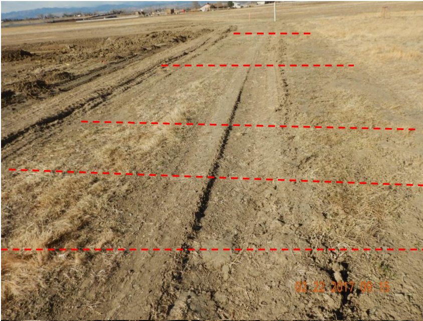
Photo 17. Photo taken from the northern location, facing West. Operator created additional disturbance from initial construction build which is outside of the current construction area (red-dashed line).