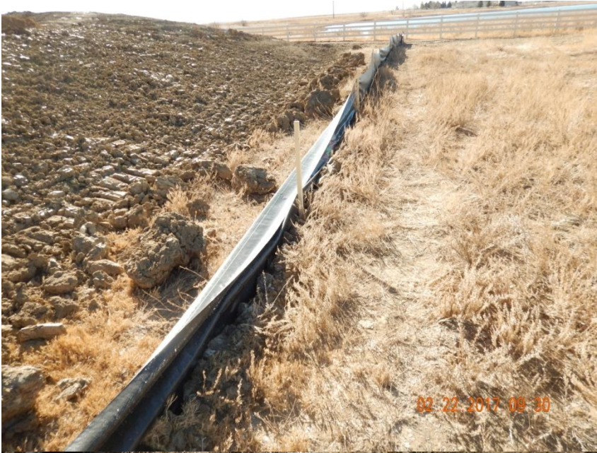
Photo 13. Photo taken from the southwestern location, facing South. Silt fence BMP installed but needs maintenance and repairs. BMP not in proper functioning condition. Stakes appear to be installed too far apart (i.e., 15' or more apart).