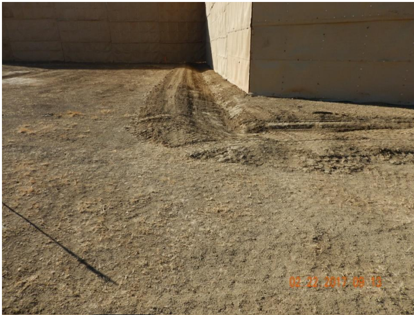
Photo 3. Photo taken from the northeast location, facing South. Ditch and berm BMP installed.