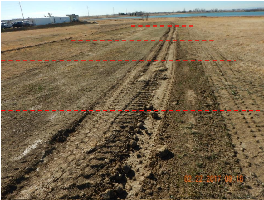
Photo 19. Photo taken from the western location, facing South. Operator created additional disturbance from initial construction build which is outside of the current construction area (red-dashed line).