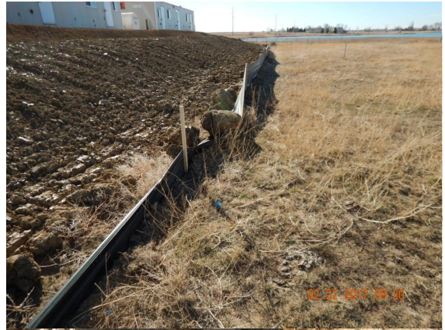
Photo 12. Photo taken from the southwestern location, facing South. Silt fence BMP installed but needs maintenance and repairs. BMP not in proper functioning condition. Stakes appear to be installed too far apart (i.e., 15' or more apart) and excessive soil material against BMP.