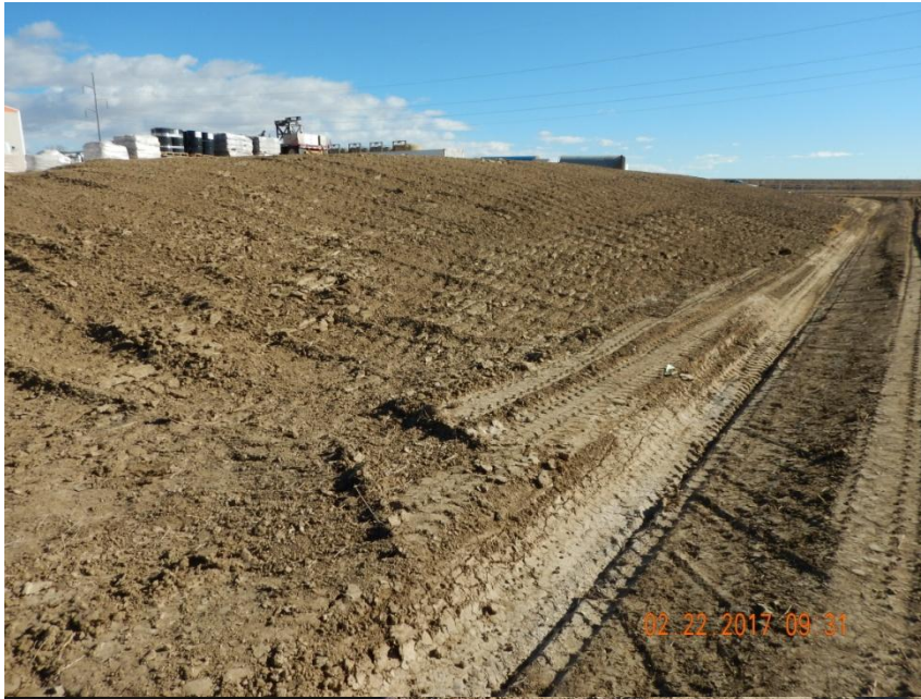
Photo 15. Photo taken from the southern location, facing Northeast, towards the topsoil stockpile.