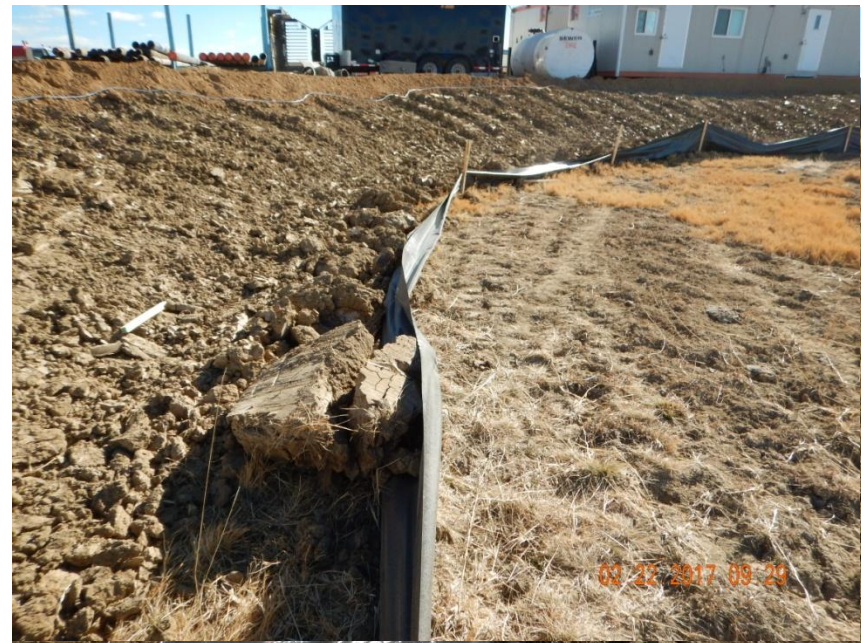
Photo 10. Photo taken from the southwestern location, facing East. Silt fence BMP installed but needs maintenance and repairs. BMP not in proper functioning condition. Stakes appear to be installed too far apart (i.e., 15' or more apart) and excessive soil material against BMP.