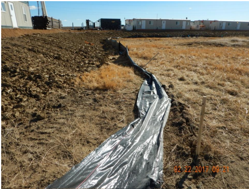
Photo 9. Photo taken from the southwestern location, facing East. Silt fence BMP installed but needs maintenance and repairs. BMP not in proper functioning condition. Stakes appear to be installed too far apart (i.e., 15' or more apart).