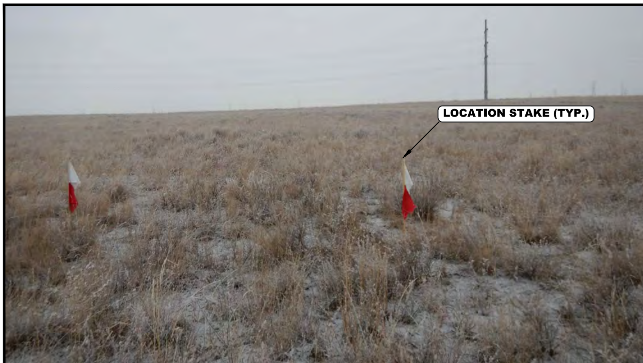
PHOTO: VIEW OF LOCATION STAKES