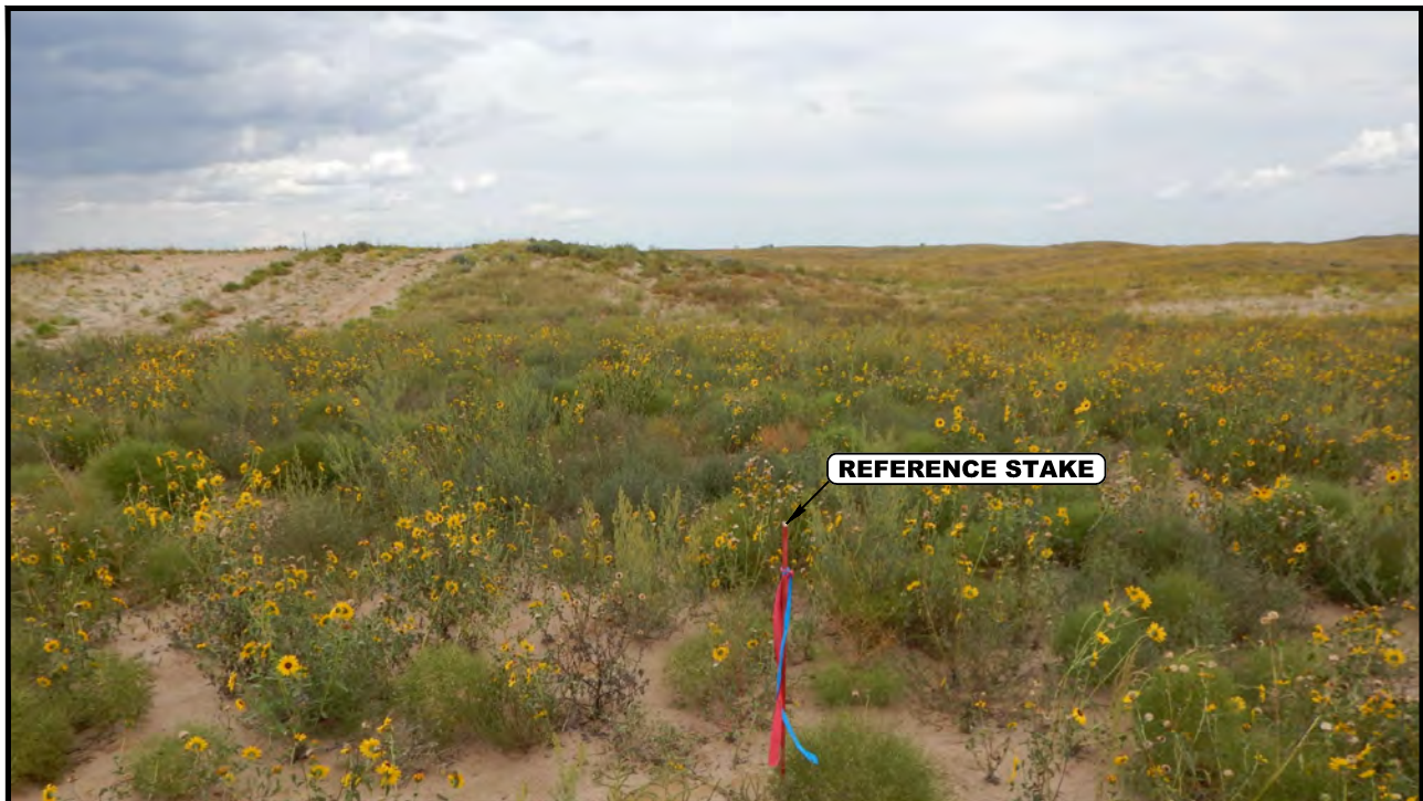
PHOTO: VIEW OF REFERENCE AREA