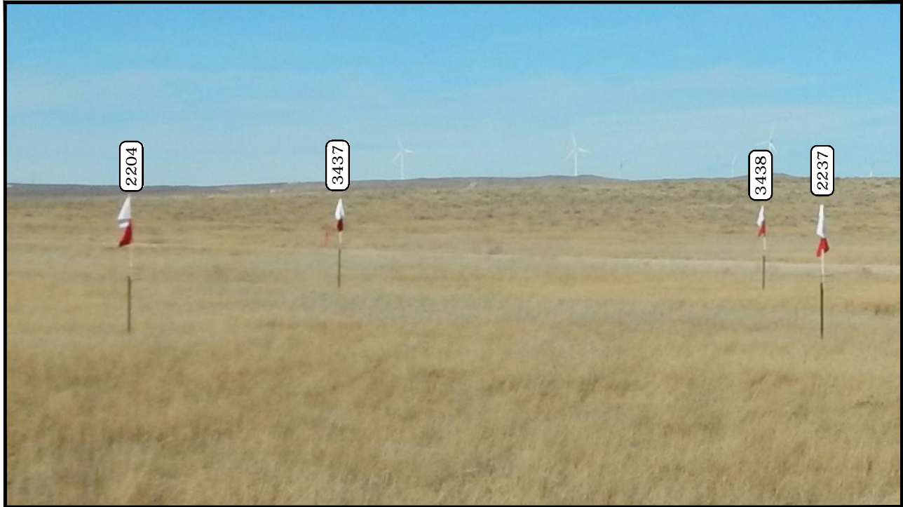
PHOTO: VIEW OF LOCATION STAKES