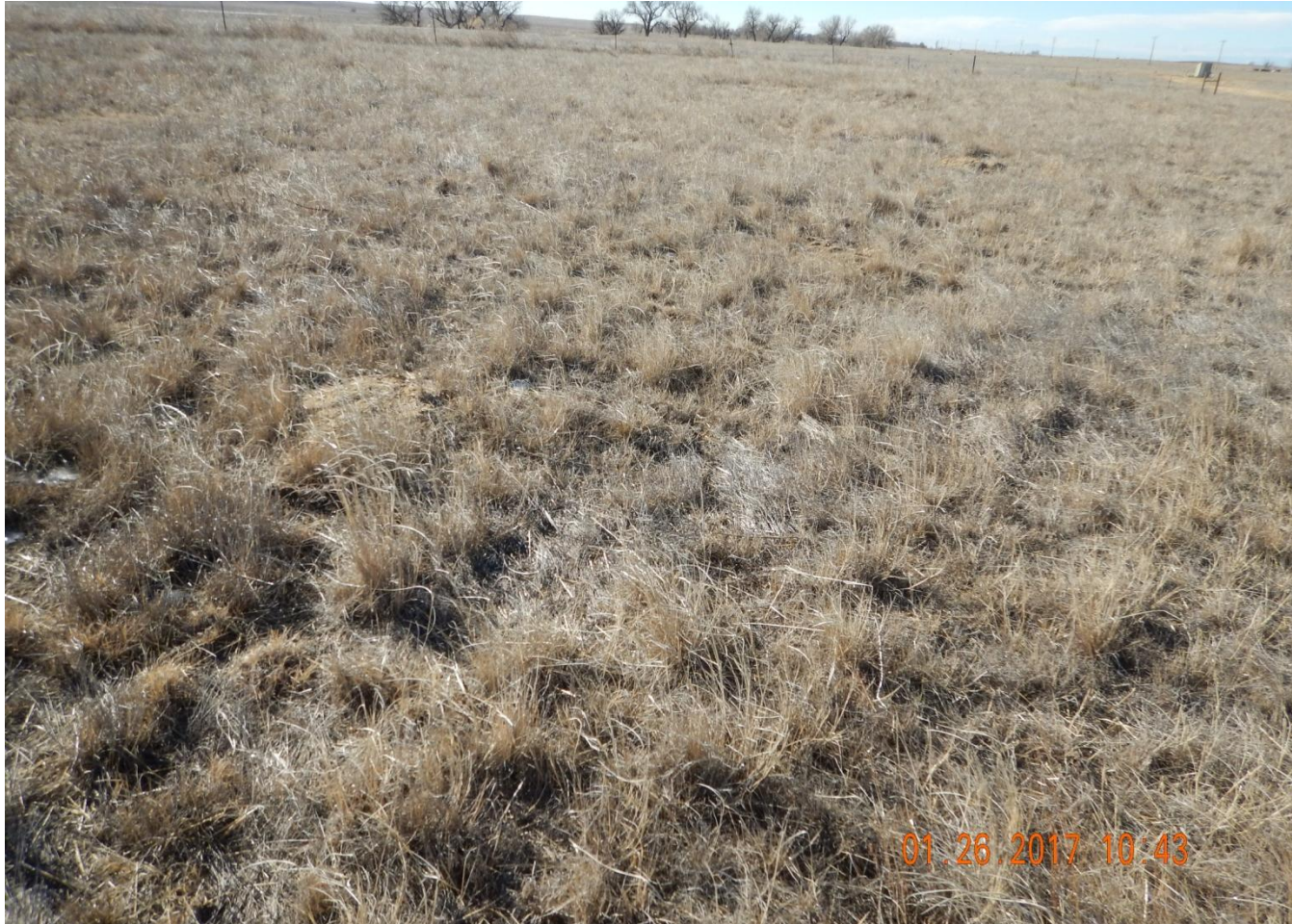
Photo 8. Reference photo taken east of the well location, facing South