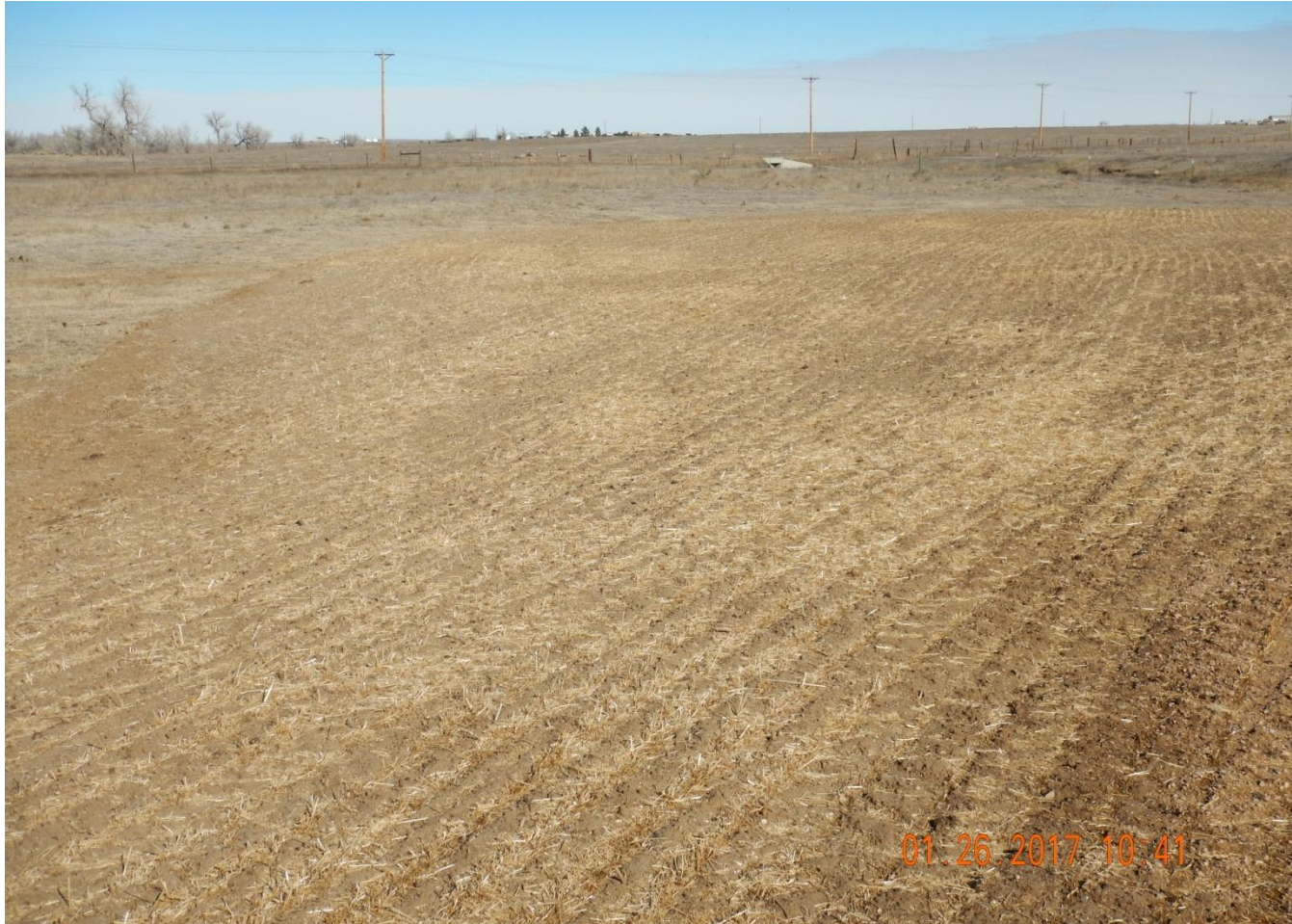
Photo 6. Photo taken from the south well location, facing Northwest. Evidence of final reclamation activities apparent throughout the disturbance area. It should be noted the well location still has fencing material around well location which might be used to keep cattle out during the reclamation process.