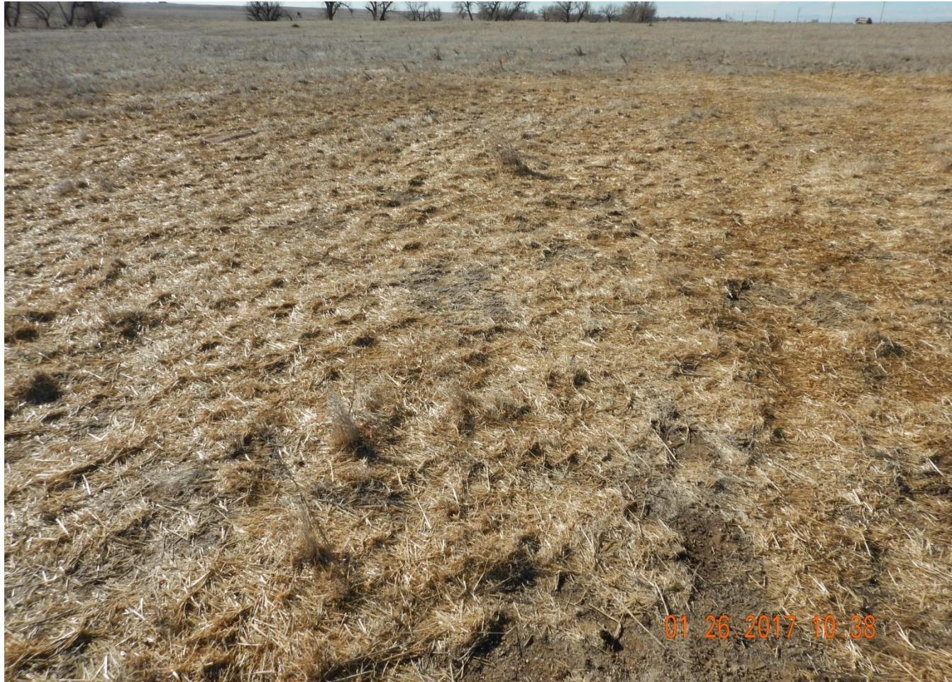
Photo 4. Photo taken from the east of the equipment along the border of the disturbance area and rangeland area, facing South. Accumulations of mulch apparent suggesting crimping was not sufficiently implemented.