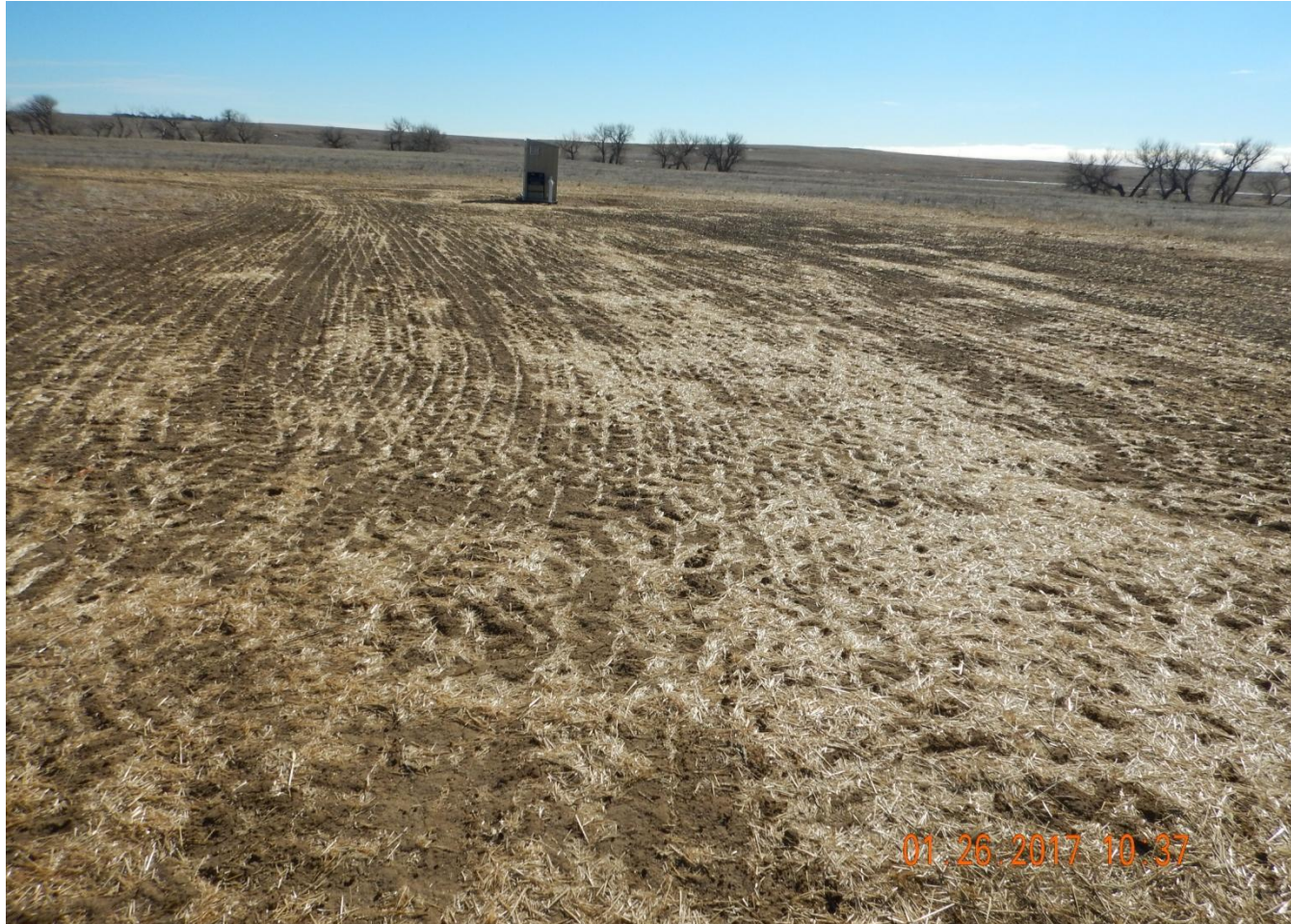
Photo 3. Photo taken from the entrance of location, facing East. Evidence of final reclamation activities apparent along the access road. Mulch does not appear to be sufficiently crimped. Mulch was observed in the rangeland areas adjacent to the disturbance area. Refer to the following photo.