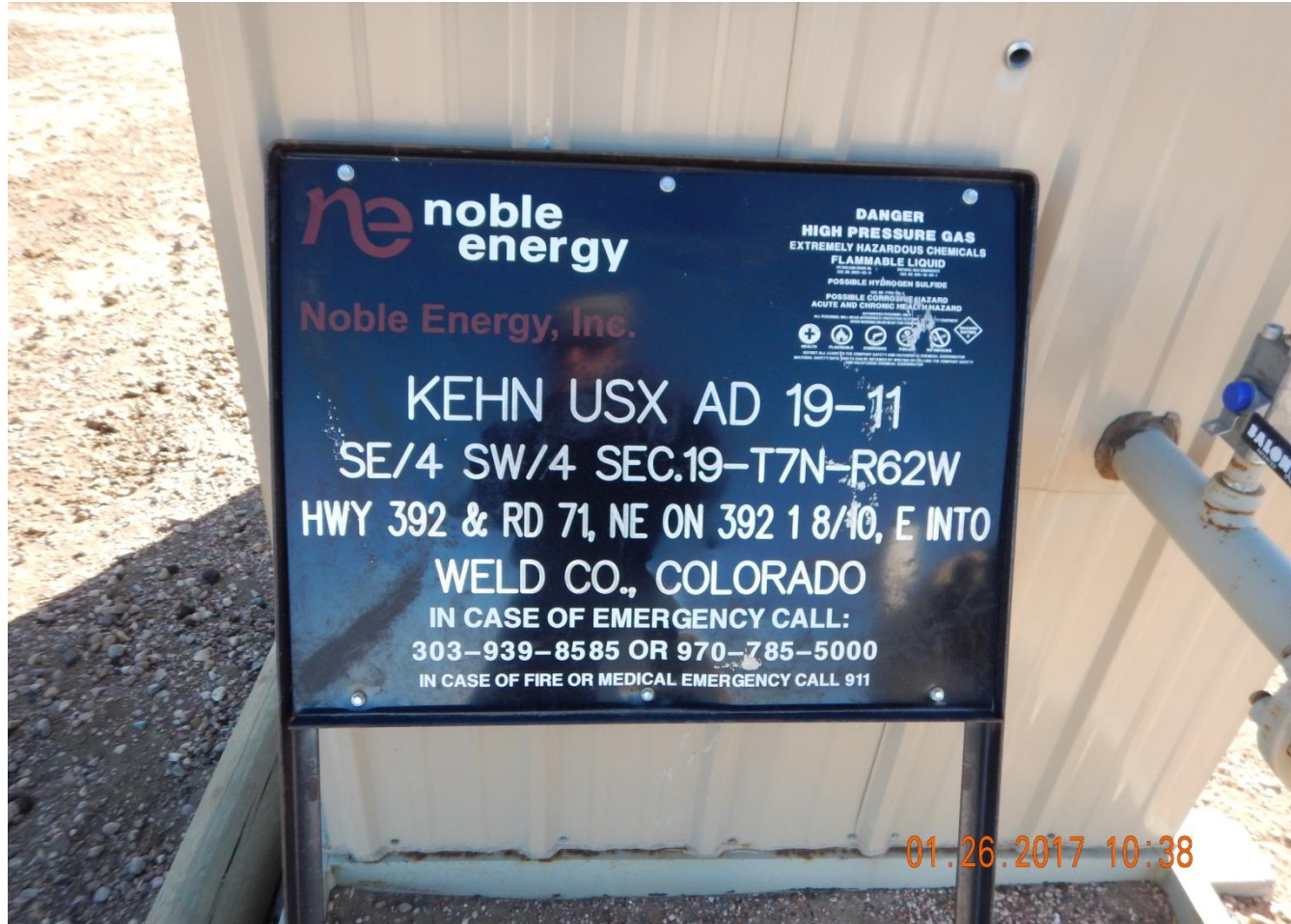
Photo 1. Photo taken of the PR well sign left behind with equipment at location.