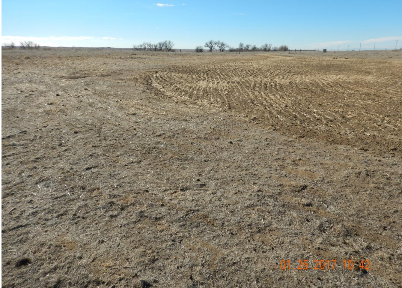
Photo 7. Photo taken from the north well location, facing South. Evidence of final reclamation activities apparent throughout the disturbance area.