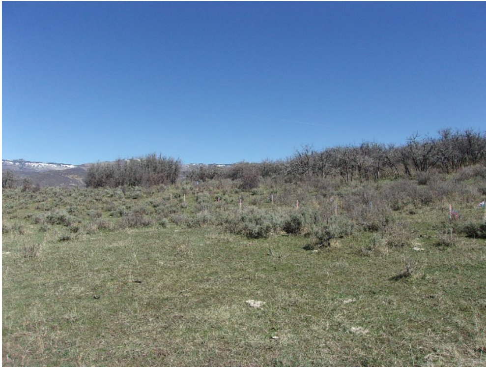
View of location stake; northerly