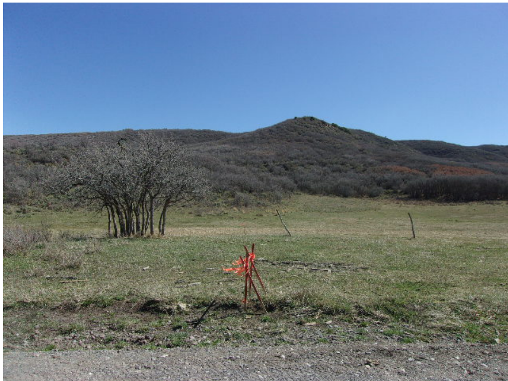
View from beginning of proposed access; easterly

Bruton 30-01 Pad, NENE S30, T9S, R93W, 6 PM Mesa County, CO Laramie Energy LLC