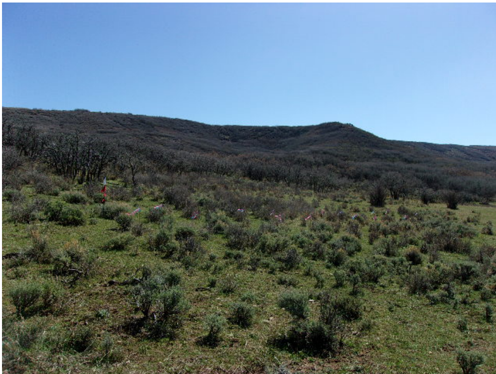
View of existing location; easterly

Bruton 30-01 Pad, NENE S30, T9S, R93W, 6 PM Mesa County, CO Laramie Energy LLC