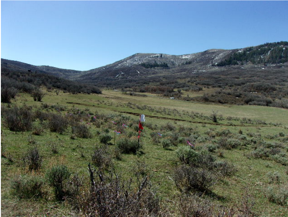
View of existing location; southerly