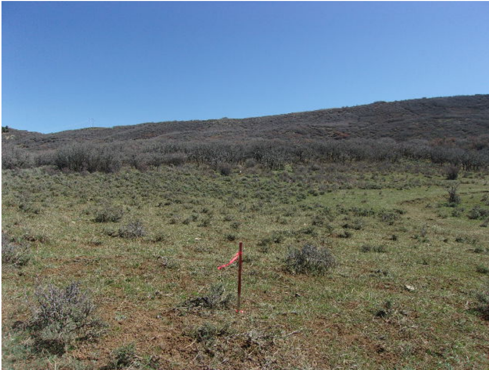
View from corner #1 to center; northeasterly