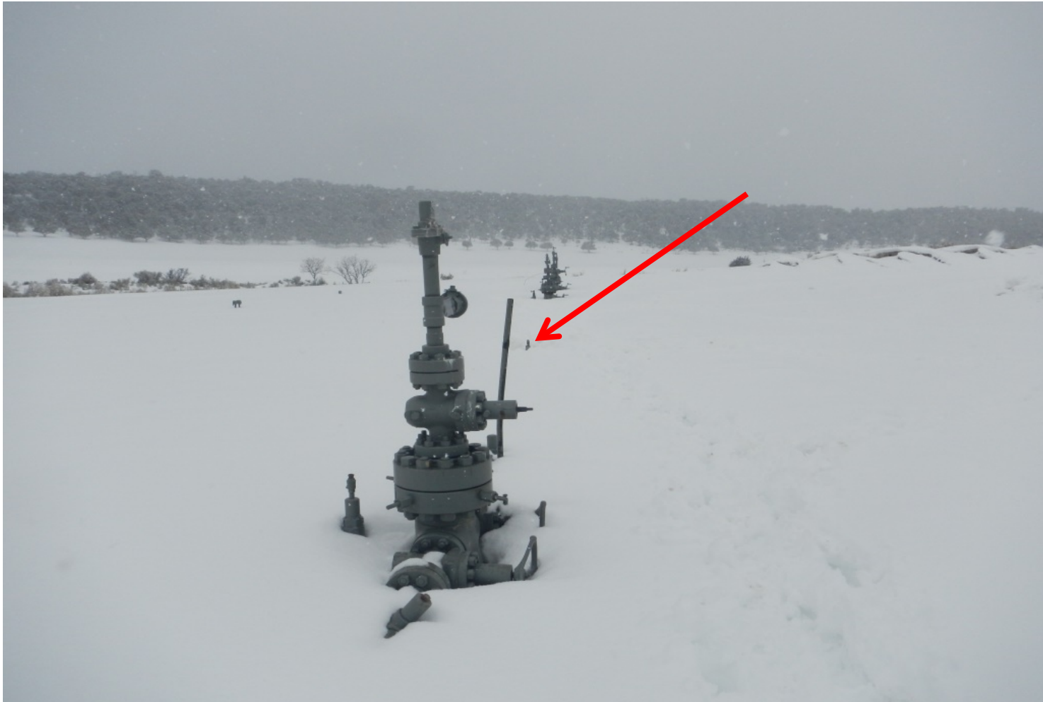
Photo#3: View of Well line , from 1 st Well in Line #045-07516 to NW. Arrow points to GPS position of Subject Well and unknown Facility / Riser shown in Photo#2

Inspection Photos: Encana Rose PA API#045-07517