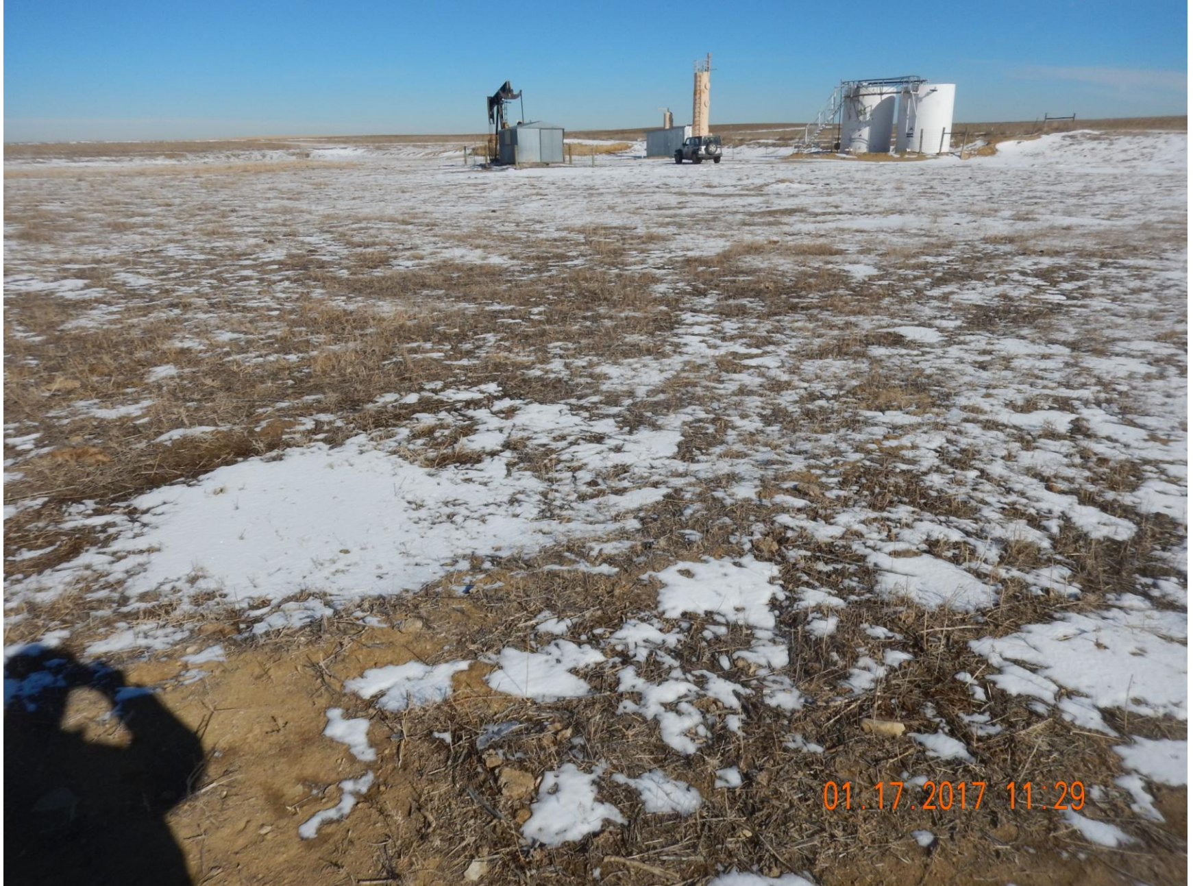
Figure 16: Photo taken from the southwest corner of the location, facing northeast. Photo shows large areas of the location that do not appear to be needed for production have not been reclaimed. Note vegetation on location predominantly undesirable weedy species such as russian thistle.