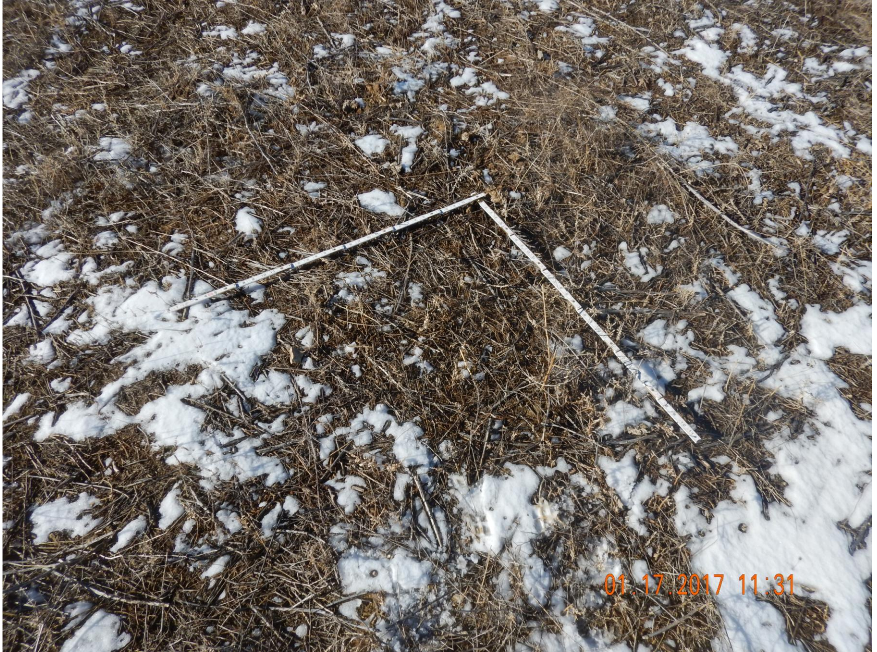
Figure 19: Photo taken from the southwest end of the location. Photo shows vegetation over the location. Note vegetation predominantly undesirable weedy species such as russian thistle.