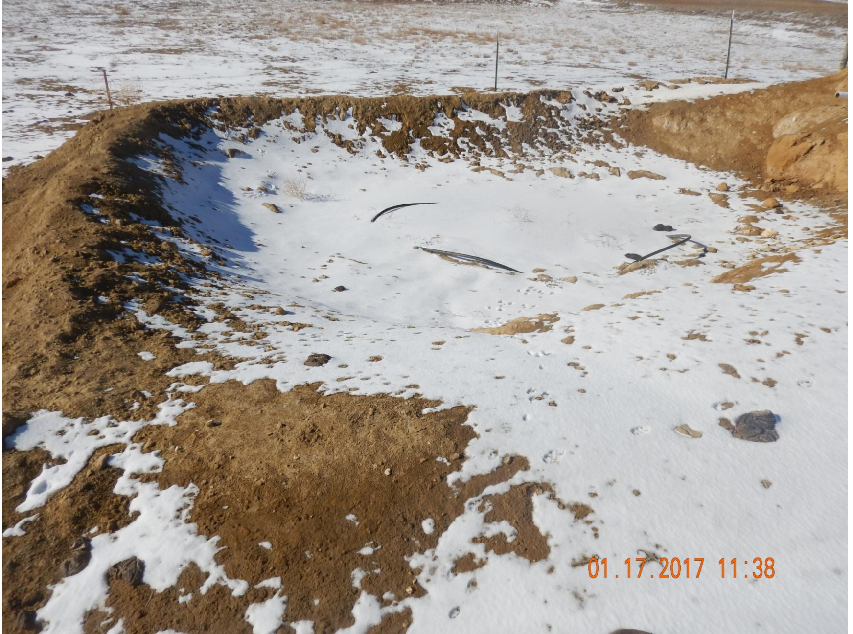
Figure 22: Photo taken from skim pit on the northeast end of the location, facing west.