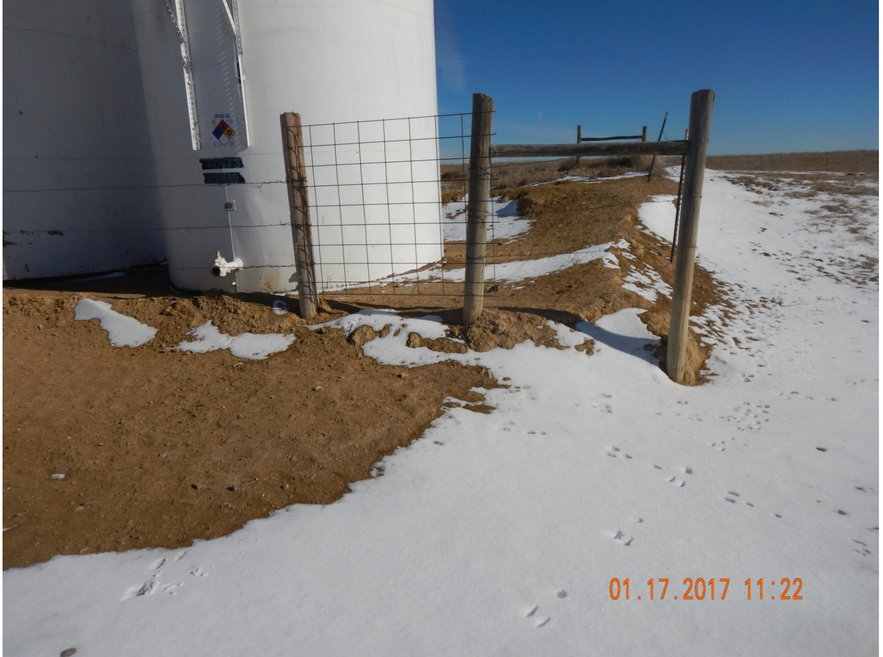
Figure 4: Photo taken from the southwest corner of the tank battery, facing east. Photo shows the earthen berm used as secondary containment is insufficient and unmaintained.