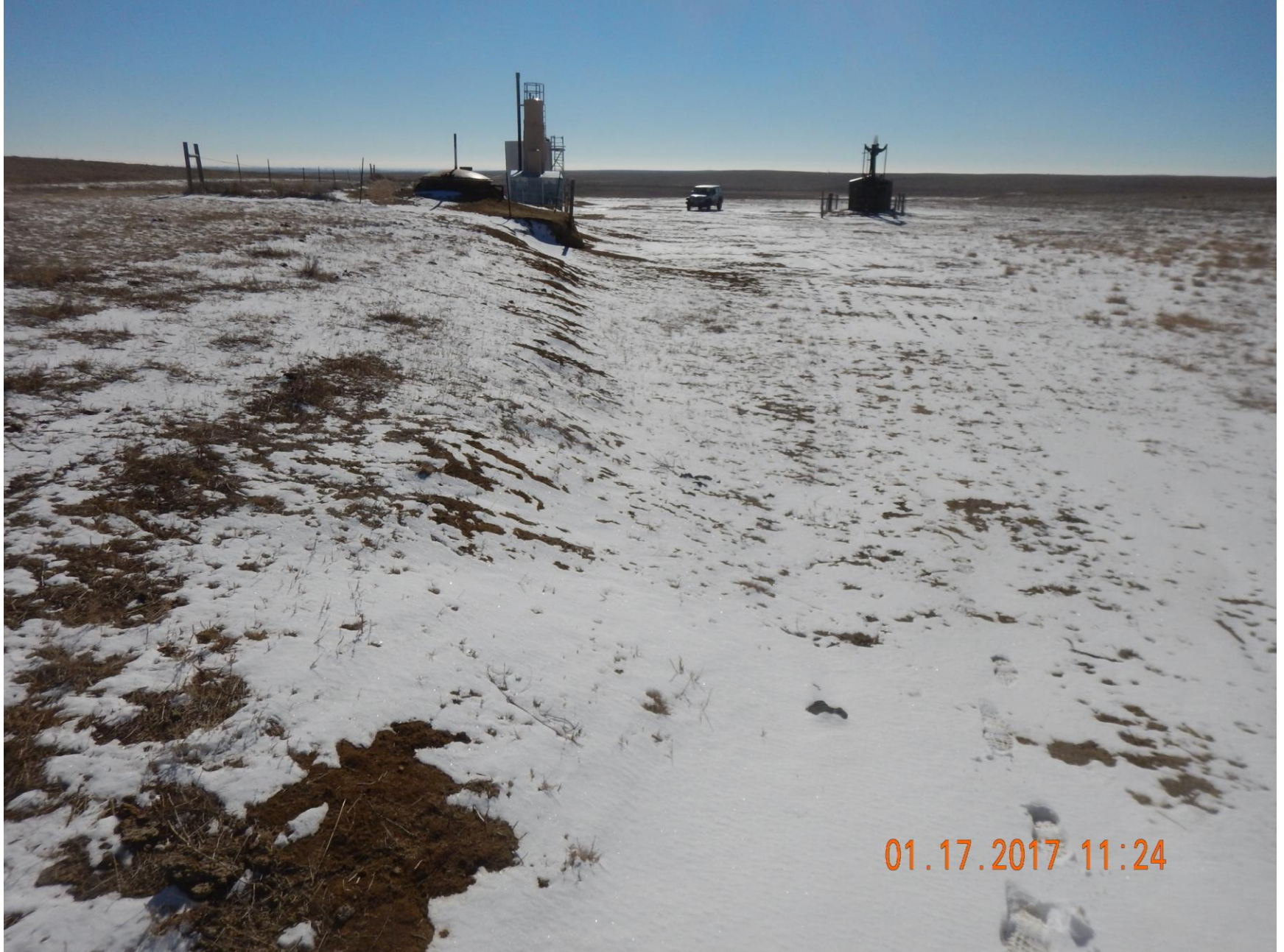
Figure 8: Photo taken from the northeast corner of the location, facing south. Photo shows location and interim area. Note road passing through area of location.