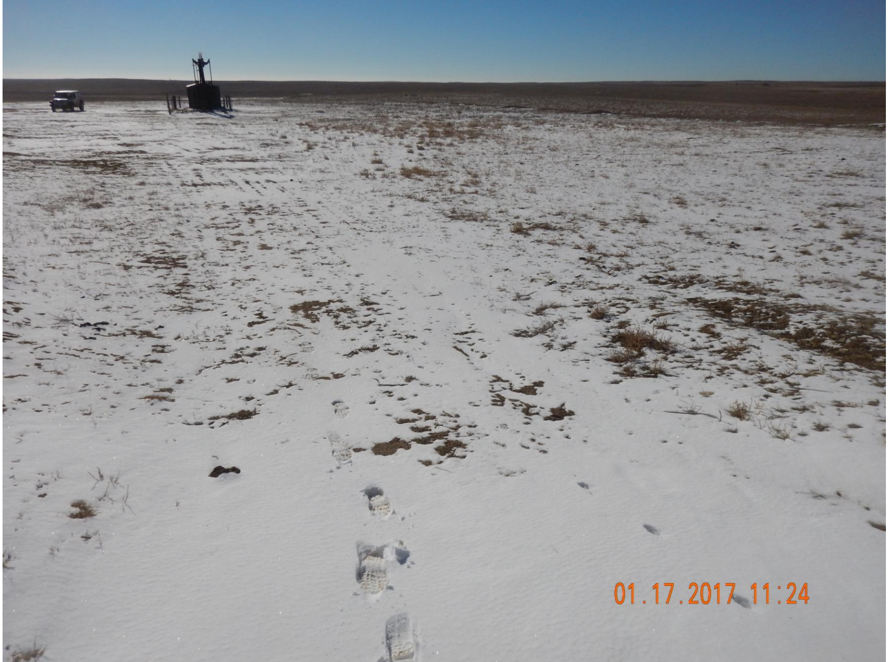
Figure 9: Photo taken from the northwest corner of the location, facing southwest. Photo shows the interim reclamation area. Note vegetation seen in photo predominantly undesirable weedy species such as russian thistle.