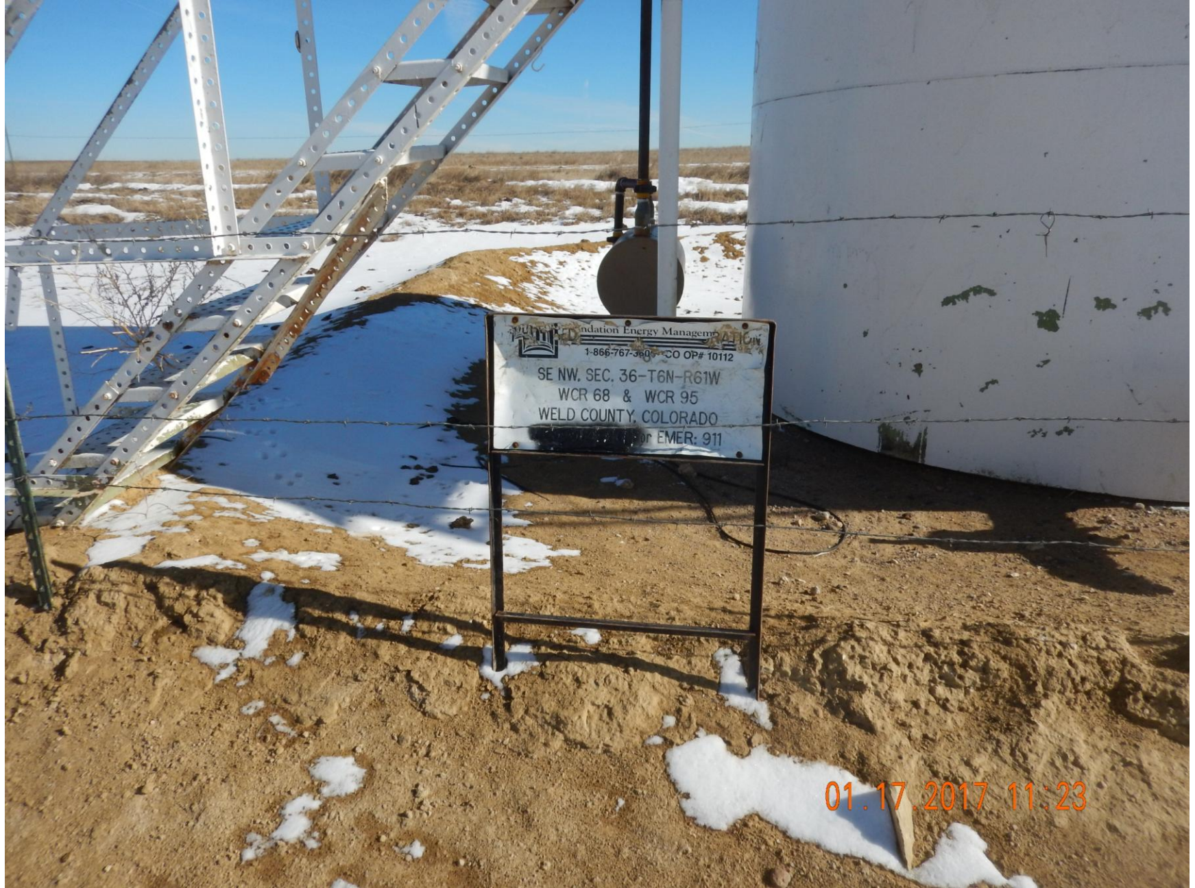
Figure 6: Photo taken from the tank battery, facing east. Photo shows sign has deteriorated in such a manner that the operator contact information is illegible.