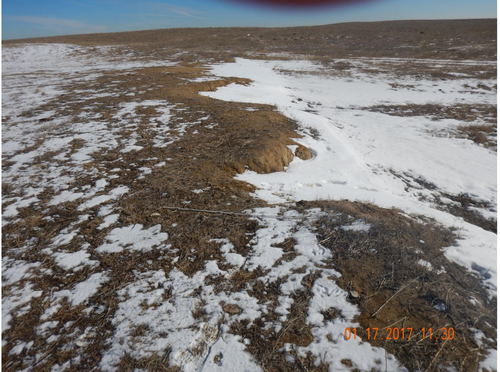
Figure 18: Photo taken from the south end of the location, facing east. Photo shows areas of the location experiencing degradation due to erosion.