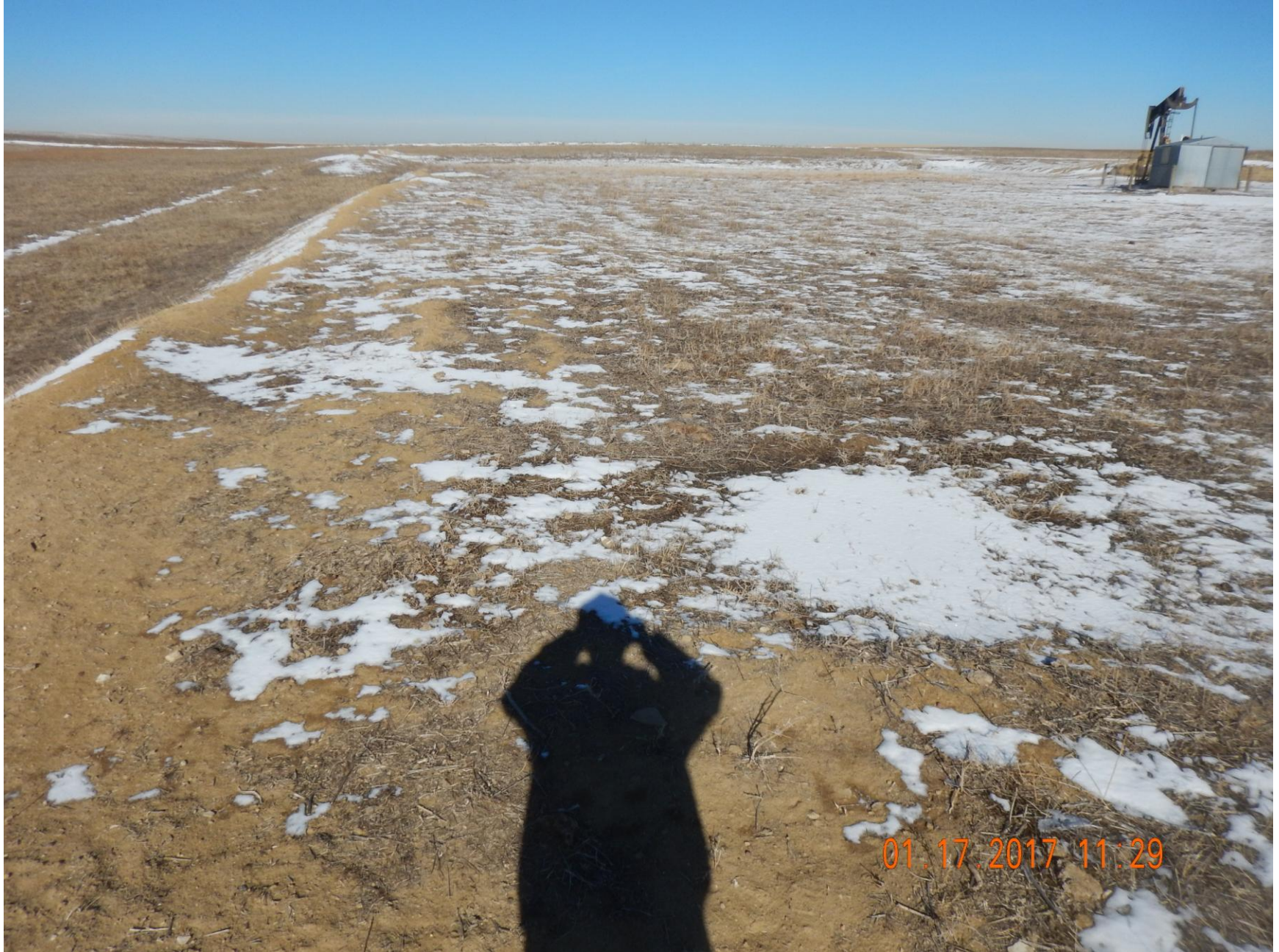
Figure 15: Photo taken from the southwest corner of the location, facing north. Photo shows large areas of the location that do not appear to be needed for production have not been reclaimed. Note vegetation on location predominantly undesirable weedy species such as russian thistle. Photo also shows location has not been recontoured.