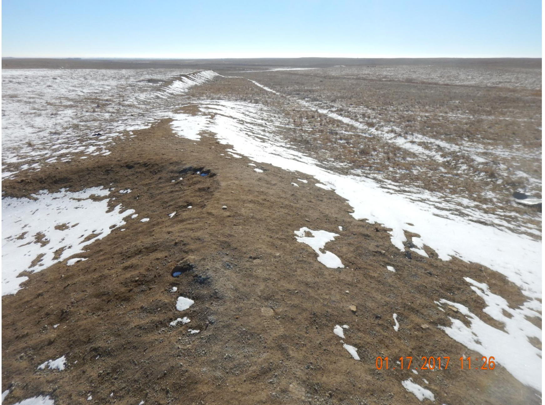
Figure 12: Photo taken from the northwest corner of the location, facing south. Photo shows areas not needed for production have not been reclaimed, including re-contouring.