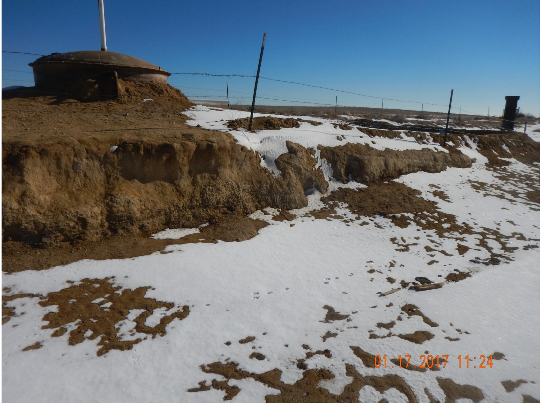
Figure 7: Photo taken from the northeast end of the location, facing southeast. Photo shows skim pit.