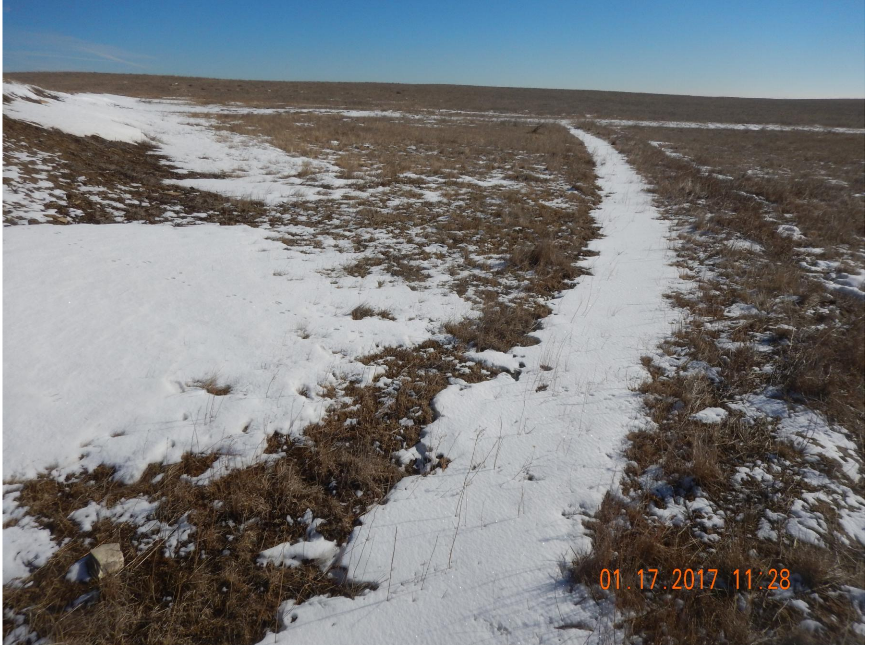
Figure 13: Photo taken from the southwest corner of the location, facing east. Photo shows stormwater ditch located on the western and southern perimeter of the location.