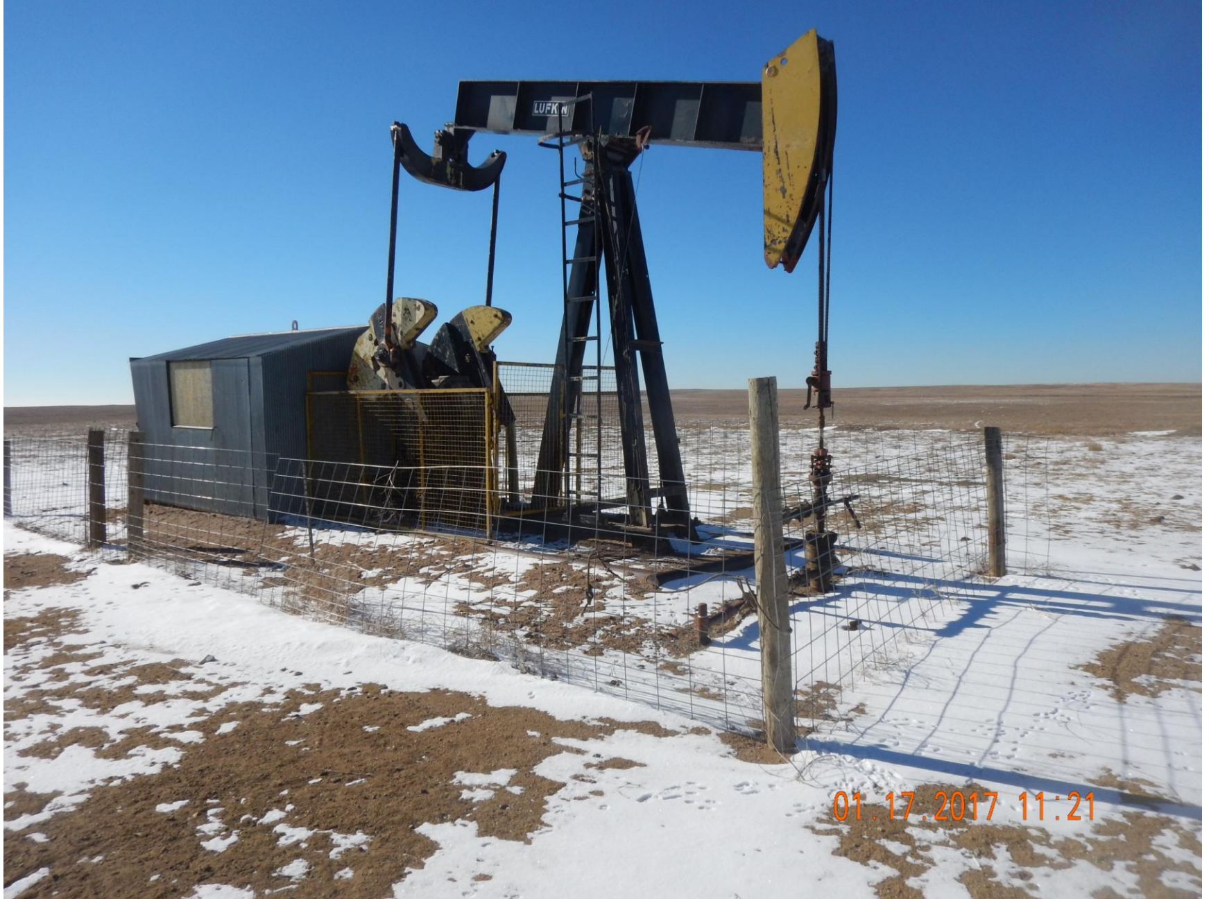
Figure 2: Photo taken from the location, facing west. Photo of pump-jack and well. Photo shows sign missing at wellhead.