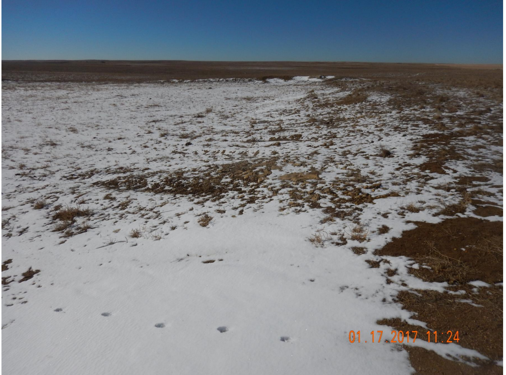
Figure 10: Photo taken from the northwest corner of the location, facing west. Photo shows the interim reclamation area. Note vegetation seen in photo predominantly undesirable weedy species such as russian thistle