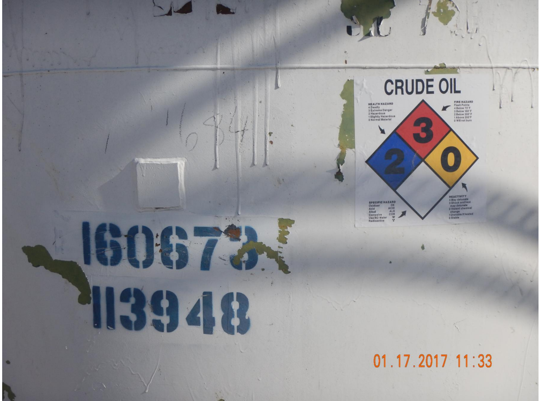
Figure 21: Photo taken from the northern tank. Photo shows a placard has been placed on the tank since inspection doc. #684901990. However tank missing 1) Name of operator, 2) Operator's emergency contact number and 3) Tank capacity.