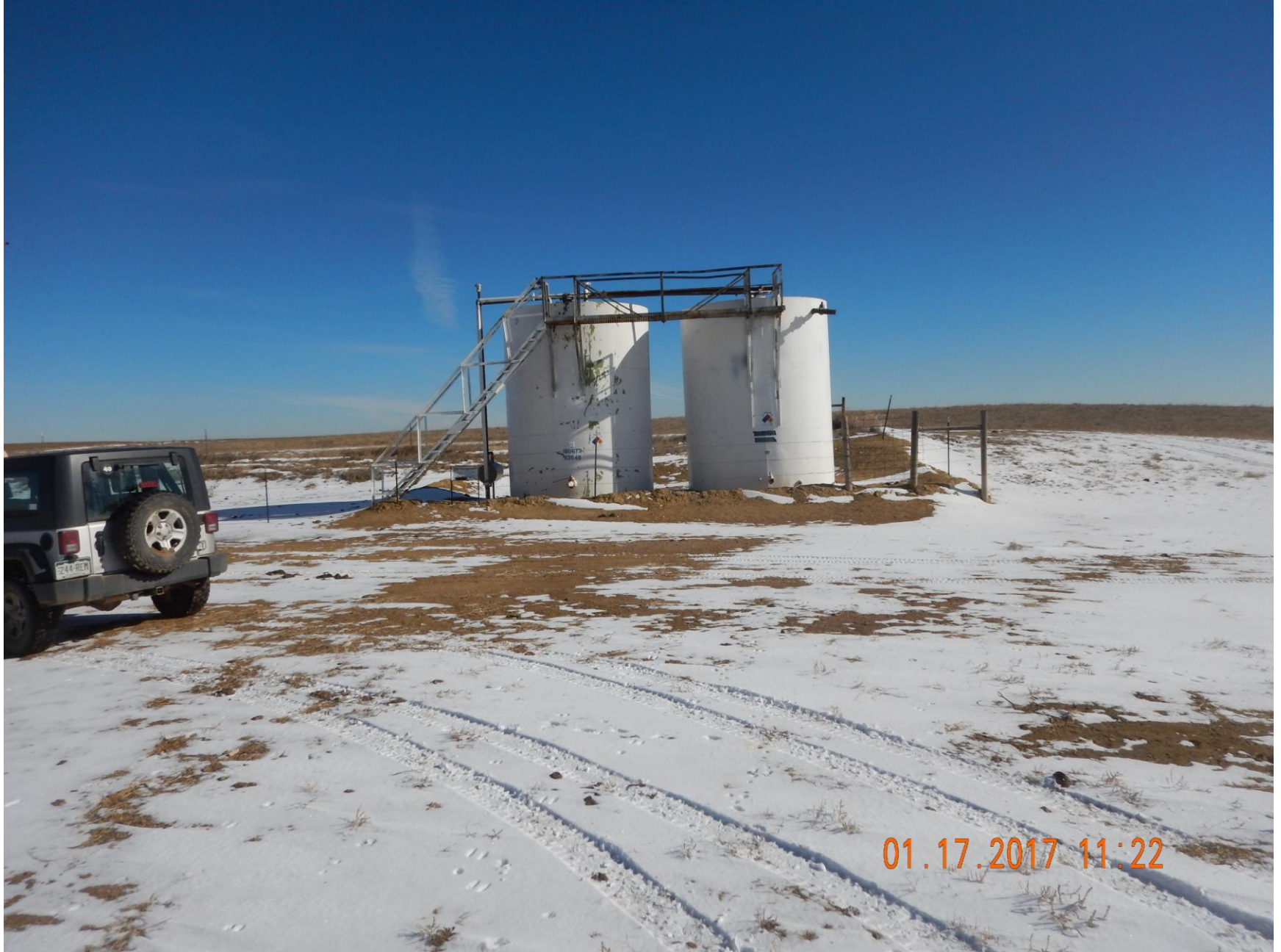
Figure 3: Photo taken from the location, facing east. Photo shows two tanks on the location. Photo also shows area where access road enters the location (right of photo).