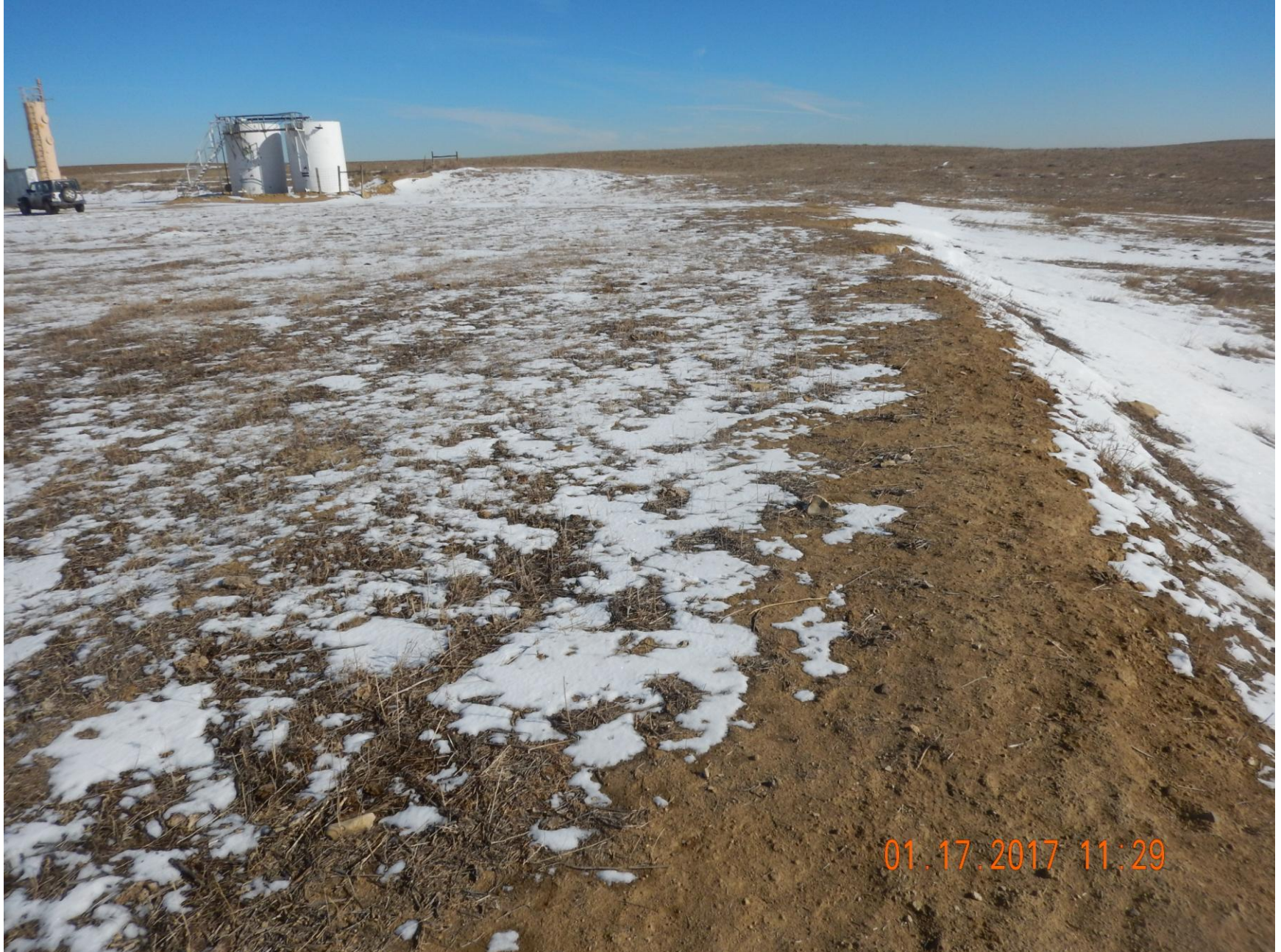
Figure 17: Photo taken from the southwest corner of the location, facing east. Photo shows large areas of the location that do not appear to be needed for production have not been reclaimed. Note vegetation on location predominantly undesirable weedy species such as russian thistle. Photo also shows location has not been recontoured.