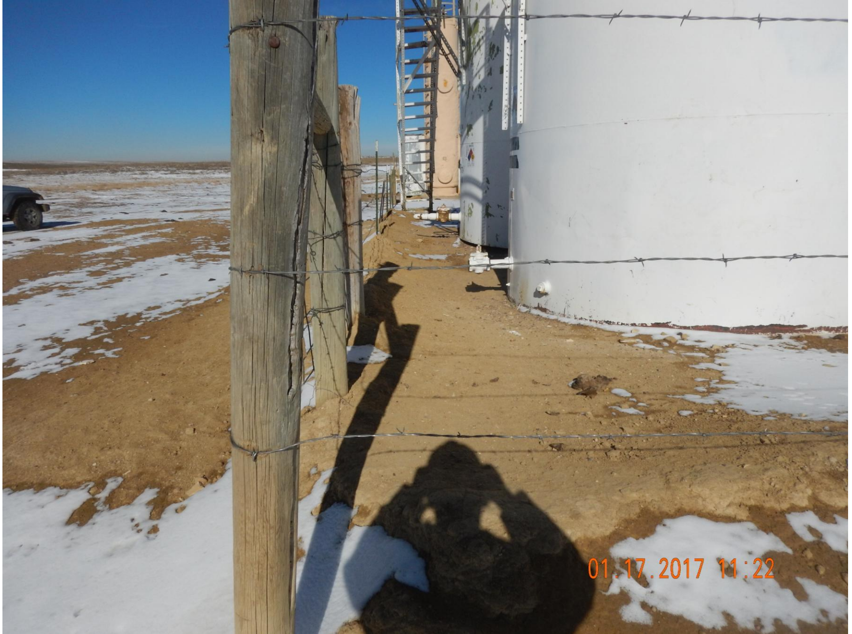
Figure 5: Photo taken from the southwest corner of the tank battery, facing north. Photo shows the earthen berm as secondary containment is insufficient and unmaintained.