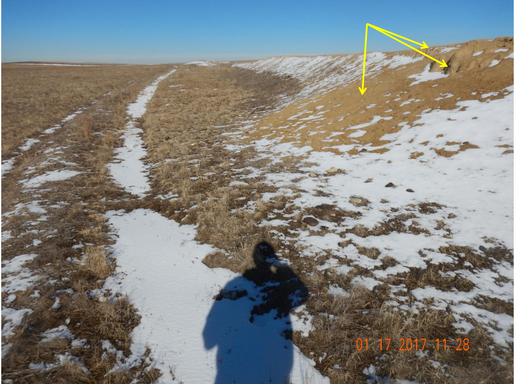
Figure 14: Photo taken from the southwest corner of the location, facing north. Photo shows stormwater ditch located on the western and southern perimeter of the location. Note erosion occurring on slope of the location to the right of the photos (yellow arrow). Photo also shows location has not been recontoured.