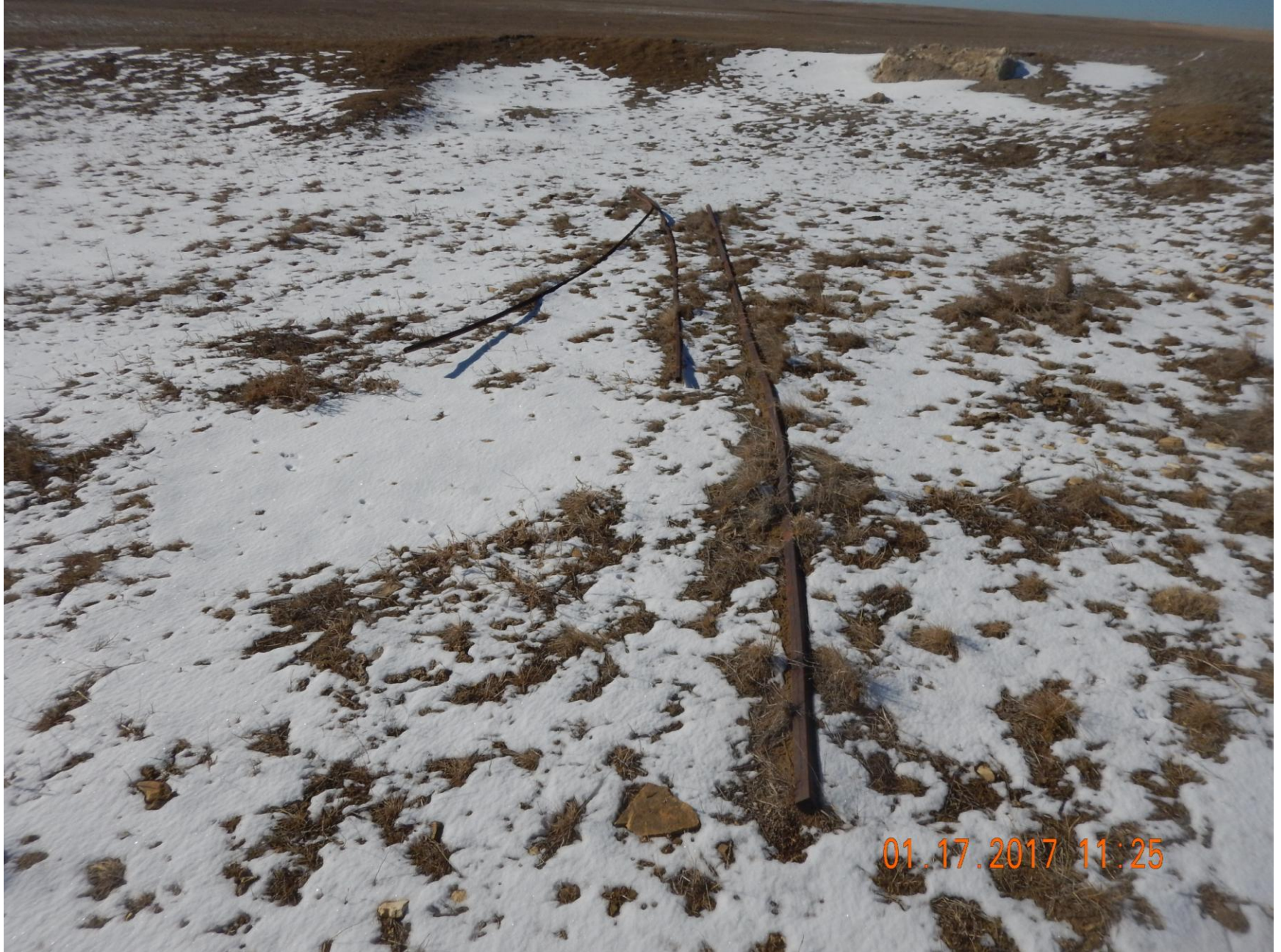
Figure 11: Photo taken from the northwest corner of the location. Photo shows square iron tubing being stored. This needs to be removed and properly stored/disposed.