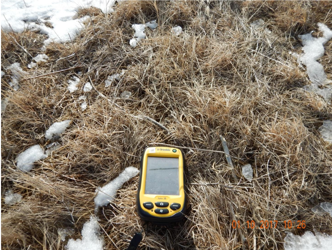
Photo 3. Photo taken from the southwest interim. Photo illustrating native, perennial vegetative growth, primarily blue grama ( Bouteloua gracilis ).