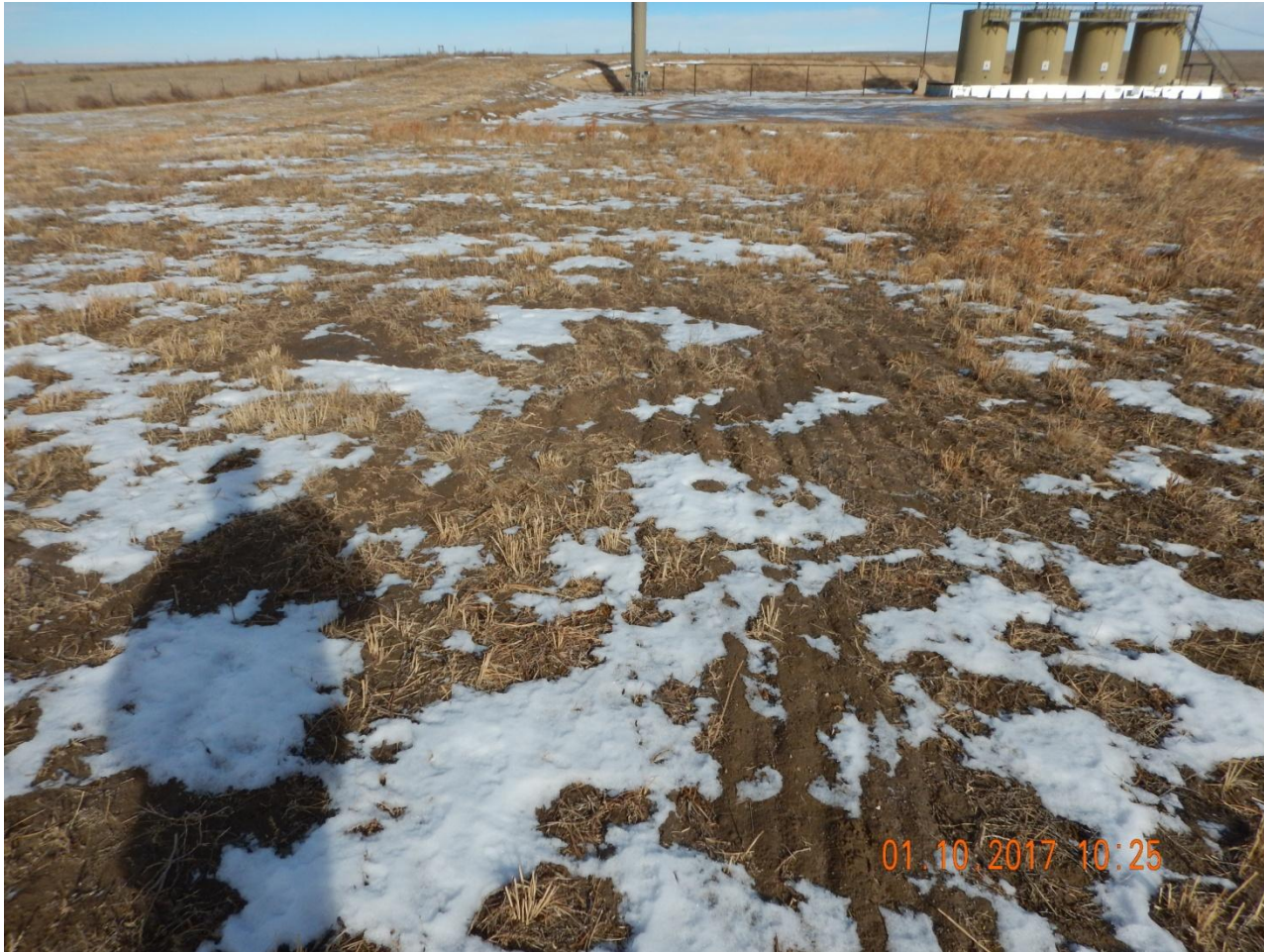
Photo 2. Photo taken from the southwest interim area, facing North. The southwest interim area is progressing towards reflective percent plant cover of reference areas. Location mowed to control undesirable weedy species like Kochia.

COLORADO Oil & Gas Conservation Commission Department of Natural Resources