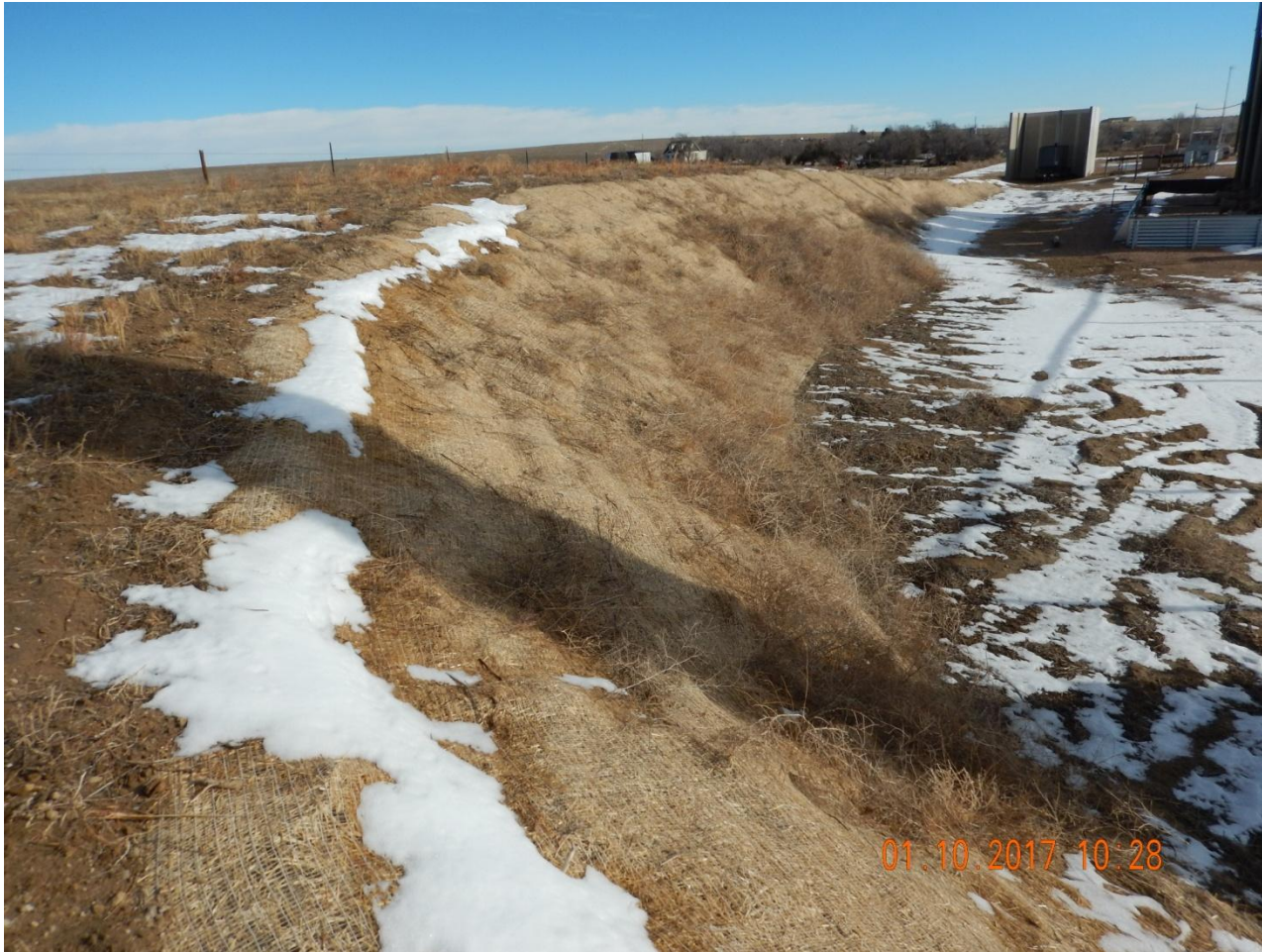
Photo 4. Photo taken from the northwest location, facing East. Cut slope appears to be stabilized using a blanket even though no observable plant growth has established.