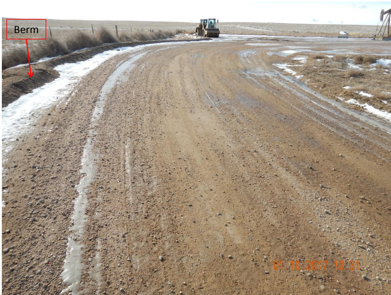
Photo 6. Photo taken from entrance of location, facing South. Location has a berm ~12" in height built around the southern and eastern perimeter of the location. However, no structural stormwater BMP was observed at the potential discharge point which would appear to be at the entrance.