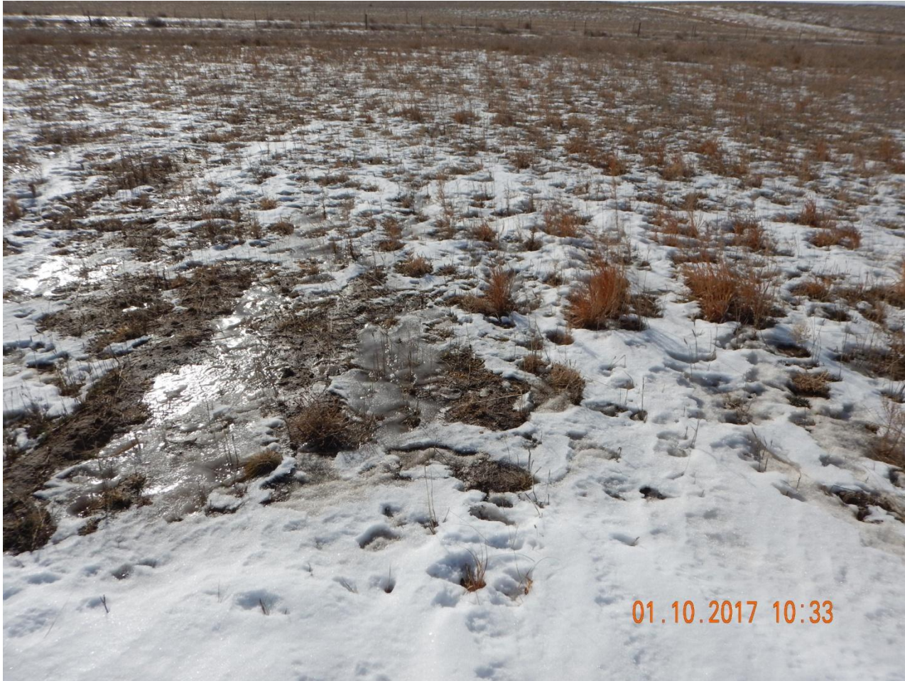
Photo 1. Photo taken from the southern interim area, facing South. The southern interim area is progressing towards reflective percent plant cover of reference areas. However, areas do have weedy, annual plant species like Kochia that remain dominant. Location will be inspected in the future to comply with Rule 1003 standards.