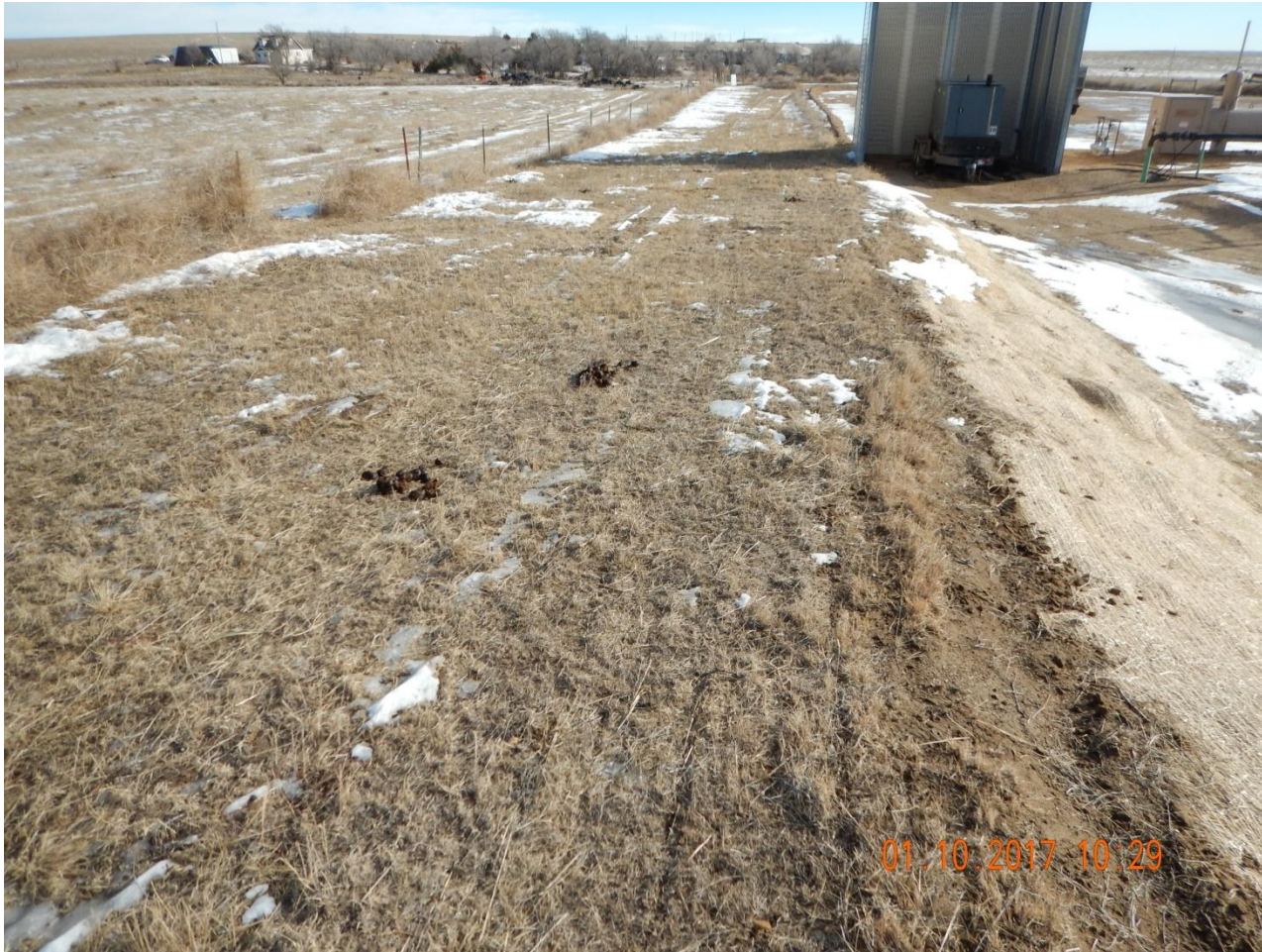
Photo 5. Photo taken from the northern interim area, facing East. The interim area appears to have sufficient vegetative cover that is reflective of reference areas.