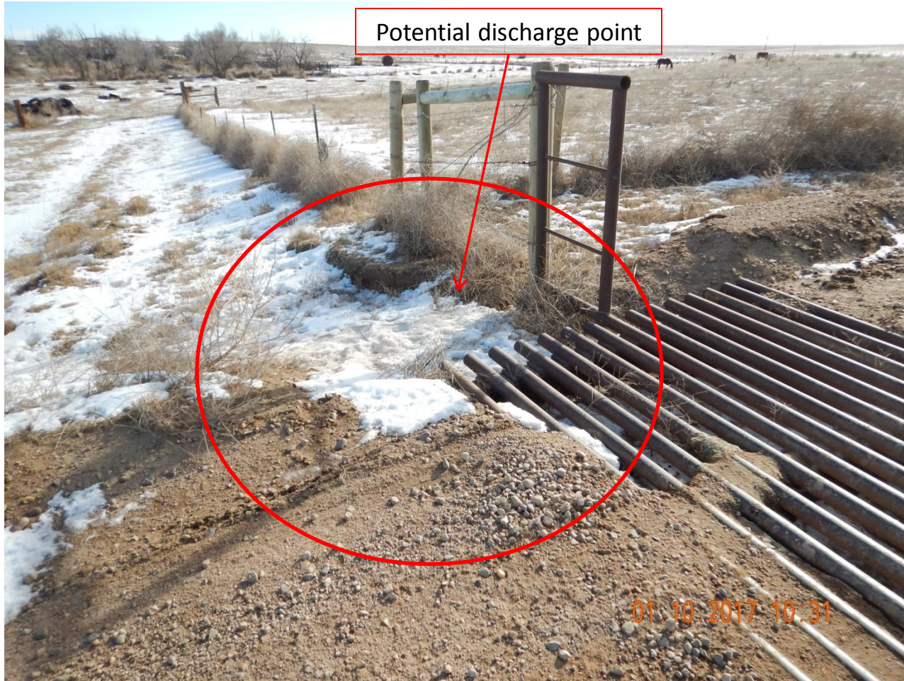
Photo 7. Photo taken from entrance of location, facing East. Location has a berm ~12" in height built around the southern and eastern perimeter of the location. However, no structural stormwater BMP was observed at the potential discharge point which would appear to be at the entrance.