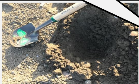
Sample (#5) collected at 3:54pm Depth: 6-18"