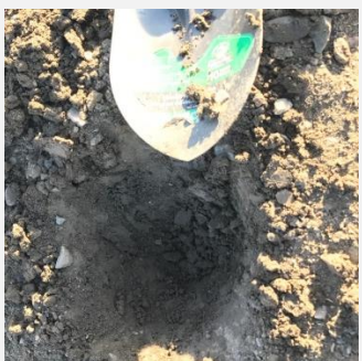
Sample (#6) collected at 3:50pm Depth: 6-18"