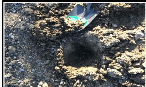
Sample (#4) collected at 3:43pm Depth: 6-18"

Submitted for the purpose of Soil Sampling/Analytical Results taken on 12/09/2016