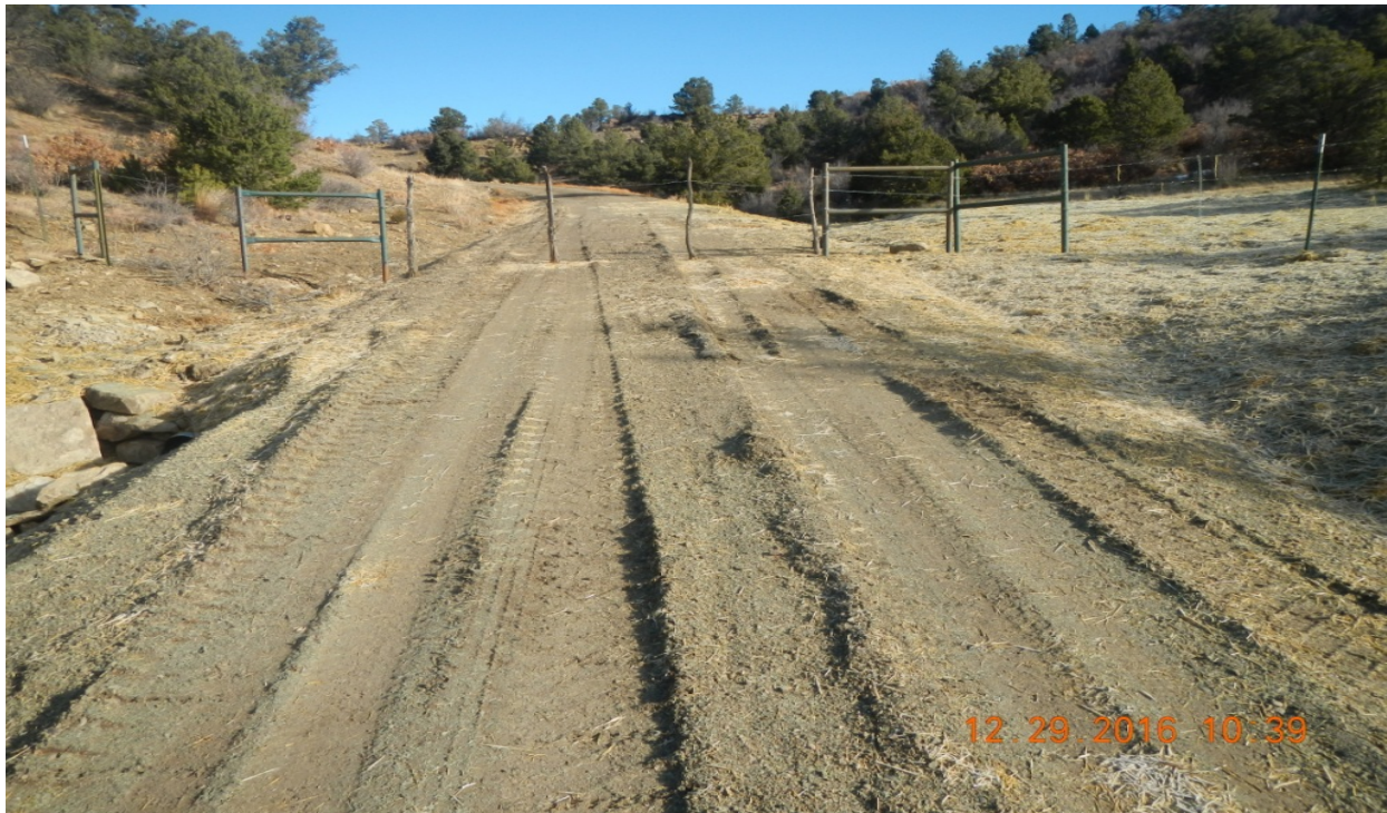
photo 3: Facing northeast at the second gate along the access road.