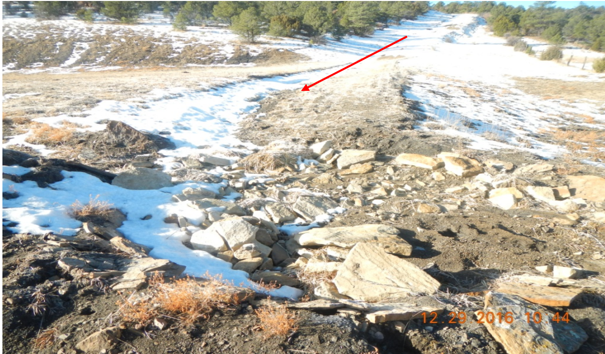
photo 7: The sediment trap at the northeast side of the location is filled in with sediment. Diversion ditch indicated by the red arrow directs stormwater from the access road to this sediment trap.