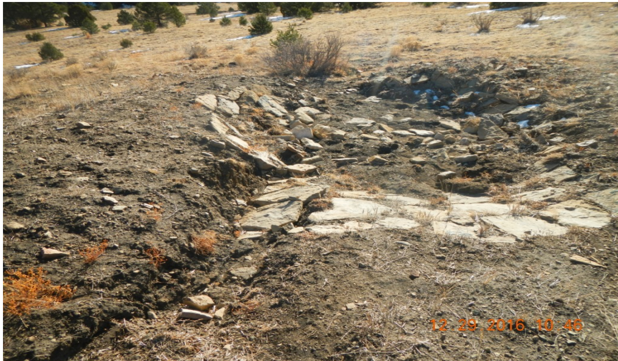
photo 9: The sediment trap at the southeast corner is filled in with sediment.