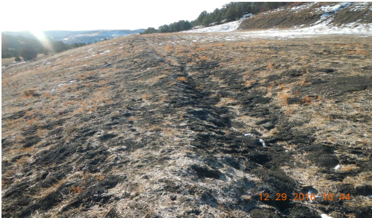
photo 8: Facing south toward the location along the fill slope. Desirable vegetation does not appear to be established along the fill slope.