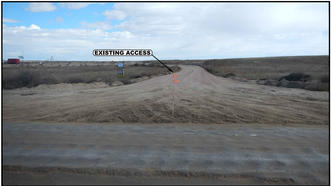
PHOTO: VIEW OF EXISTING ACCESS