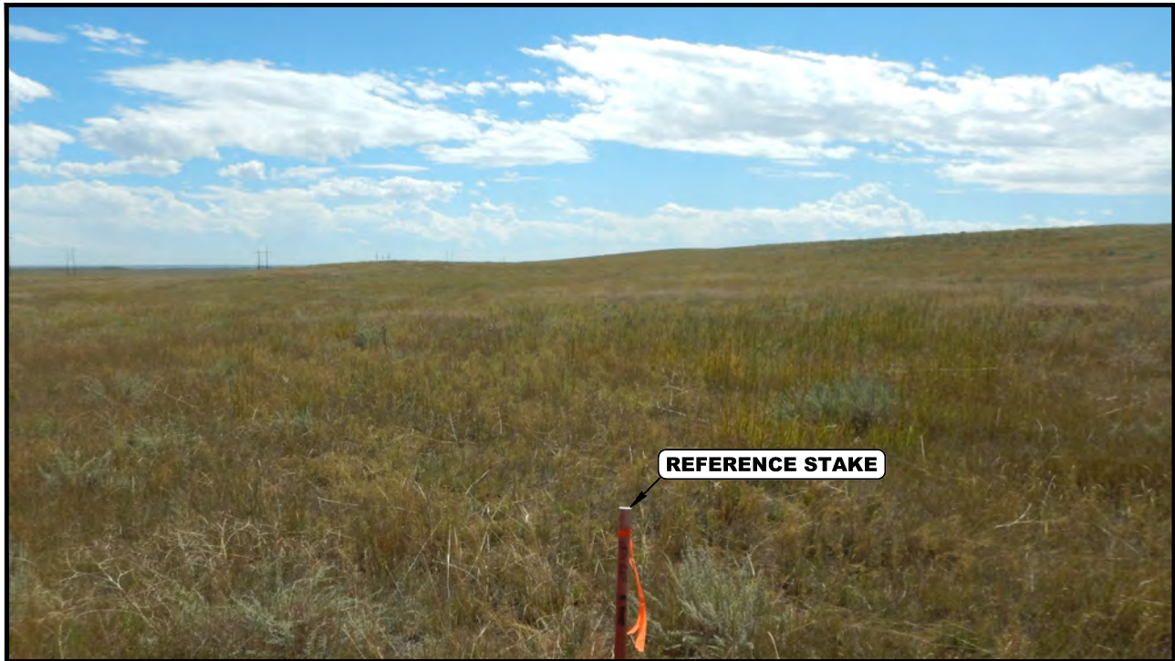
PHOTO: VIEW OF REFERENCE AREA