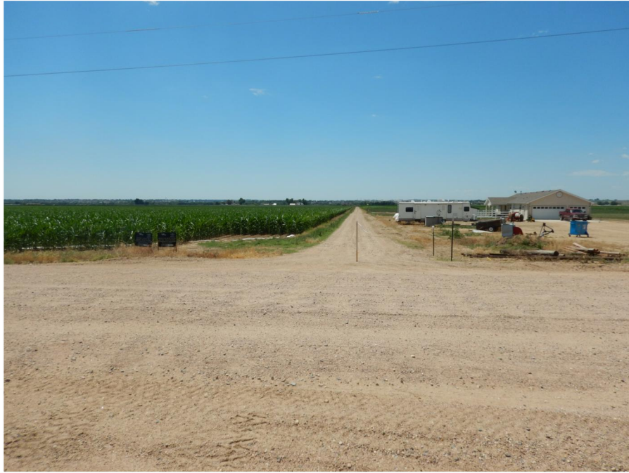
PICTURE OF GOETZEL 25-29 ACCESS ROAD - CAMERA ANGLE SOUTH