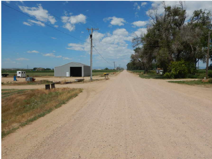
PICTURE OF GOETZEL 25-29 ACCESS ROAD - CAMERA ANGLE WEST