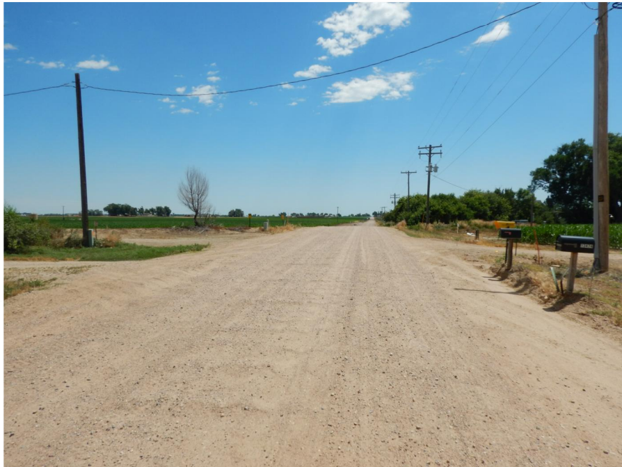
PICTURE OF GOETZEL 25-29 ACCESS ROAD - CAMERA ANGLE EAST