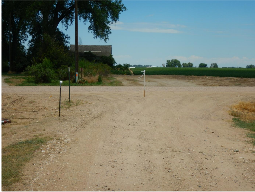
PICTURE OF GOETZEL 25-29 ACCESS ROAD - CAMERA ANGLE NORTH