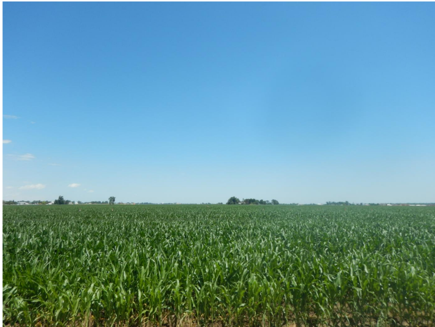
PICTURE OF GOETZEL 7-29 WELL PAD LOCATION - CAMERA ANGLE EAST