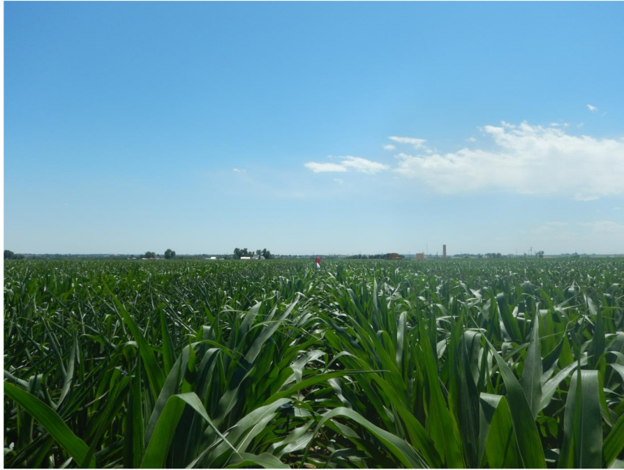
PICTURE OF GOETZEL 7-29 WELL PAD LOCATION - CAMERA ANGLE SOUTH