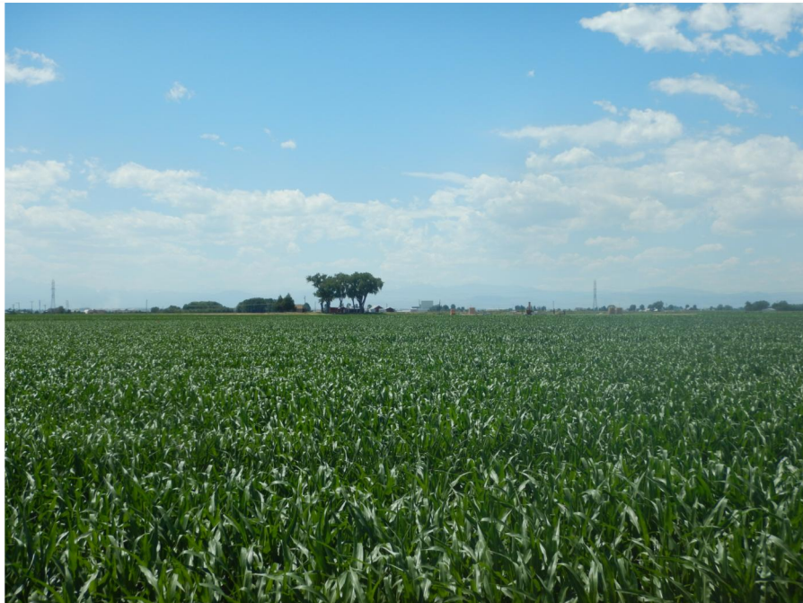
PICTURE OF GOETZEL 7-29 WELL PAD LOCATION - CAMERA ANGLE WEST