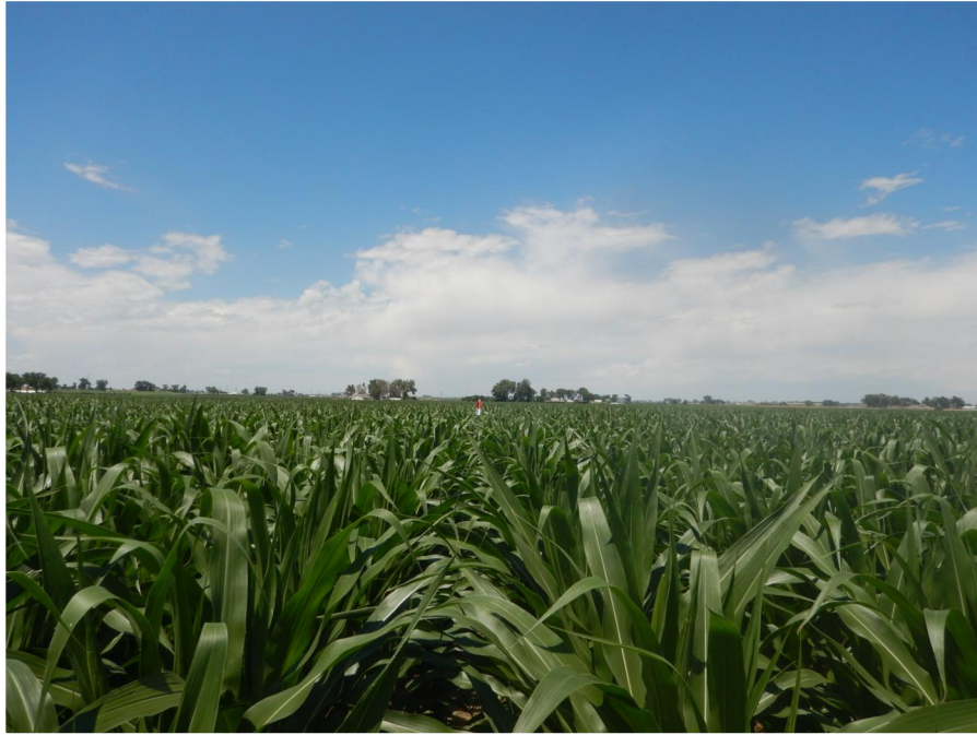
PICTURE OF GOETZEL 7-29 WELL PAD LOCATION - CAMERA ANGLE NORTH