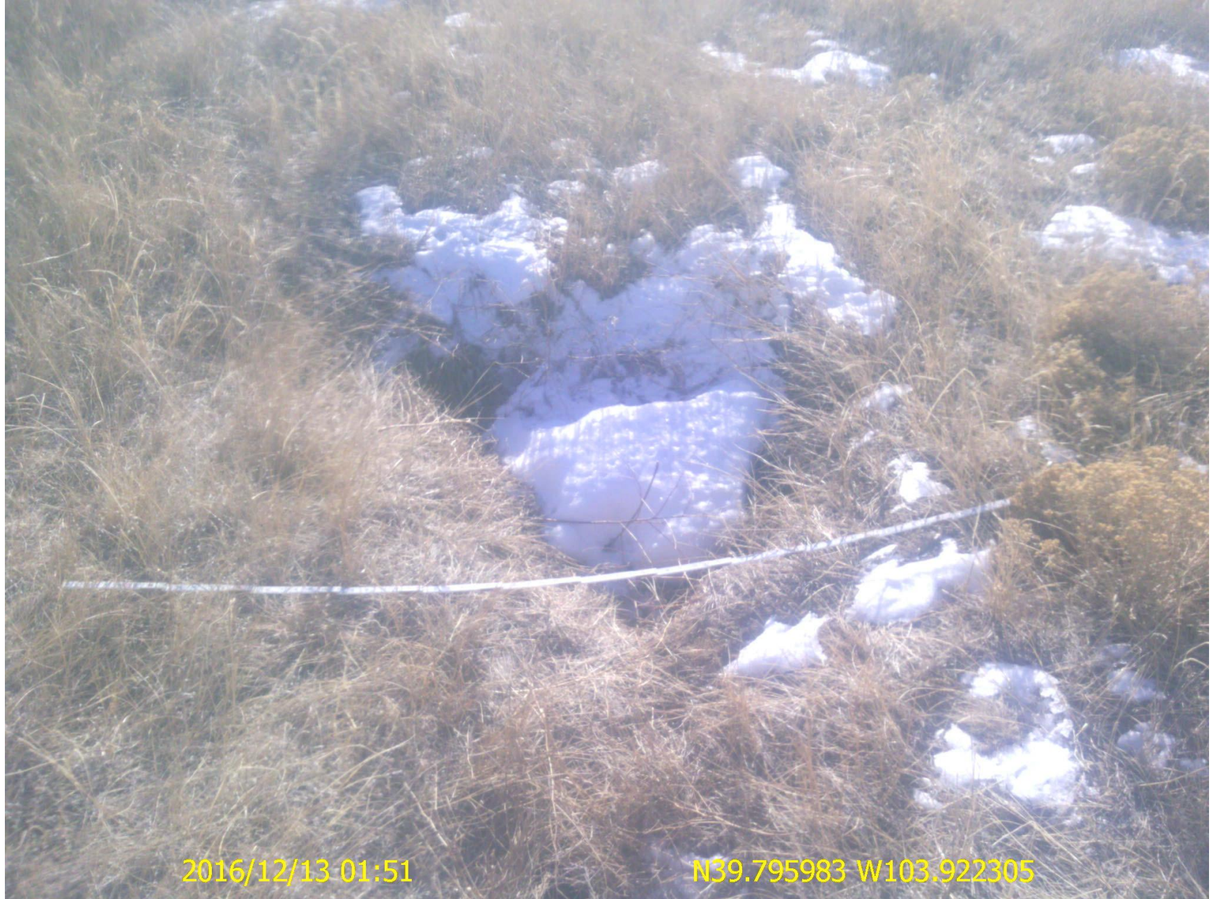
Figure 2: Photo of hole found on location. 6' measuring stick for reference. Hole is approximately 2 feet deep. See photos from inspection Doc. #682501125 for additional information and details