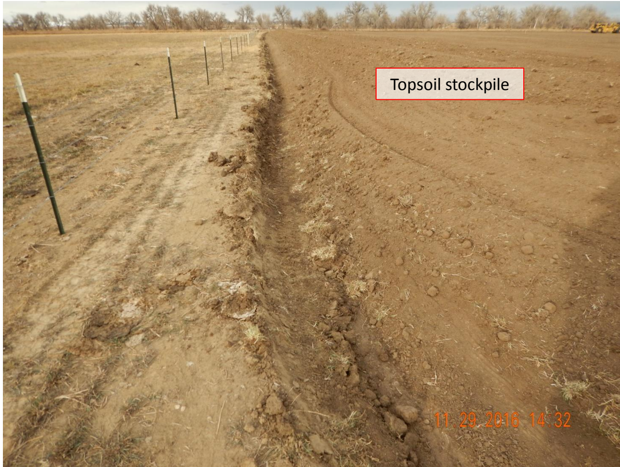
Photo 5. Photo taken from the southwest location, facing North. Ditch and berm BMP installed around perimeter of location. Topsoil stockpile stored along southern and western perimeter of location.