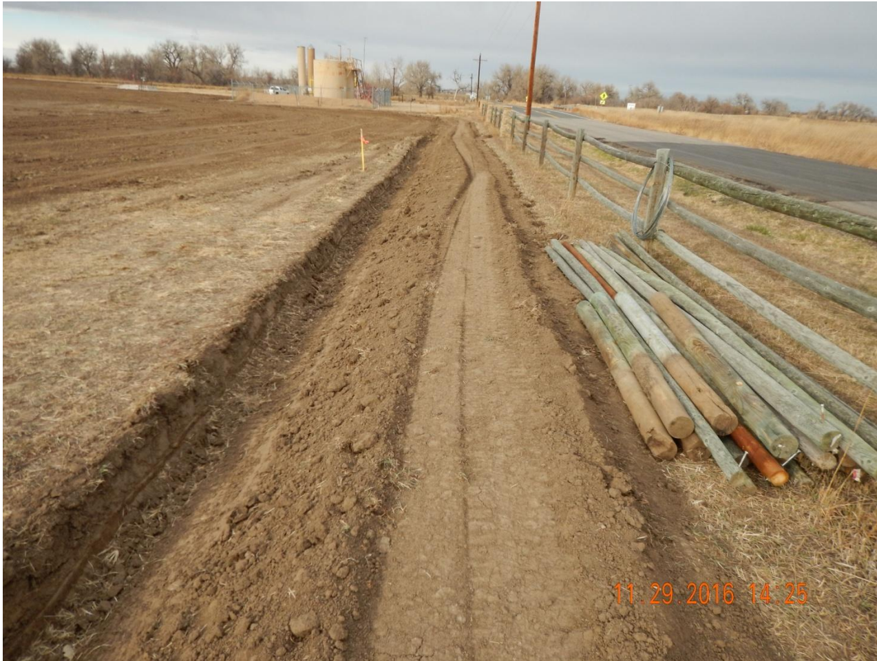
Photo 3. Photo taken from location entrance, facing North. Ditch and berm BMP installed around perimeter of location.