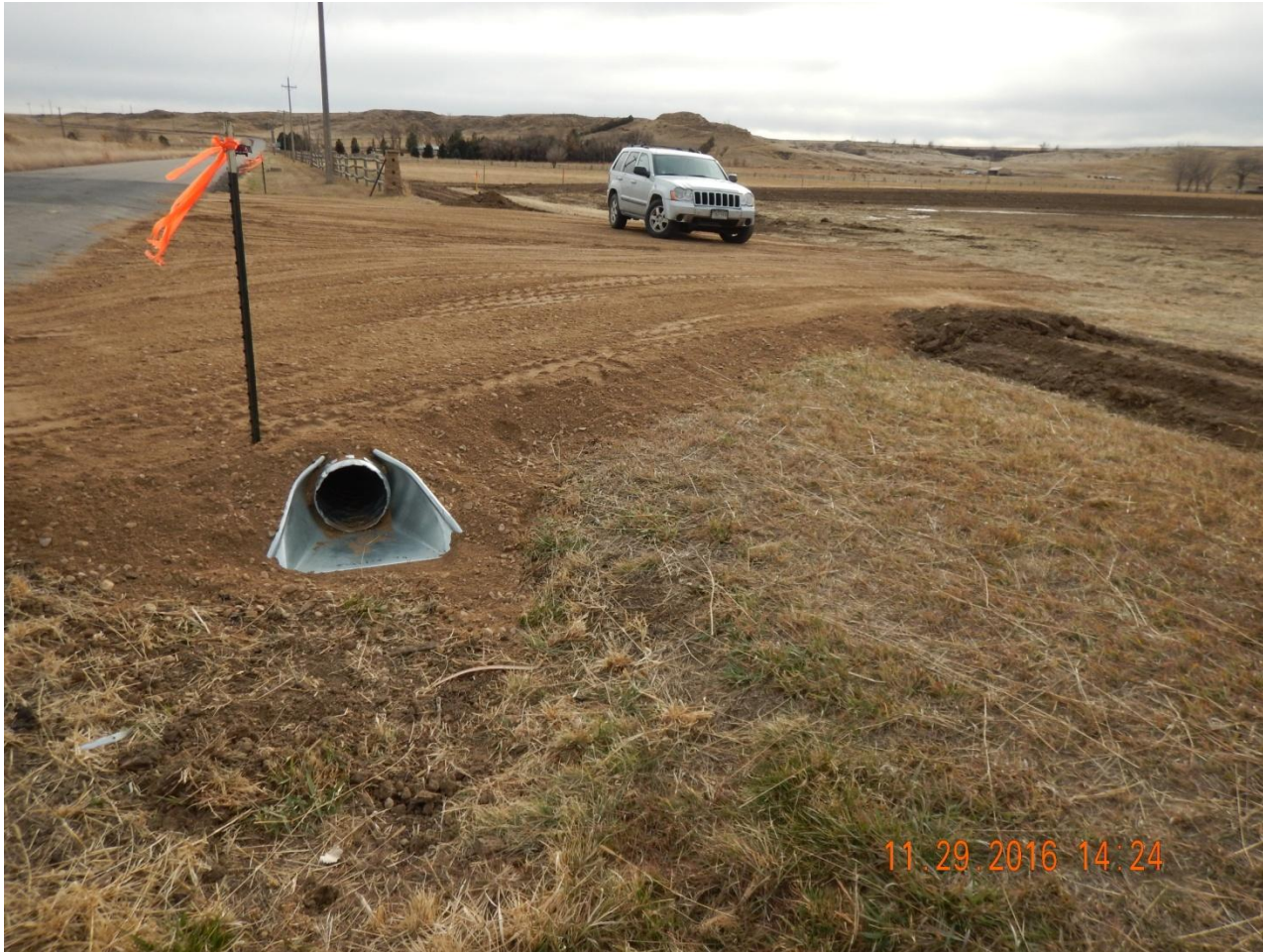
Photo 1. Photo taken from location entrance, facing South. Culvert installed in-line with borrow ditch.