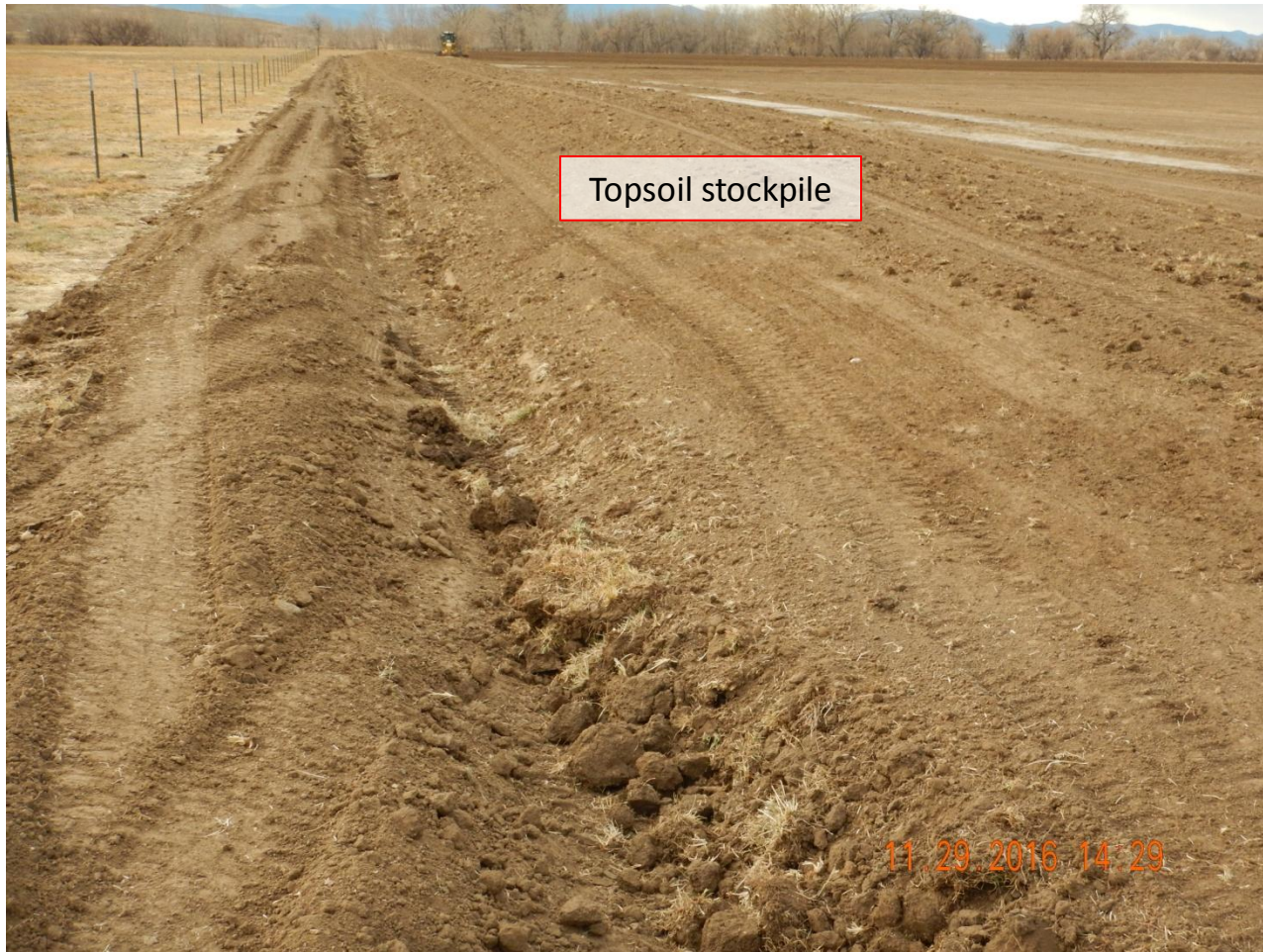
Photo 4. Photo taken from the southern location, facing West. Ditch and berm BMP installed around perimeter of location. Topsoil stockpile stored along southern and western perimeter of location.