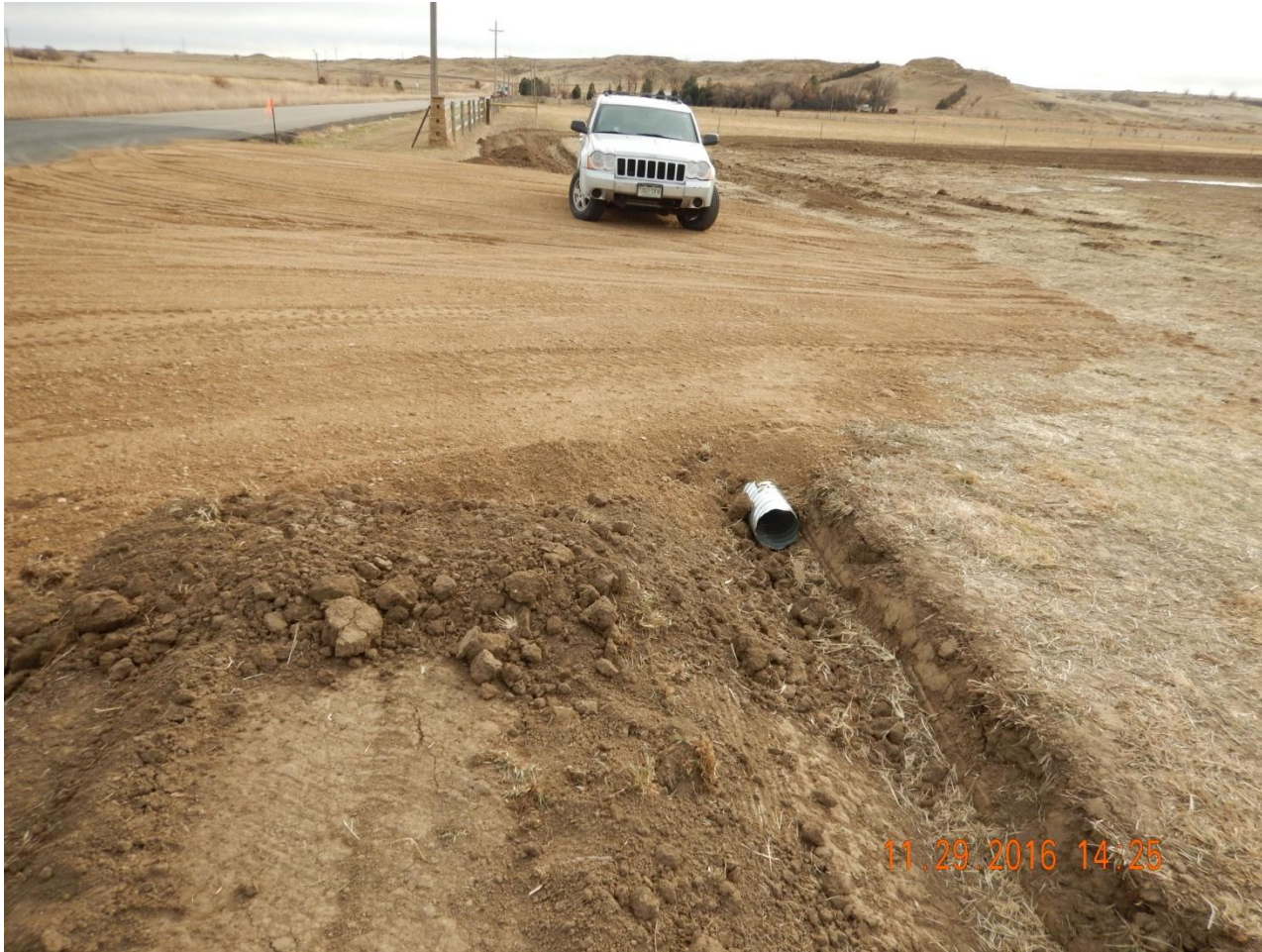
Photo 2. Photo taken from location entrance, facing South. Culvert installed in-line with ditch and berm BMP.