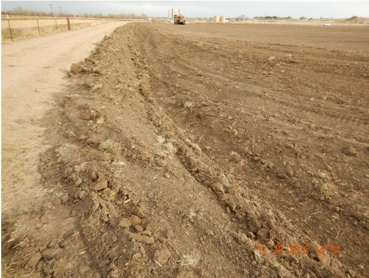
Photo 6. Photo taken from the northwest location, facing East. Ditch and berm BMP installed around perimeter of location.