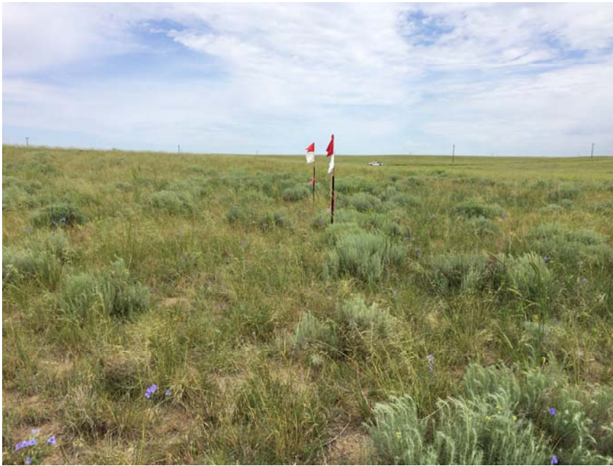
LOCATION LOOKING NORTH

Z:\PROJECTS\1319-01_BONANZA\5N-62W\DWG\STATE ANTELOPE 41-11\STATE ANTELOPE 41-11 EXPANSION MAP.dwg SAVED DATE 2016-07-07 15:33