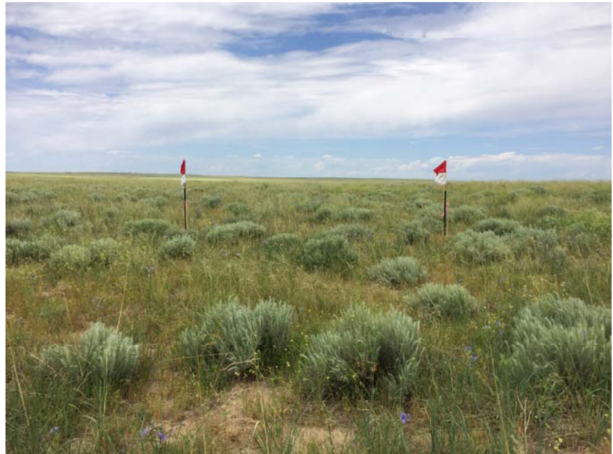
LOCATION LOOKING WEST