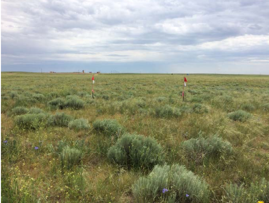
LOCATION LOOKING EAST