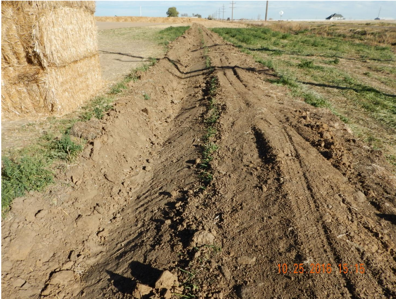
Photo 3. Photo taken from southwest corner of perimeter, facing East. Ditch and berm constructed around outer perimeter of the location.