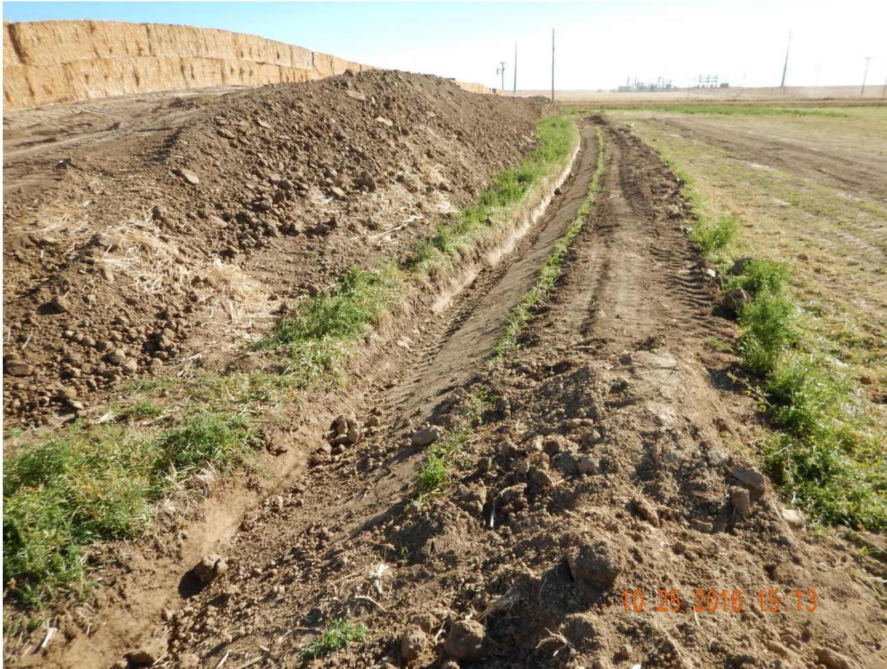
Photo 2. Photo taken from northwest corner of perimeter, facing South. Ditch and berm constructed around outer perimeter of the location.