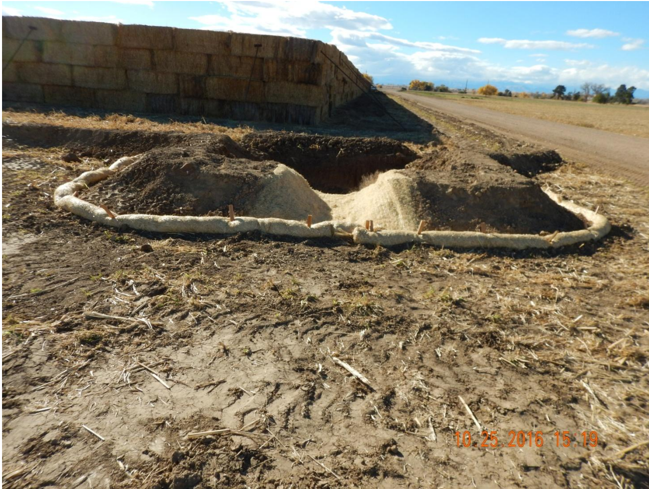
Photo 5. Photo taken from northeast corner of perimeter, facing West. Stabilized sediment trap installed.