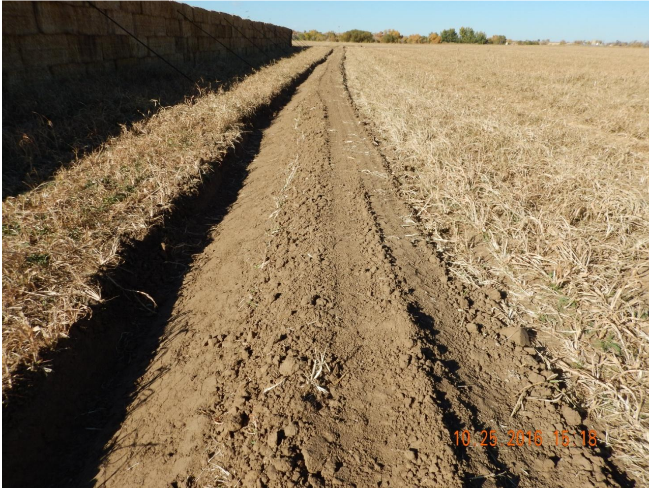
Photo 4. Photo taken from southeast corner of perimeter, facing North. Ditch and berm constructed around outer perimeter of the location.