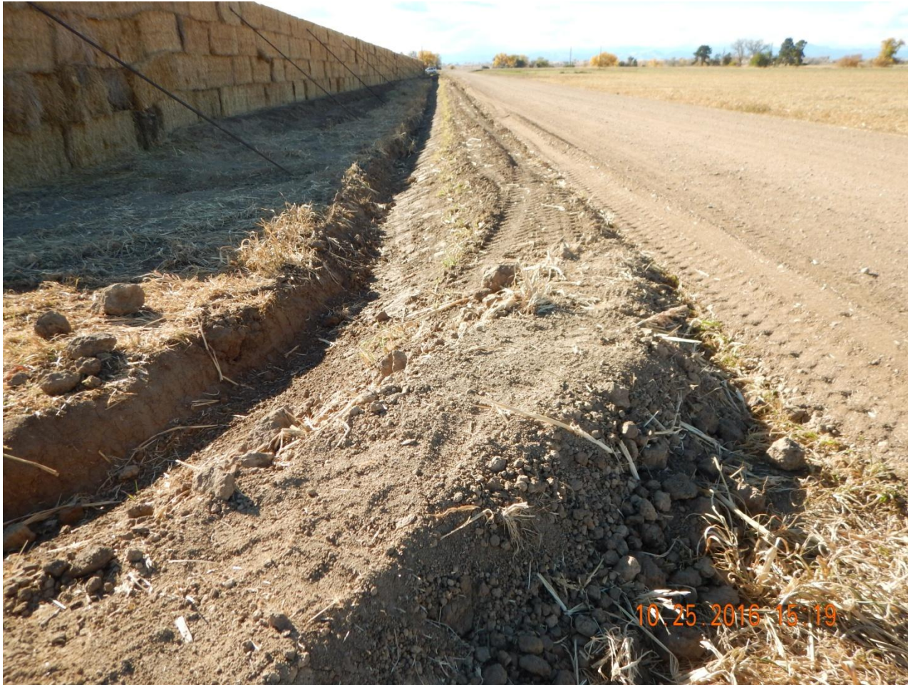
Photo 6. Photo taken from northeast corner of perimeter, facing West. Ditch and berm constructed around outer perimeter of the location.