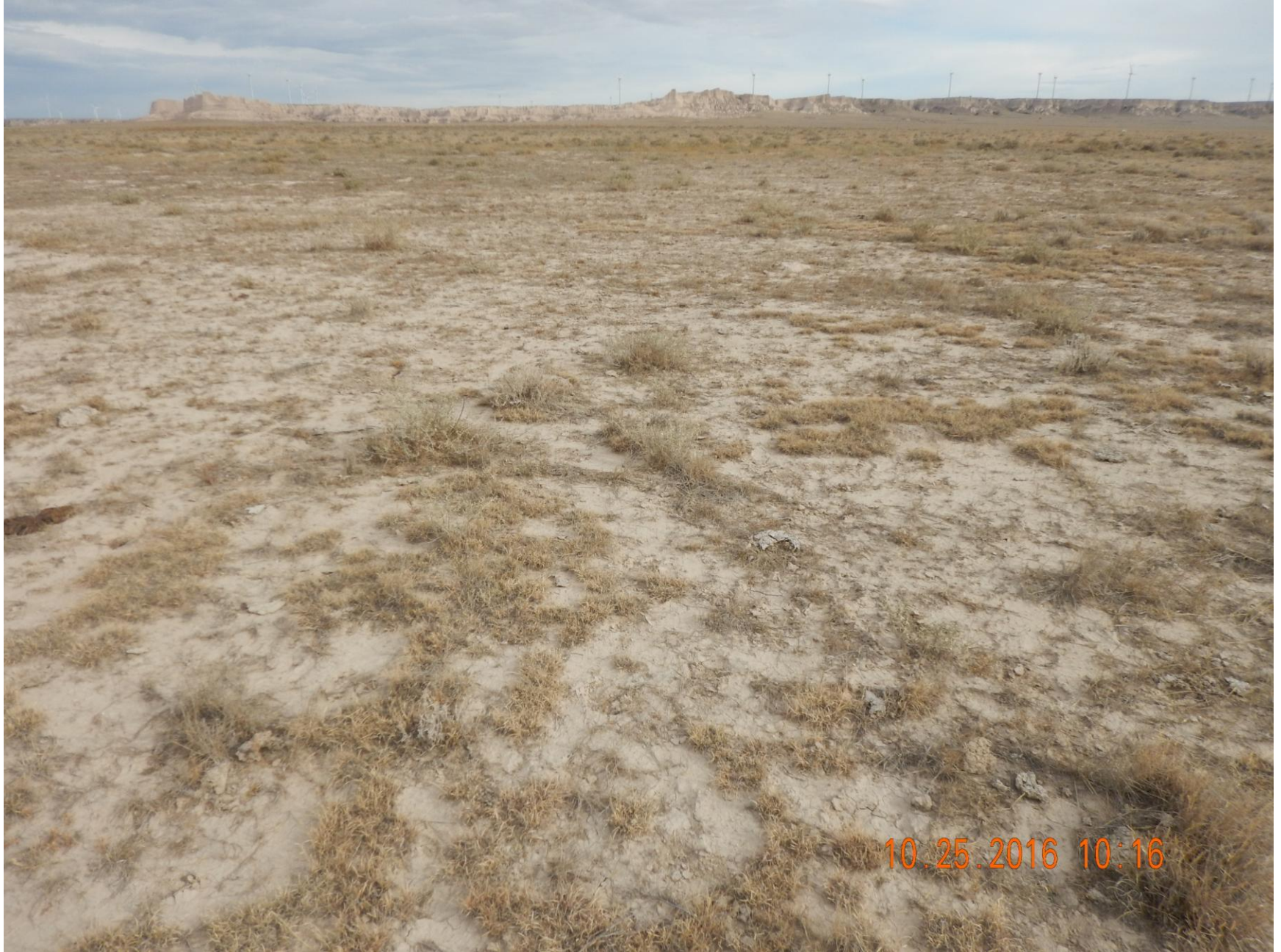
Figure 8: Photo taken from the southeast corner of the location, facing north. Photo shows vegetation over the reclamation area. Note large portions of the location remains unvegetated.