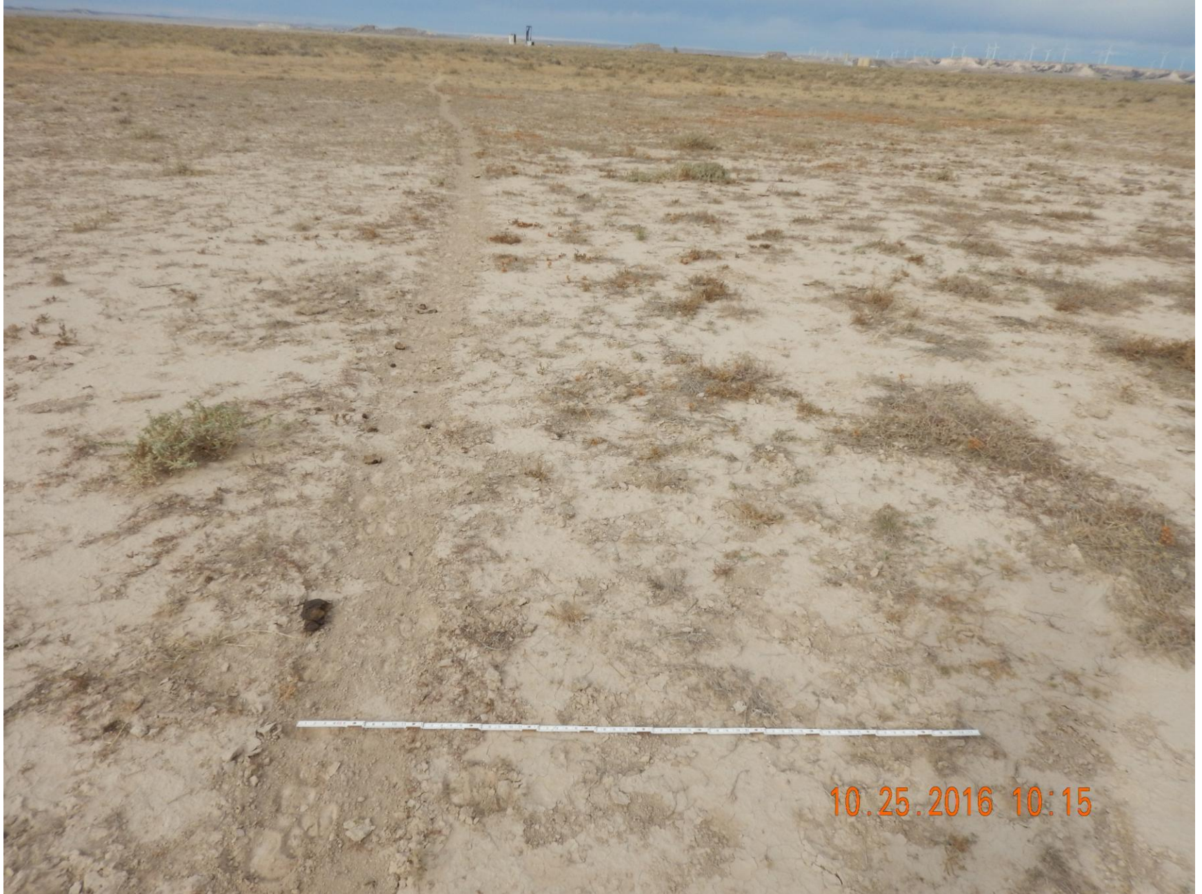
Figure 5: Photo taken from the location, facing west. Photo shows vegetation over the reclamation area. 6 foot measuring stick used as reference.