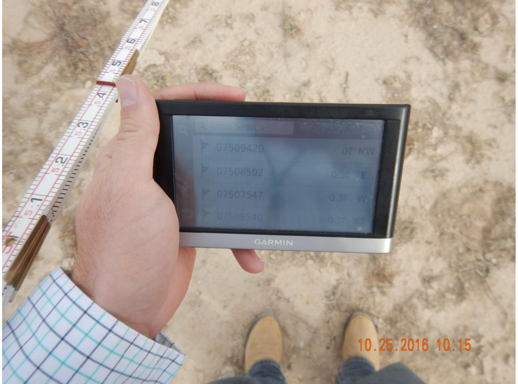
Figure 1: Photo of GPS confirming location.