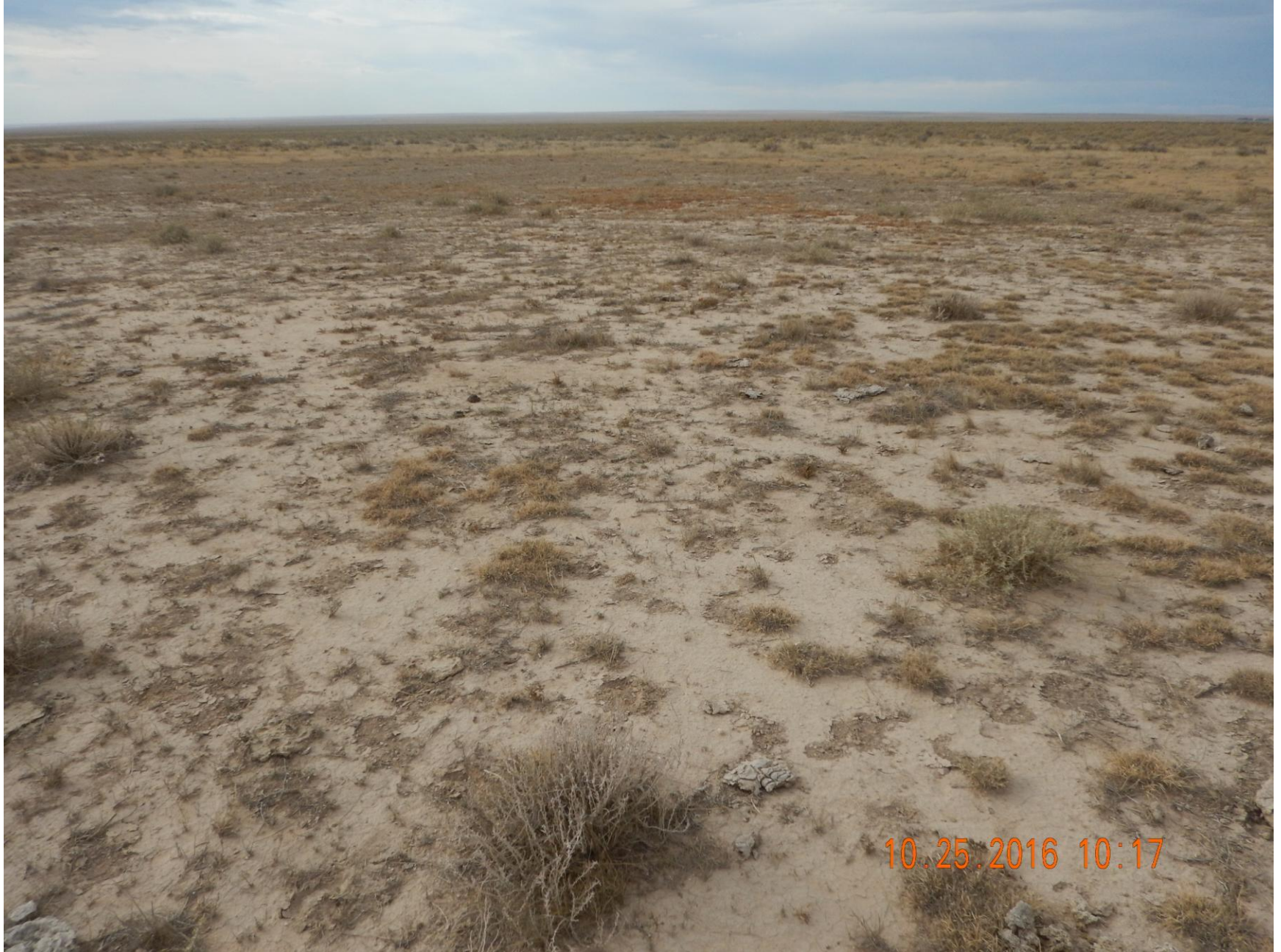
Figure 11: Photo taken from the northwest corner of the location, facing south. Photo shows vegetation over the reclamation area. Note large portions of the location remains unvegetated..