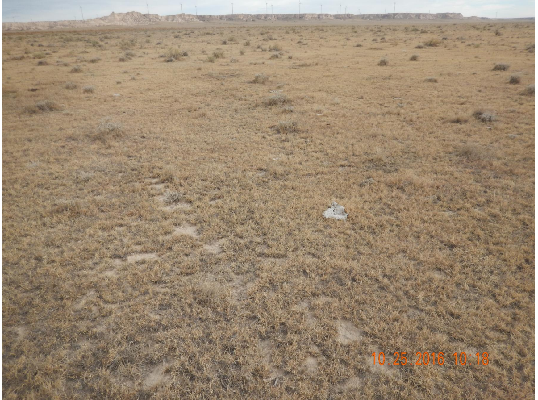
Figure 12: Photo taken from the adjacent reference area, east of the location, facing north. Photo shows vegetation over the reference area.