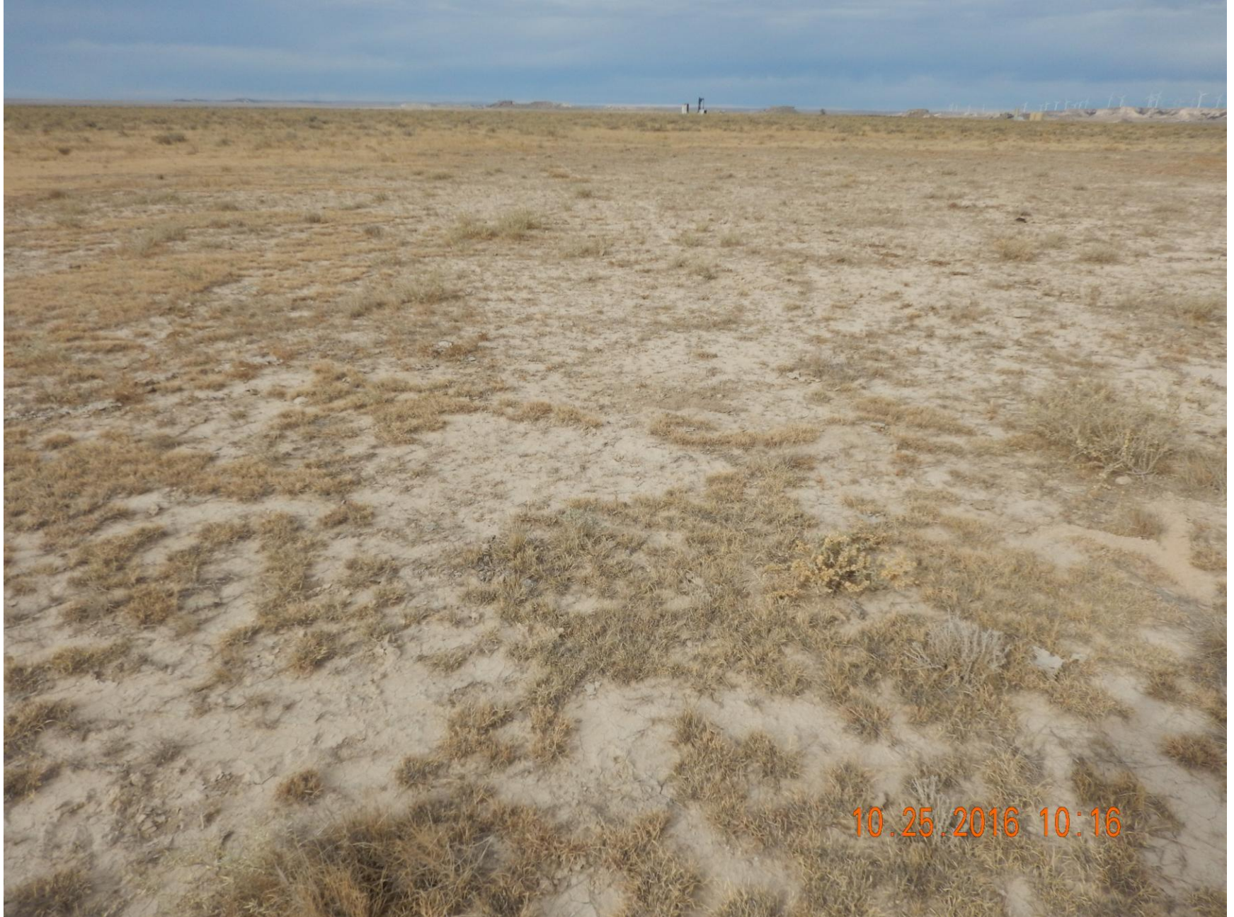
Figure 6: Photo taken from the southeast corner of the location, facing west. Photo shows vegetation over the reclamation area. Note large portions of the location remains unvegetated.