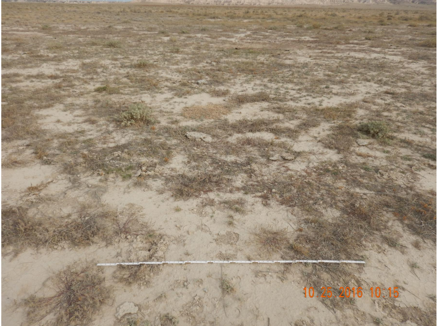
Figure 2: Photo taken from the location, facing north. Photo shows vegetation over the reclamation area. 6 foot measuring stick used as reference.