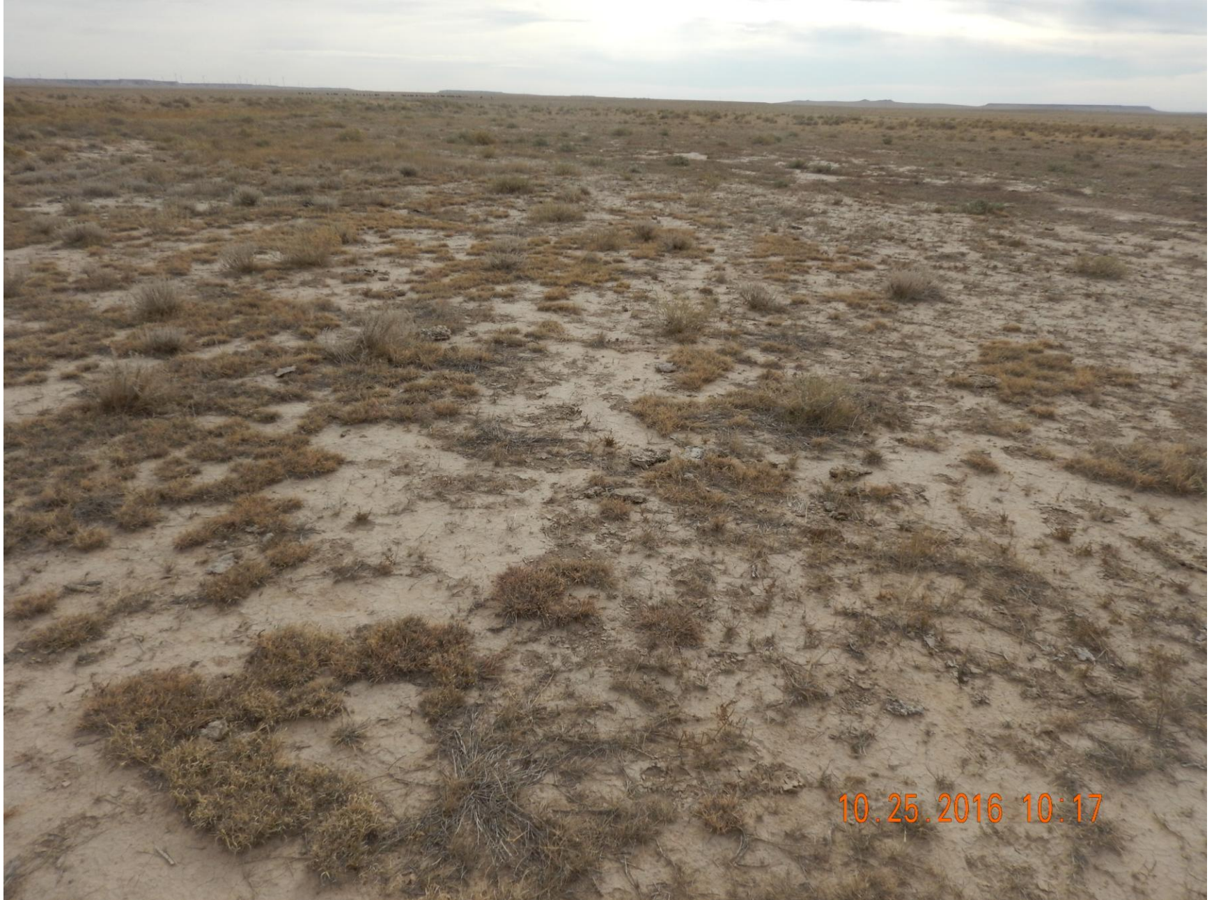
Figure 9: Photo taken from the northwest corner of the location, facing east. Photo shows vegetation over the reclamation area. Note large portions of the location remains unvegetated.