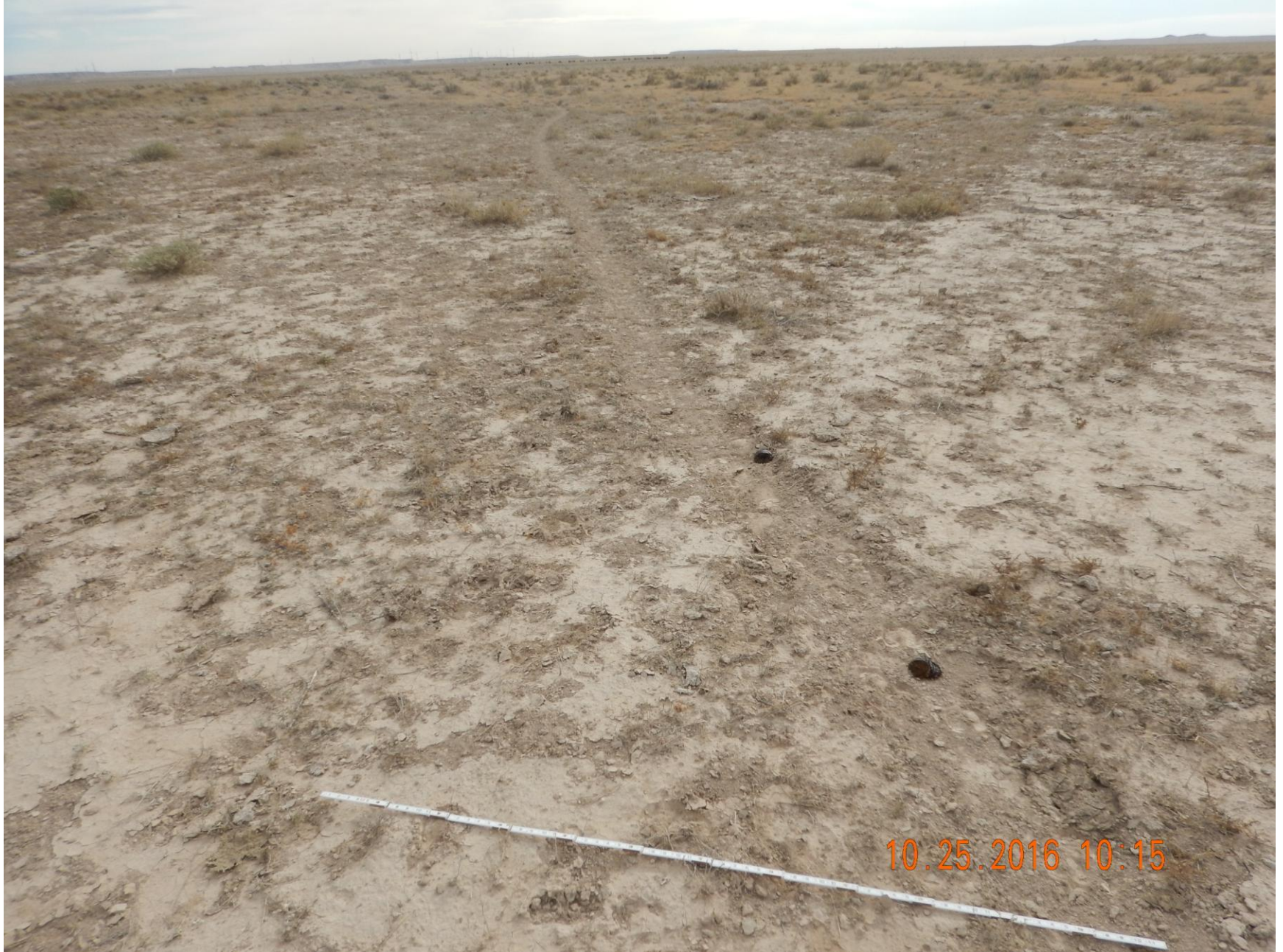
Figure 3: Photo taken from the location, facing east. Photo shows vegetation over the reclamation area. 6 foot measuring stick used as reference.