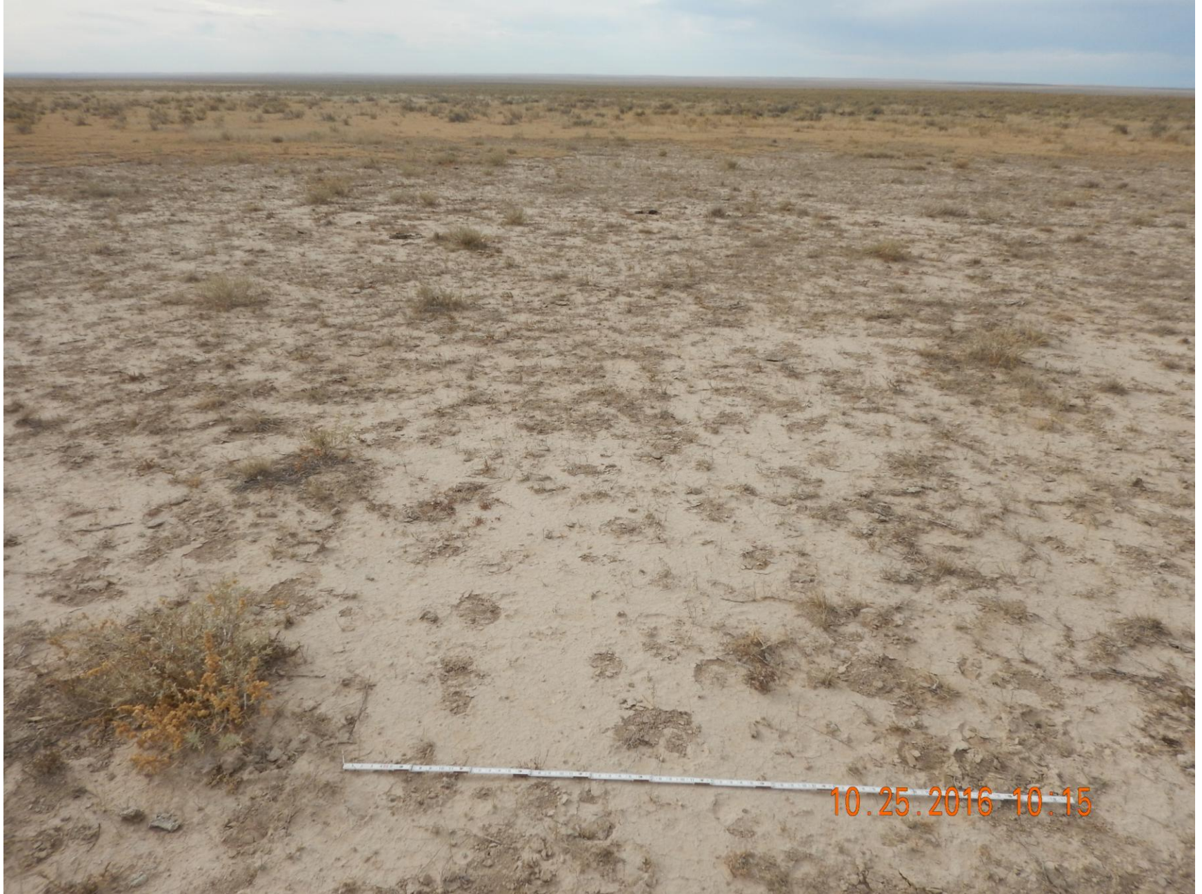
Figure 4: Photo taken from the location, facing south. Photo shows vegetation over the reclamation area. 6 foot measuring stick used as reference.