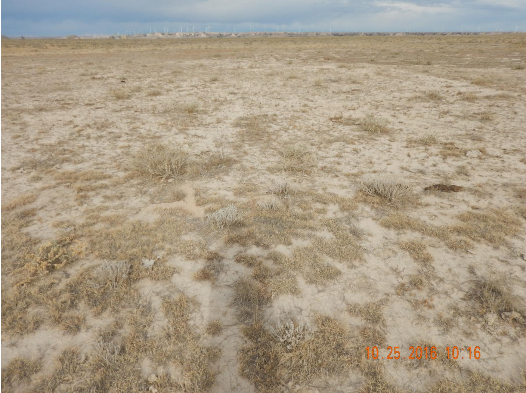
Figure 7: Photo taken from the southeast corner of the location, facing northwest. Photo shows vegetation over the reclamation area. Note large portions of the location remains unvegetated.