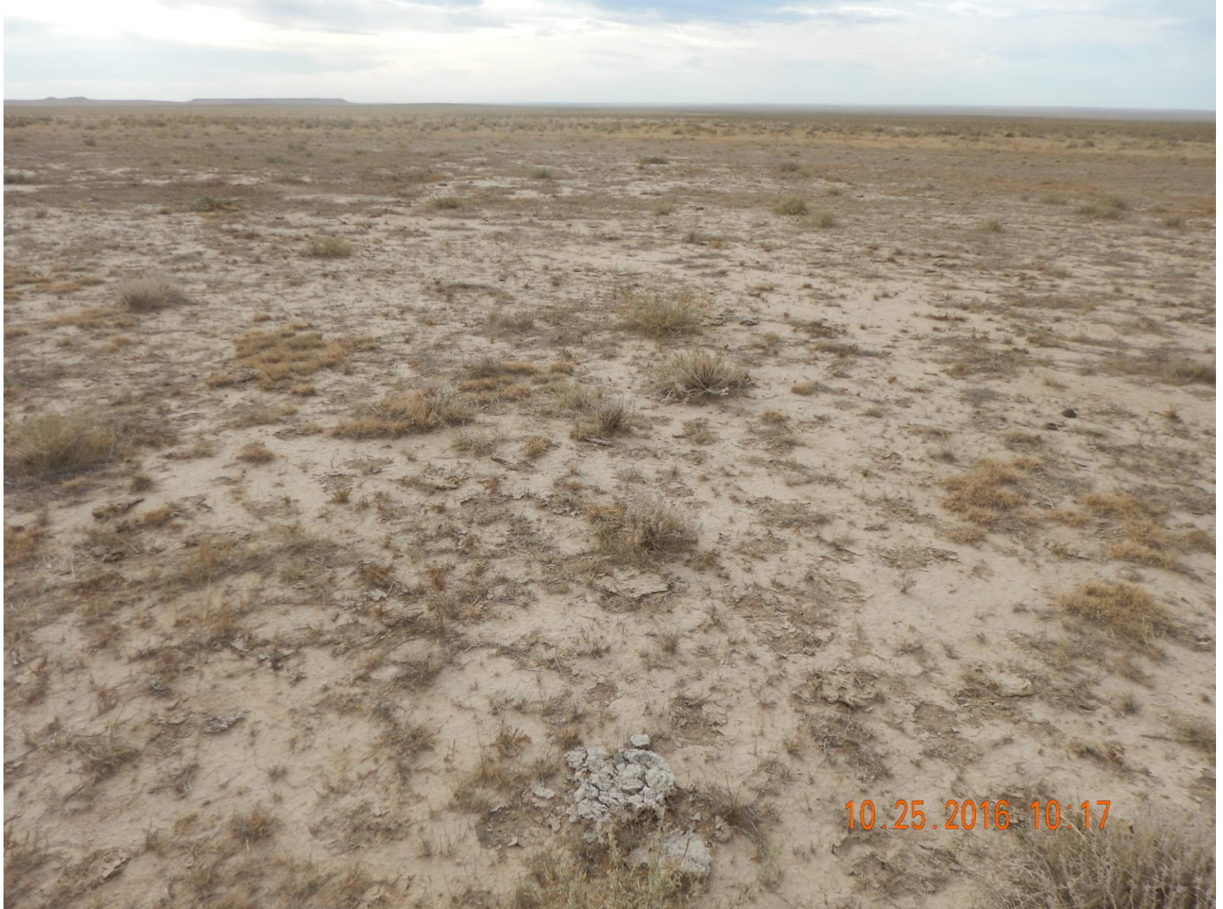
Figure 10: Photo taken from the northwest corner of the location, facing southeast. Photo shows vegetation over the reclamation area. Note large portions of the location remains unvegetated.