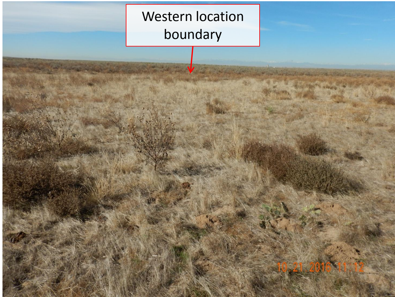
Photo 1. Photo taken from center of location, facing West. Native, perennial grass has established on the western half of the location but lacks on the eastern half of the location. Native, perennial shrubs have not established at location which is not reflective of reference areas.