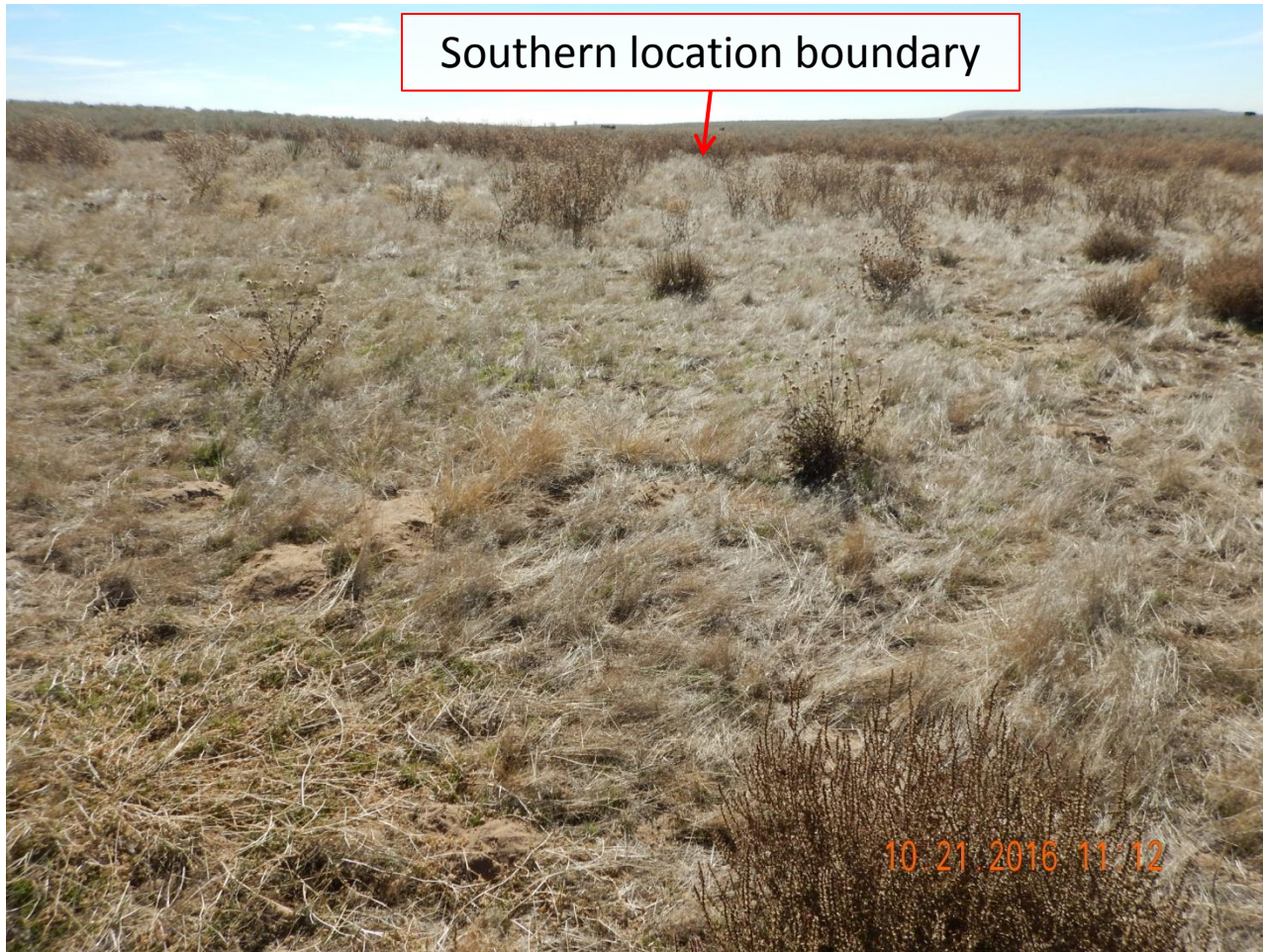
Photo 4. Photo taken from center of location, facing South. Native, perennial grass has established on the western half of the location but lacks on the eastern half of the location. Native, perennial shrubs have not established at location which is not reflective of reference areas.