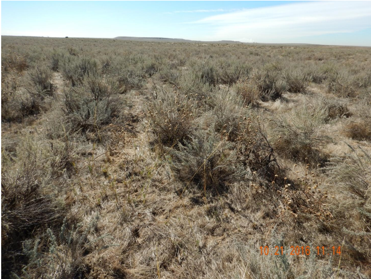
Photo 5. Reference photo taken west of location, facing South. Location is still IN-PROCESS. Location is not reflective of reference areas as illustrated with this photo.