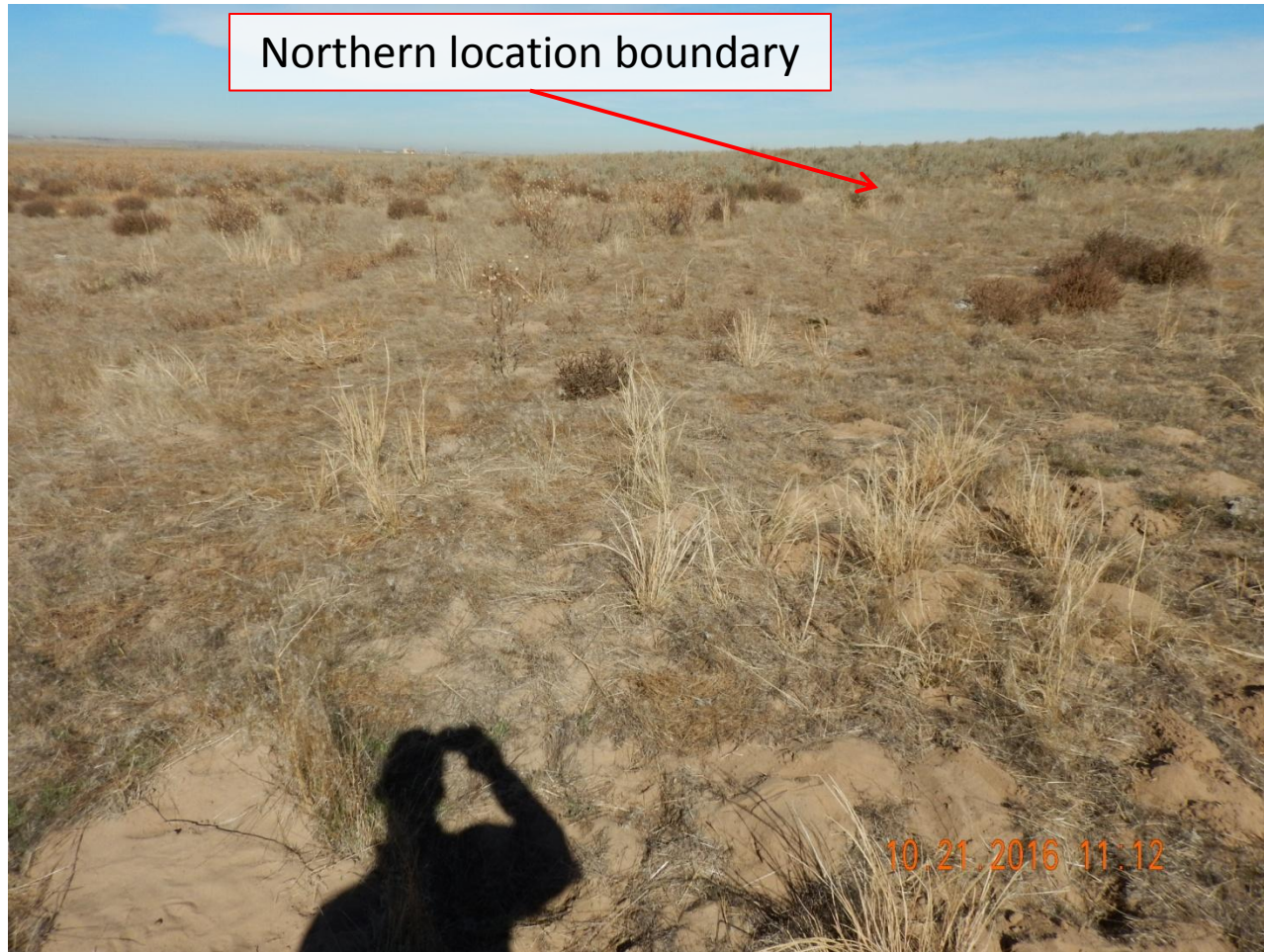
Photo 2. Photo taken from center of location, facing North. Native, perennial grass has established on the western half of the location but lacks on the eastern half of the location. Native, perennial shrubs have not established at location which is not reflective of reference areas.