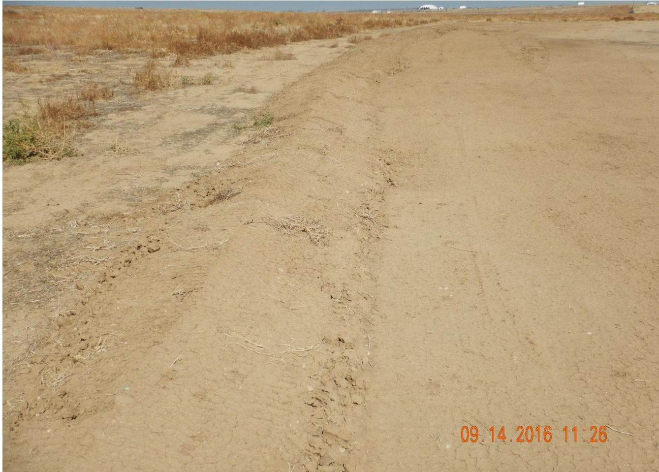
Photo 1. Photo taken from the western location, facing North. Berm was constructed to control run-on onto the location.