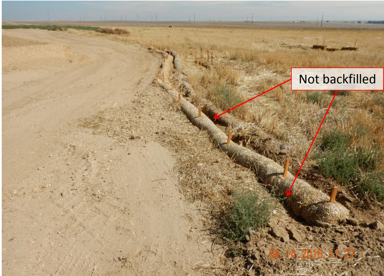
Photo 3. Photo taken from the southeast location, facing Northeast. Two sets of wattles were installed and used in conjunction with another BMP (i.e., straw bale). Wattle installation has some potential weak spots because areas were not properly backfilled.