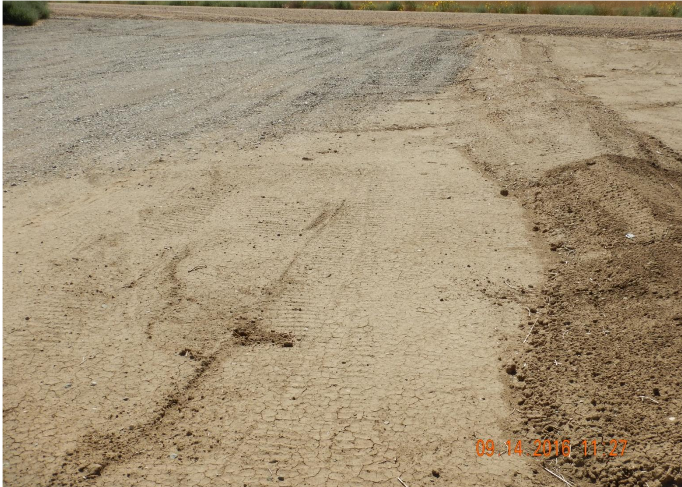
Photo 2. Photo taken from the western location, facing South. Berm was constructed to control run-on onto the location. Also, gravel installed to stabilize location and prevent erosion.