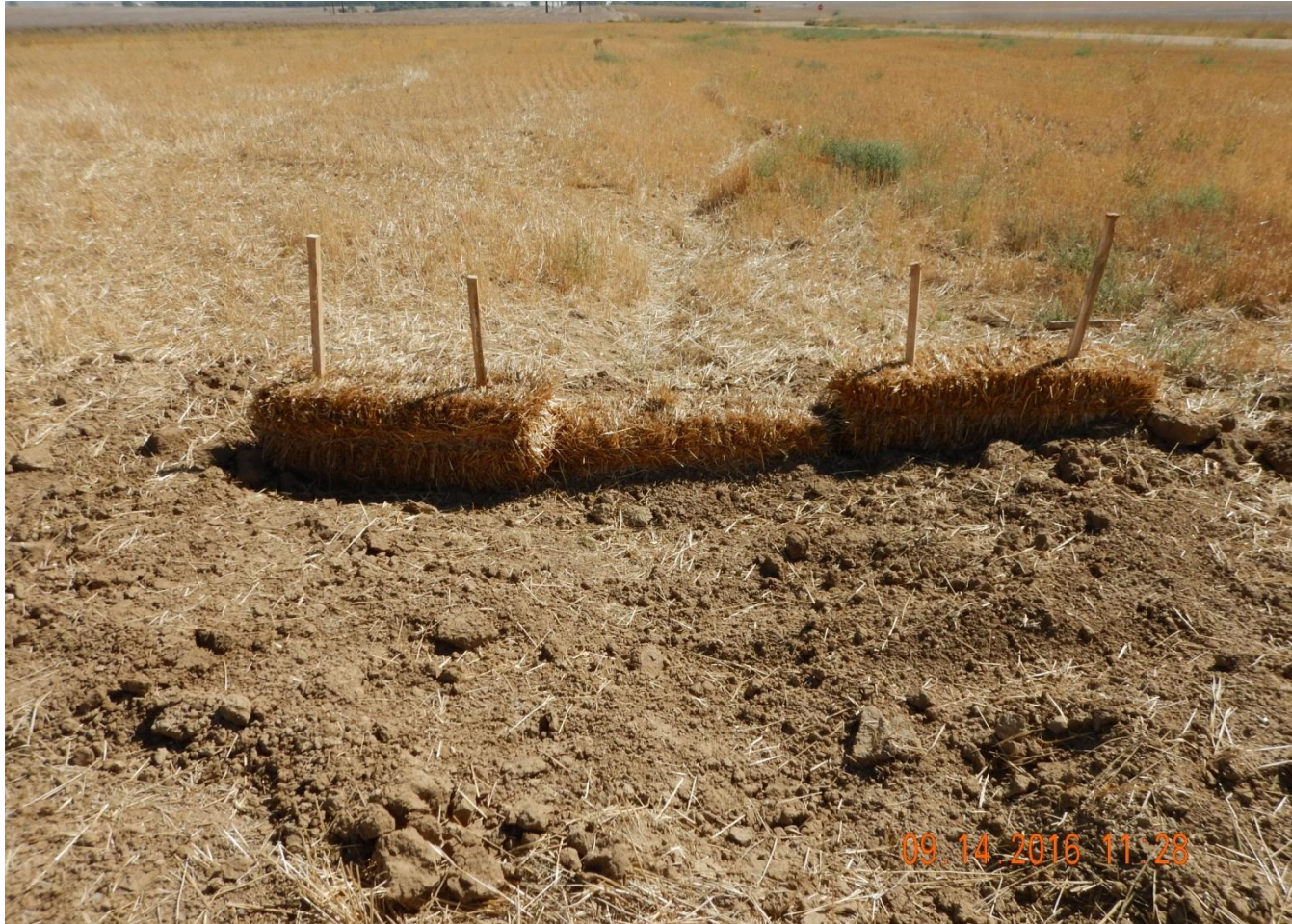
Photo 5. Photo taken east of wattles, facing East. Straw bale barrier BMPs installed in conjunction with the wattles.