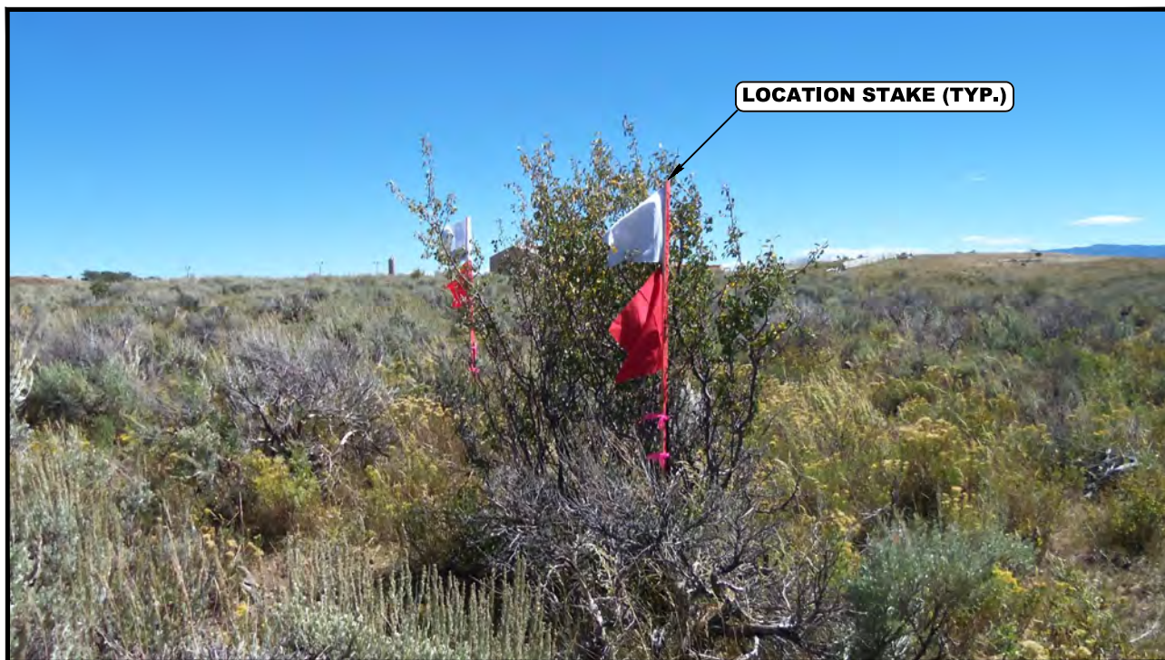
PHOTO: VIEW OF LOCATION STAKES