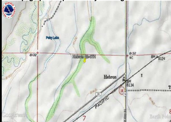
Topographic Map: Courtesy of Google Earth 2015