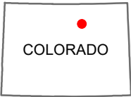
FIGURE 1 SITE LOCATION MAP POWERS 21-22, X 22-02, 41-22, ROBERT POWERS X 22-07 NENE SEC 22-T2N-R65W WELD COUNTY, COLORADO KERR-MCGEE OIL & GAS ONSHORE LP