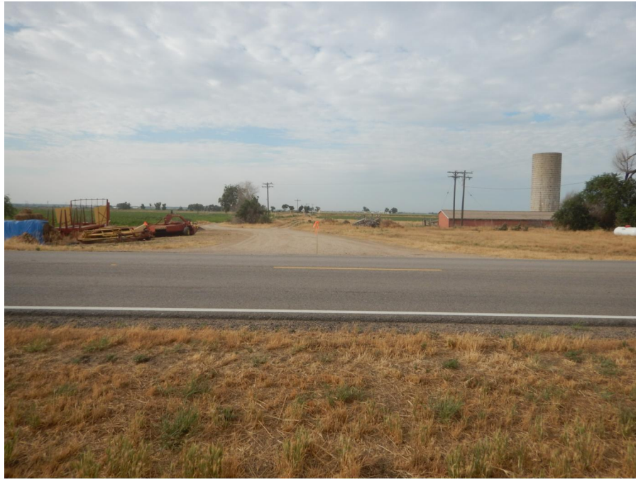
PHOTOGRAPH OF KAWATA 21-16 ACCESS ROAD - CAMERA ANGLE SOUTH