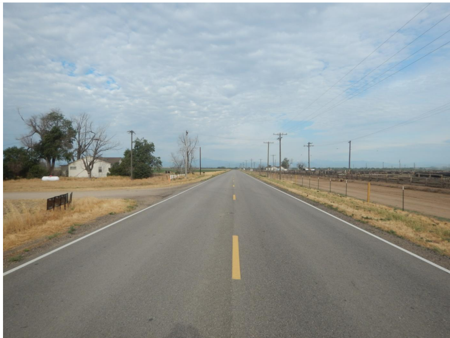
PHOTOGRAPH OF KAWATA 21-16 ACCESS ROAD - CAMERA ANGLE WEST