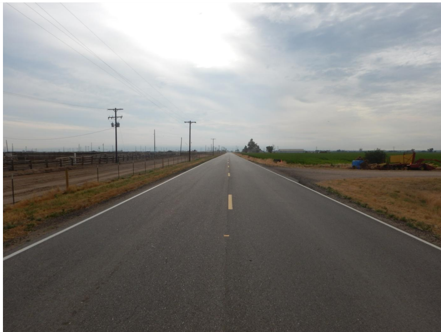
PHOTOGRAPH OF KAWATA 21-16 ACCESS ROAD - CAMERA ANGLE EAST

ACCESS ROAD PHOTOGRAPHS KAWATA 30C-17-M, KAWATA 4N-17B-M, KAWATA 4N-17C-M, KAWATA 31N-17A-M, KAWATA 31C-17-M, KAWATA 31N-17C-M, KAWATA 5N-17B-M, KAWATA 5C-17-M, KAWATA 32N-17B-M & KAWATA 32N-17C-M LOCATED IN SECTION 16, T4N, R66W, 6TH P.M. WELD COUNTY, COLORADO