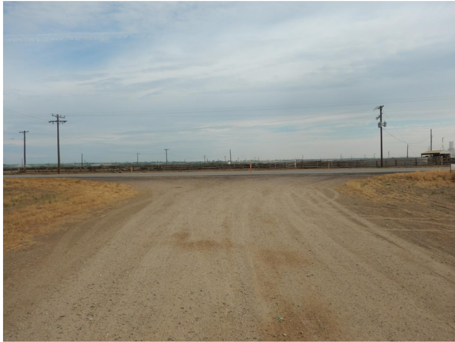
PHOTOGRAPH OF KAWATA 21-16 ACCESS ROAD - CAMERA ANGLE NORTH