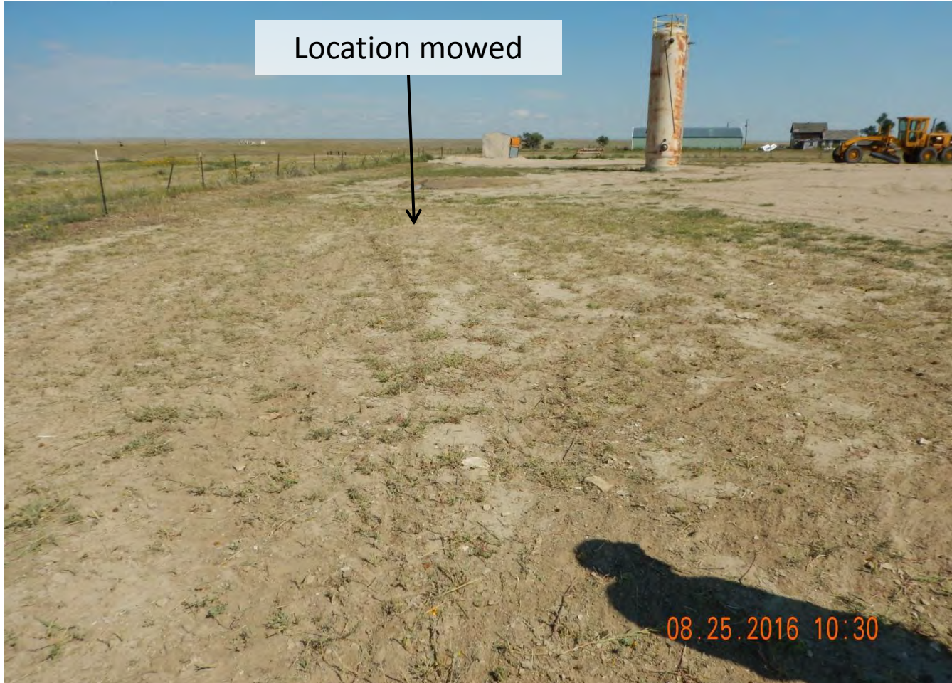
Photo 2. Photo taken from southwest location, facing North. Location was mowed within the last 2 days based off conversations with other COGCC staff. Complainant has pulled and bagged Diffuse knapweed from this location. A handful of individual Diffuse knapweeds left behind were observed along the western area.