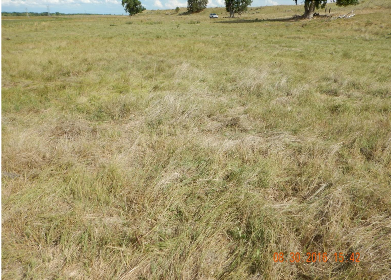
Photo 4. Reference photo taken south of location, facing South. Vegetative growth does not appear to be reflective of reference areas.