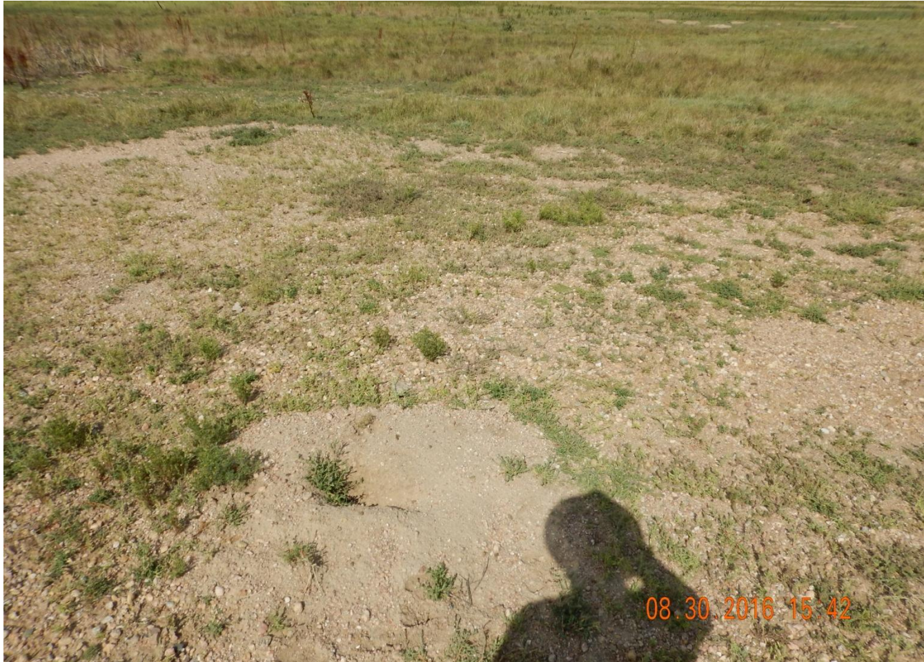
Photo 2. Photo taken from center of location, facing East. Location has not been reclaimed per Rule 1004. Little to no perennial vegetative growth has established at location. Does not appear all of the gravel was removed.