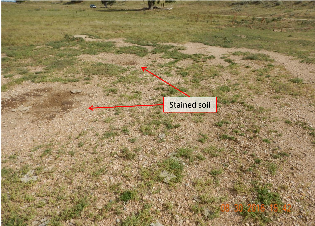
Photo 3. Photo taken from center of location, facing South. Location has not been reclaimed per Rule 1004. Little to no perennial vegetative growth has established at location. Does not appear all of the gravel was removed. Stained soil remains at location and needs to be removed.