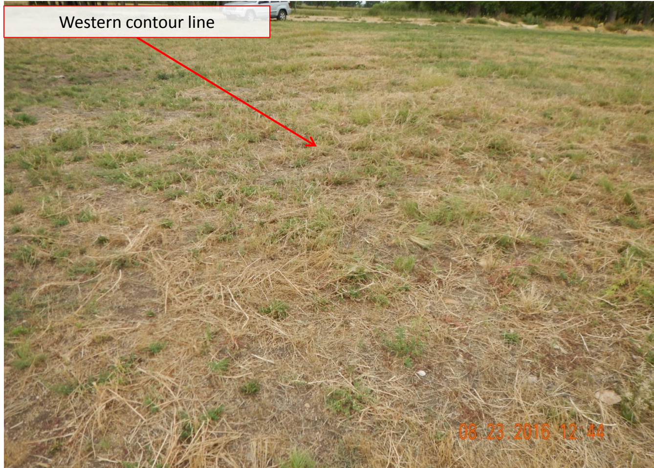
Photo 2. Photo taken from western location, facing North. Location was not recontoured to surrounding landscape.