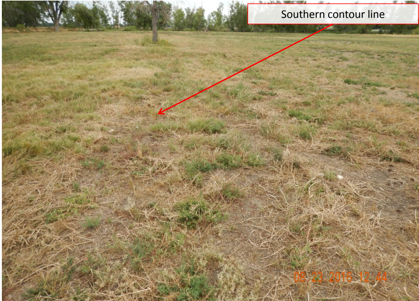
Photo 3. Photo taken from southern location, facing East. Location was not recontoured to surrounding landscape.