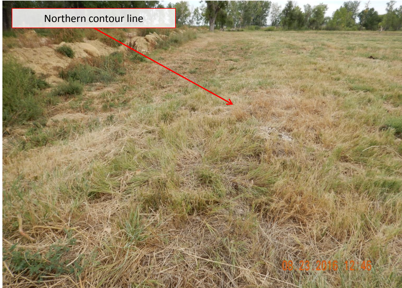
Photo 4. Photo taken from northern location, facing East. Location was not recontoured to surrounding landscape.