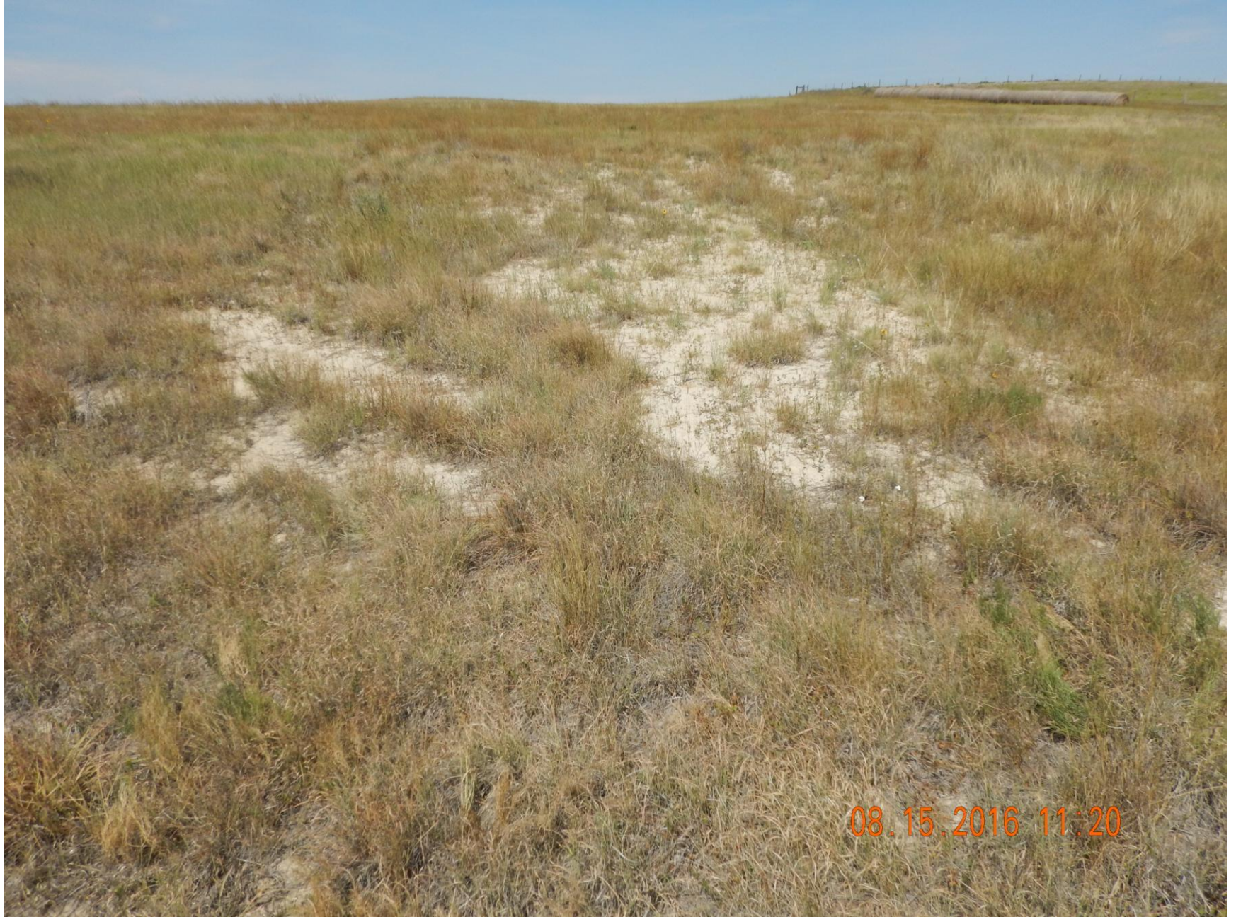
Figure 3: Photo taken from location, facing northwest. Photo shows large bare areas on location that remain unvegetated. These areas need to be reclaimed.