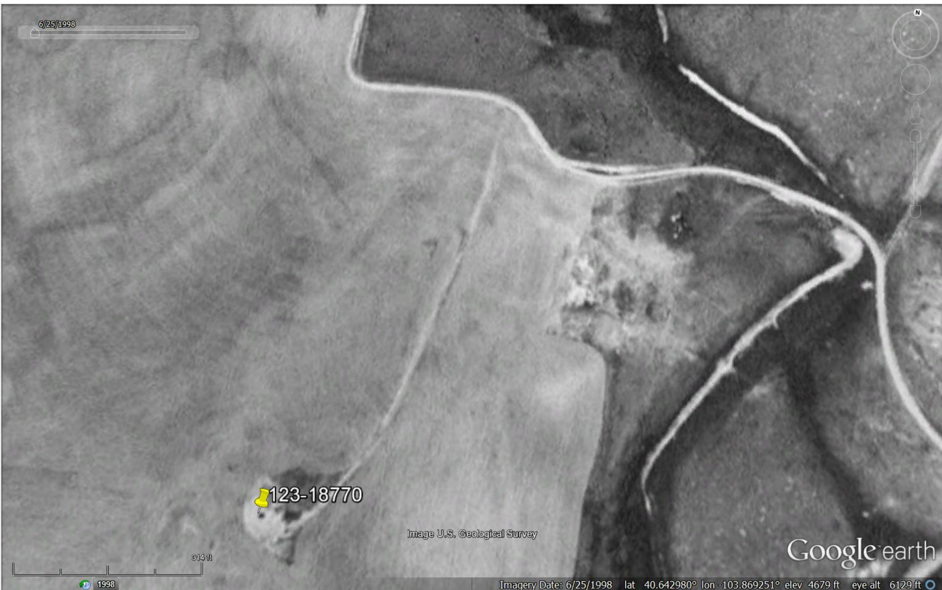
Figure 6: 1998 Aerial imagery of location and access road.