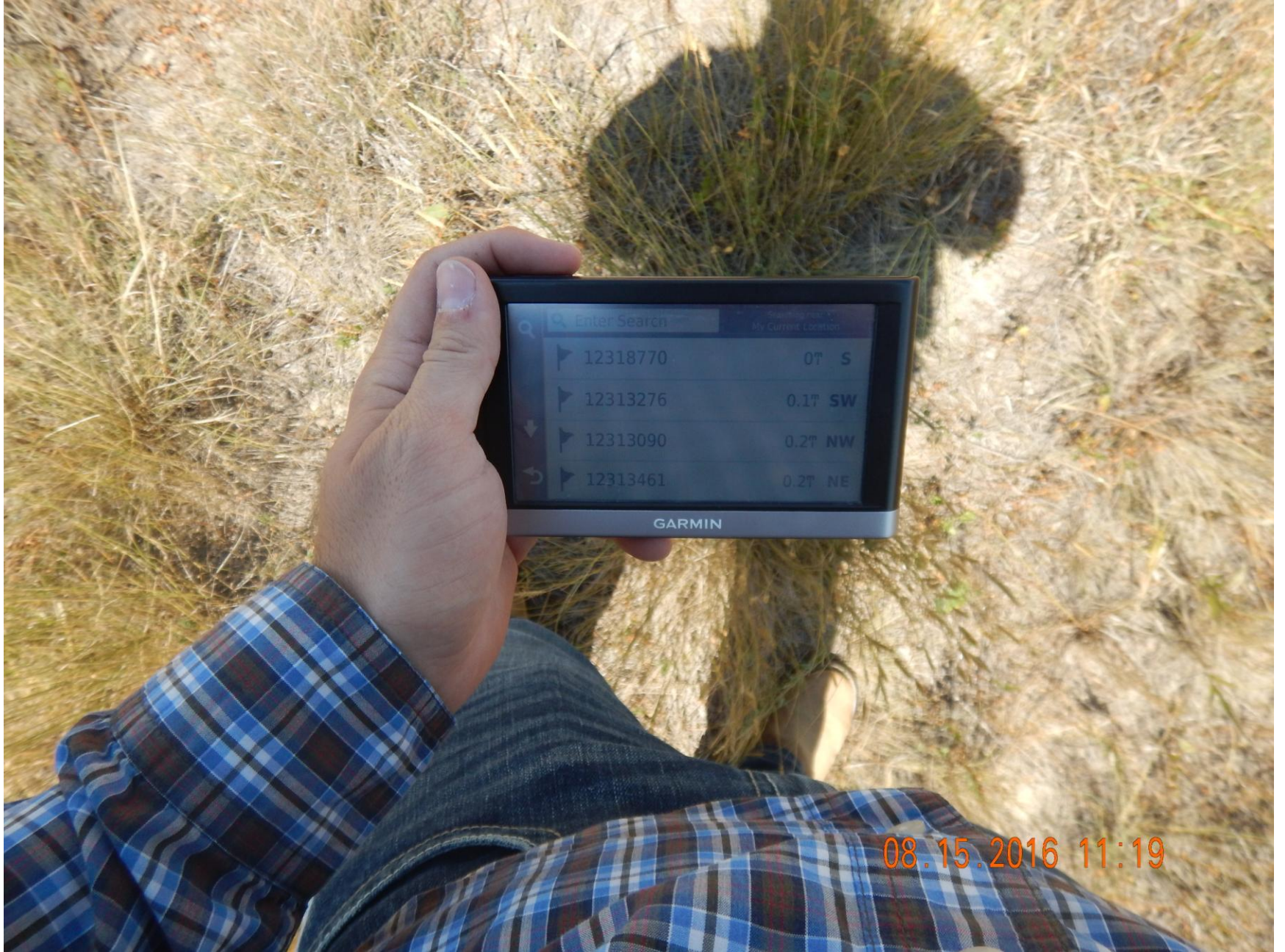
Figure 1: Photo GPS confirming location.