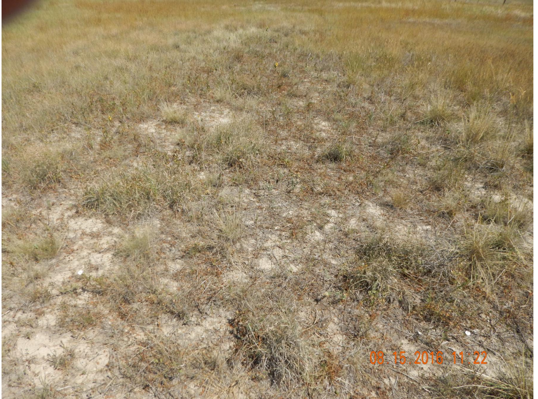
Figure 5: Photo taken from location. Photo shows large bare area on location. Photo shows large bare areas on location that remain unvegetated. These areas need to be reclaimed.