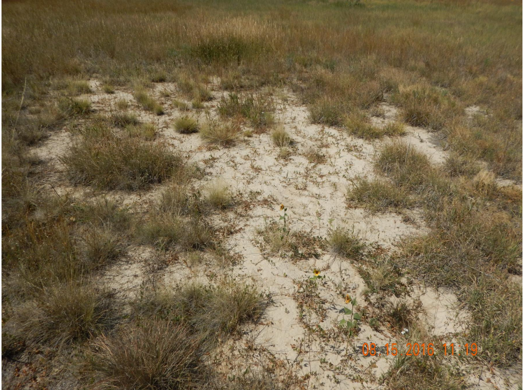
Figure 2: Photo taken from location. Photo shows large bare area on location. Photo shows large bare areas on location that remain unvegetated. These areas need to be reclaimed.