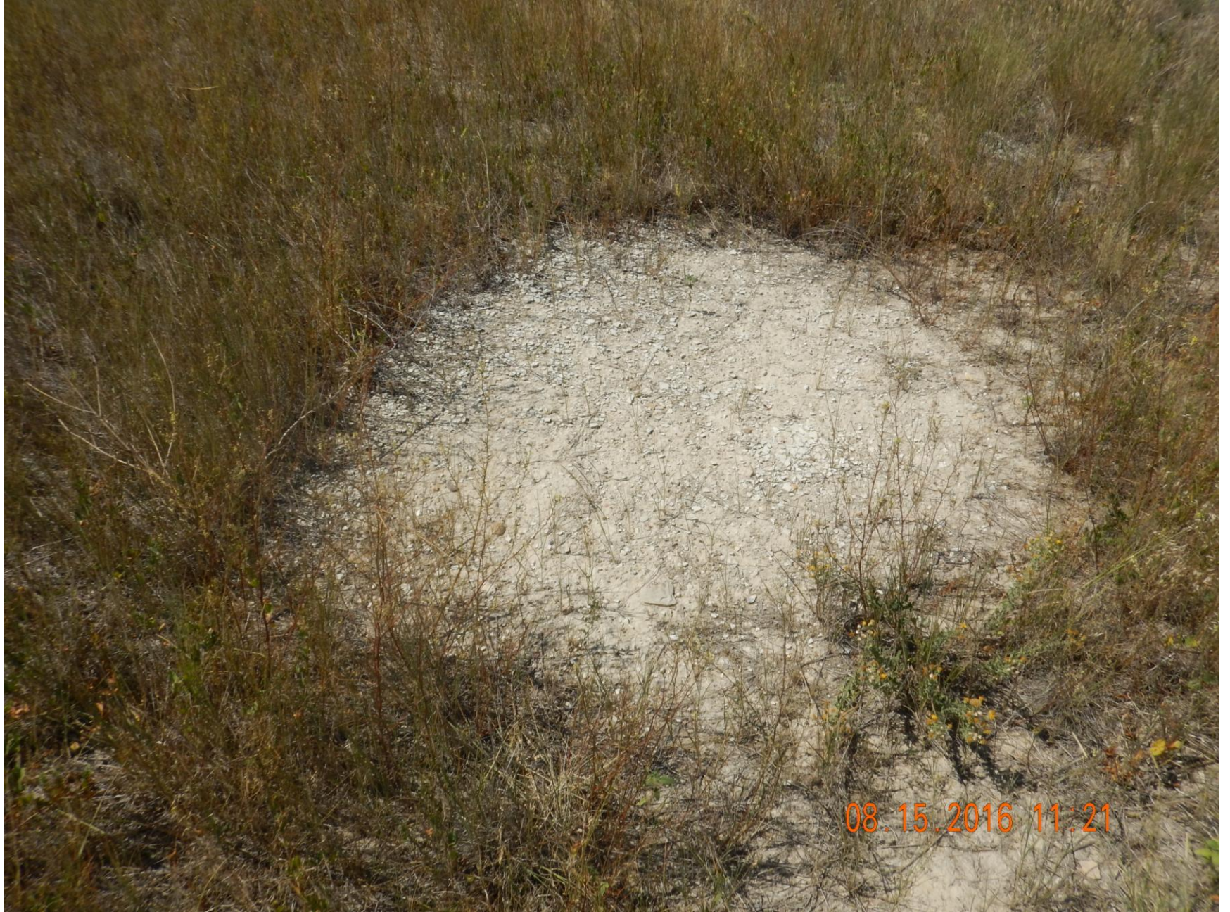
Figure 4: Photo taken from location. Photo shows large bare area on location. Photo shows large bare areas on location that remain unvegetated. These areas need to be reclaimed.