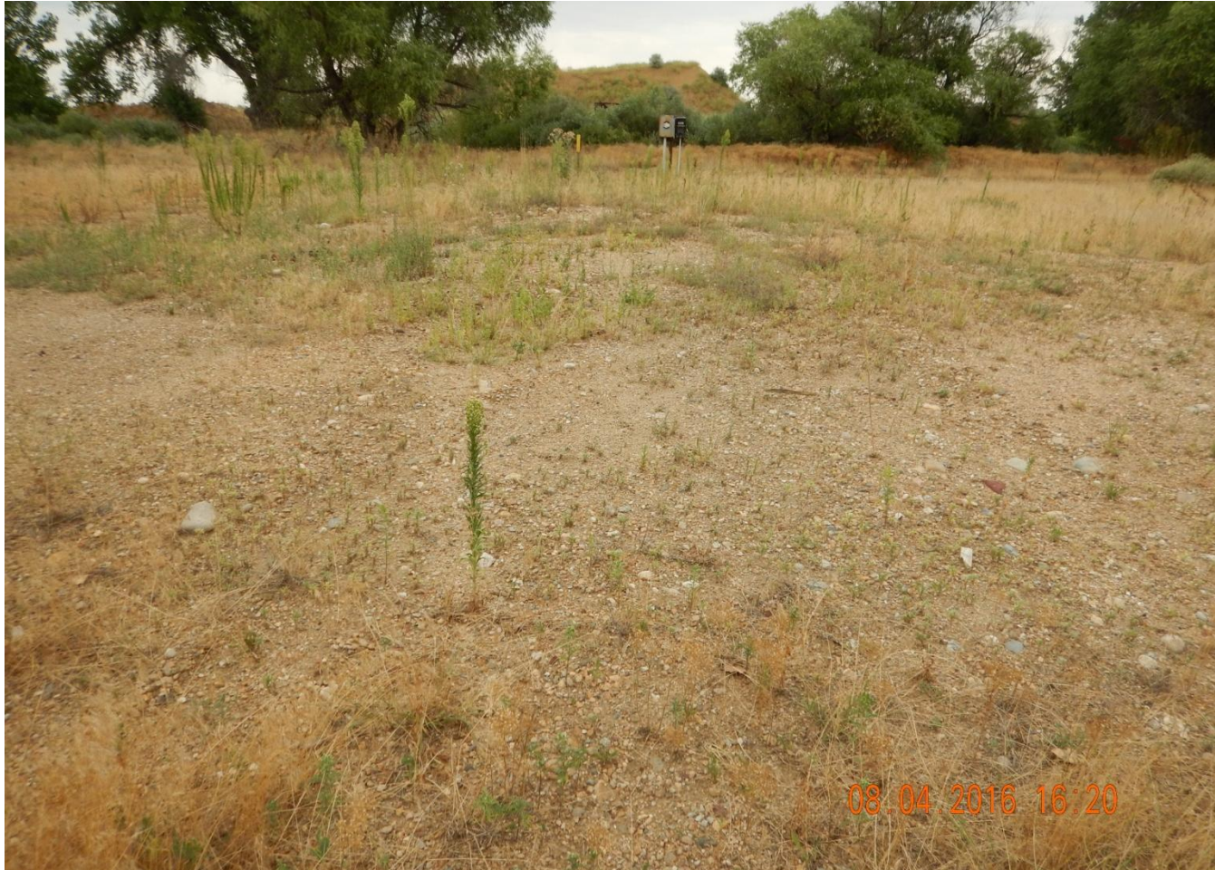
Photo 3. Photo taken from approximate center of location, facing East. Location has not been reclaimed per Rule 1004.