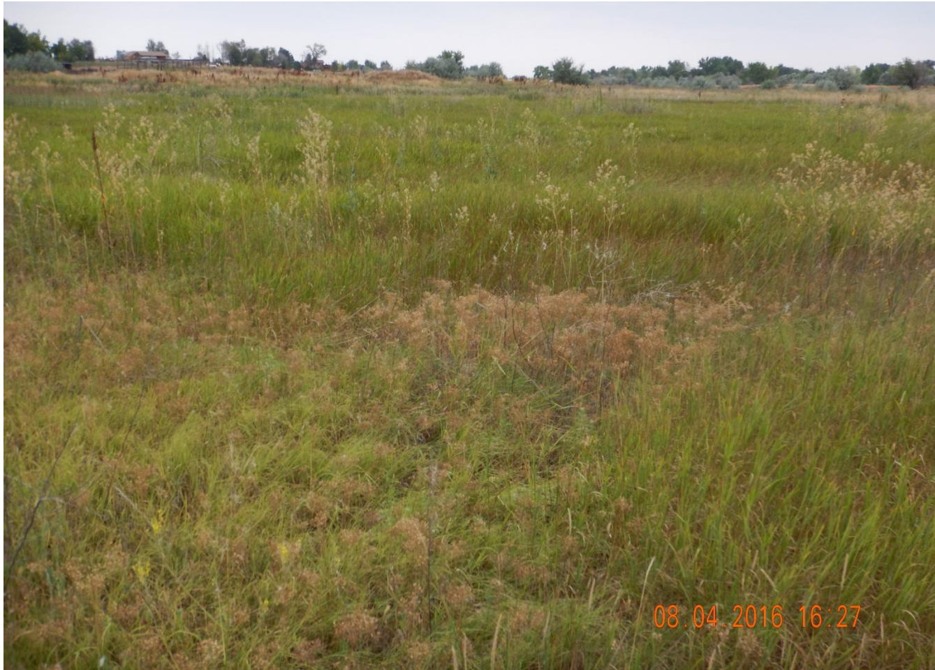
Photo 8. Reference photo taken from west of location, facing North. Location is not reflective of reference areas and noxious weeds are present throughout access road and location.