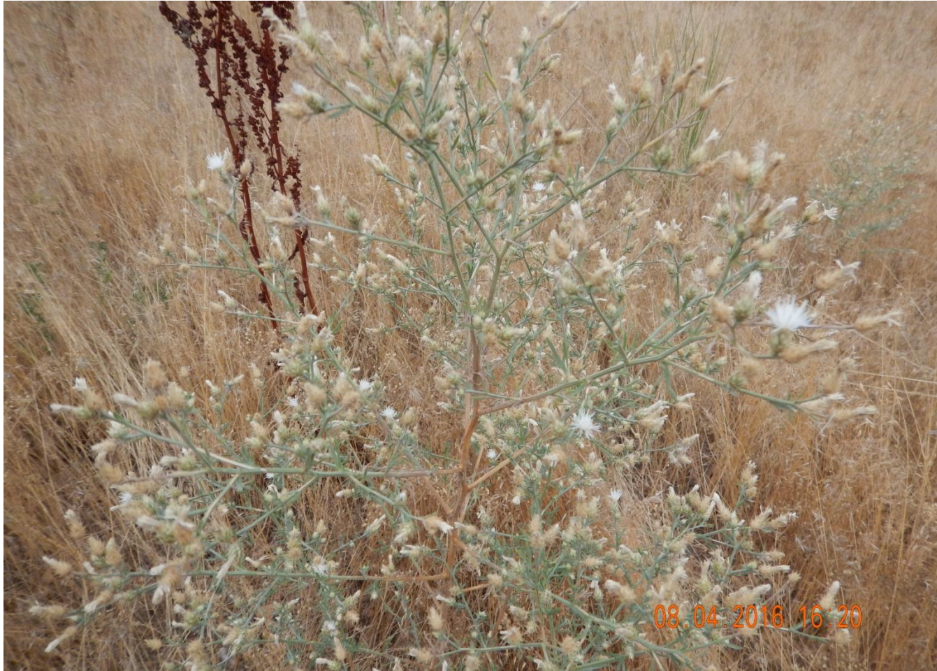
Photo 5. Photo taken of a List B noxious weed species, Diffuse knapweed ( Centaurea diffusa ), which is found along the access road and location, and needs to be removed per Rule 1004.