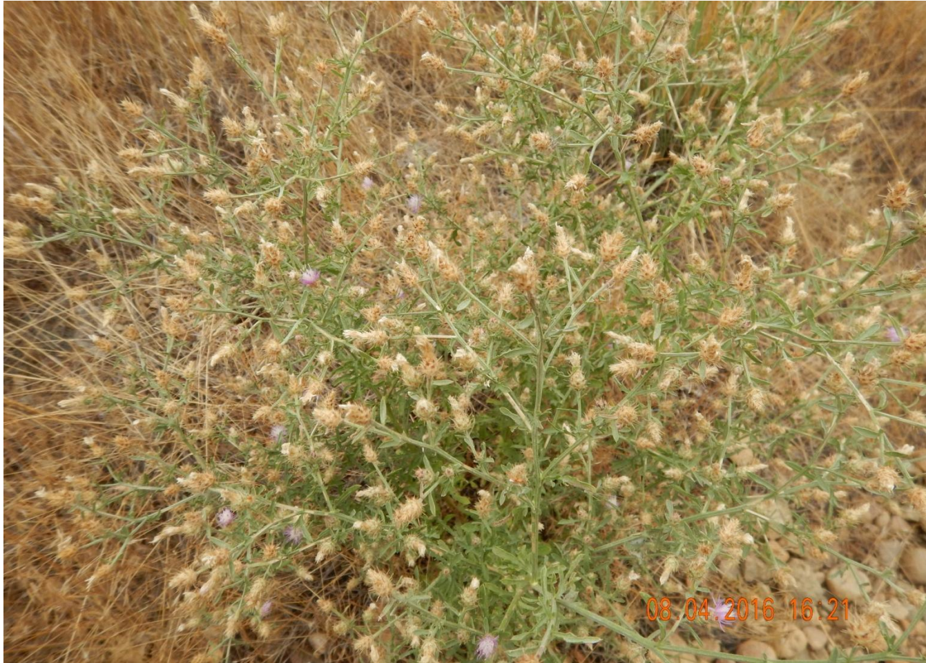
Photo 6. Photo taken of a List B noxious weed species, Spotted knapweed ( Centaurea stoebe ), which is found along the access road and location, and needs to be removed per Rule 1004.