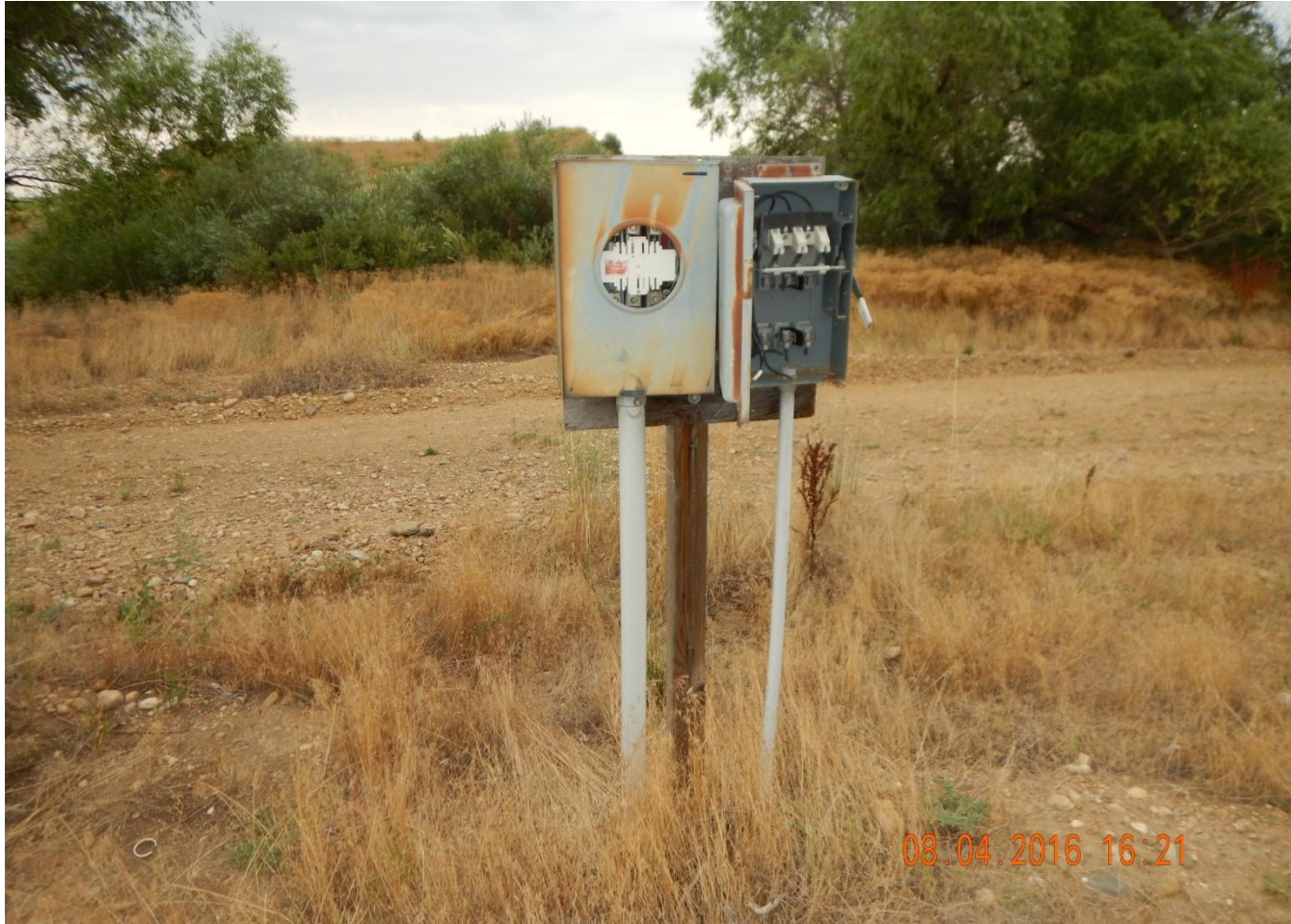
Photo 4. Electrical service panel needs to be removed from location.