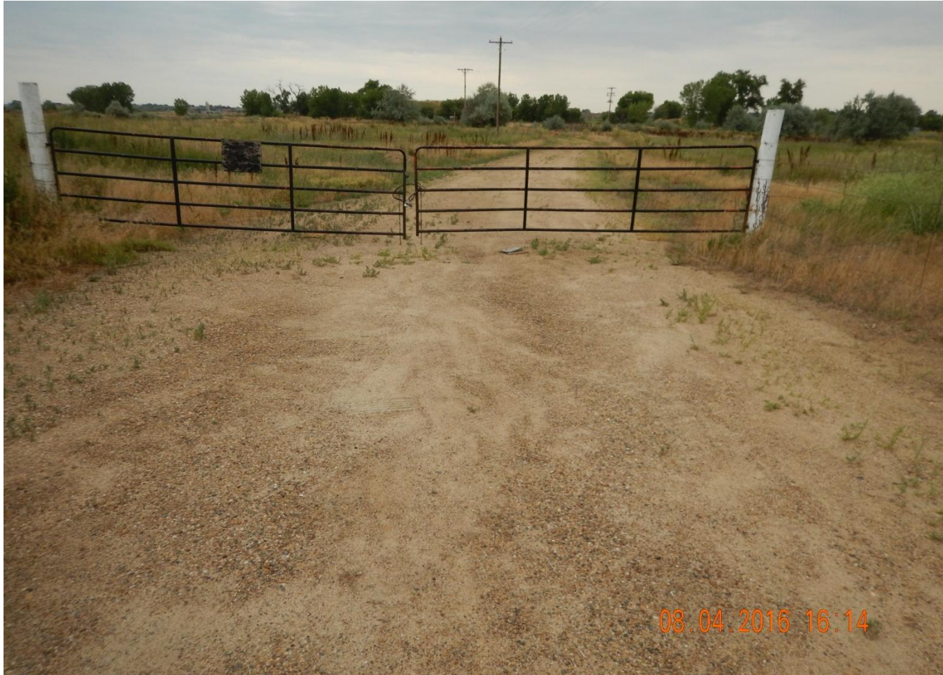
Photo 2. Photo taken from entrance of location, facing East. Access road has not been reclaimed per Rule 1004. Also, List B Noxious weeds exist throughout access road and location which need to be removed per Rule 1004.