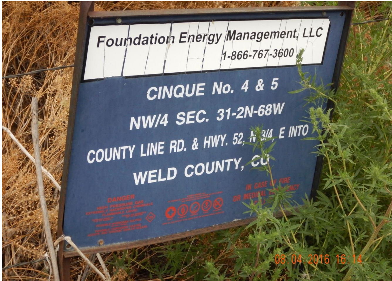
Photo 1. Photo taken from entrance of location off County Line Road. Need to remove sign.