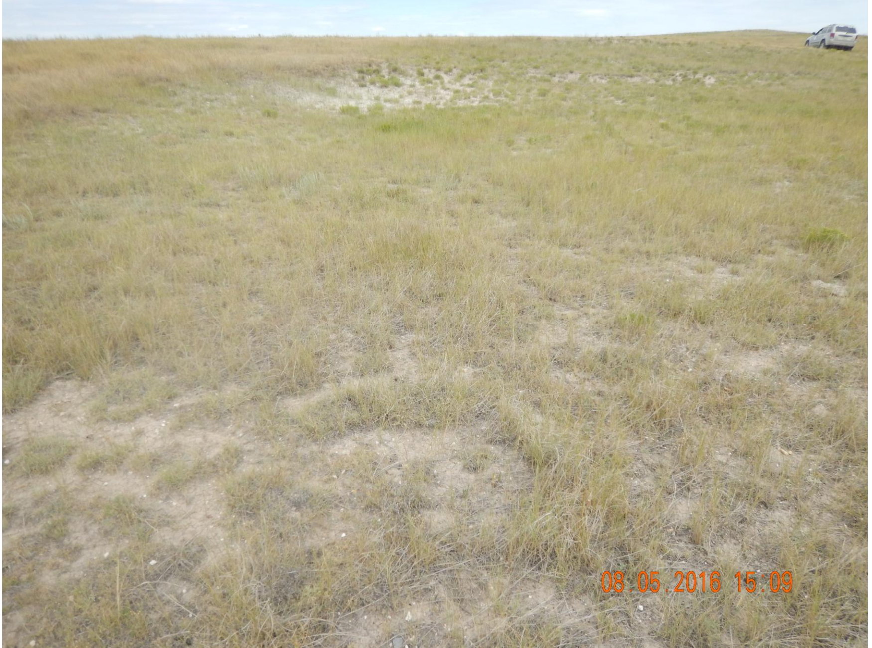
Figure 17: Photo taken from the northwest corner of the location, facing east. Photo shows vegetation over the reclamation area. Note vegetation area in the northeast corner experiencing erosion.