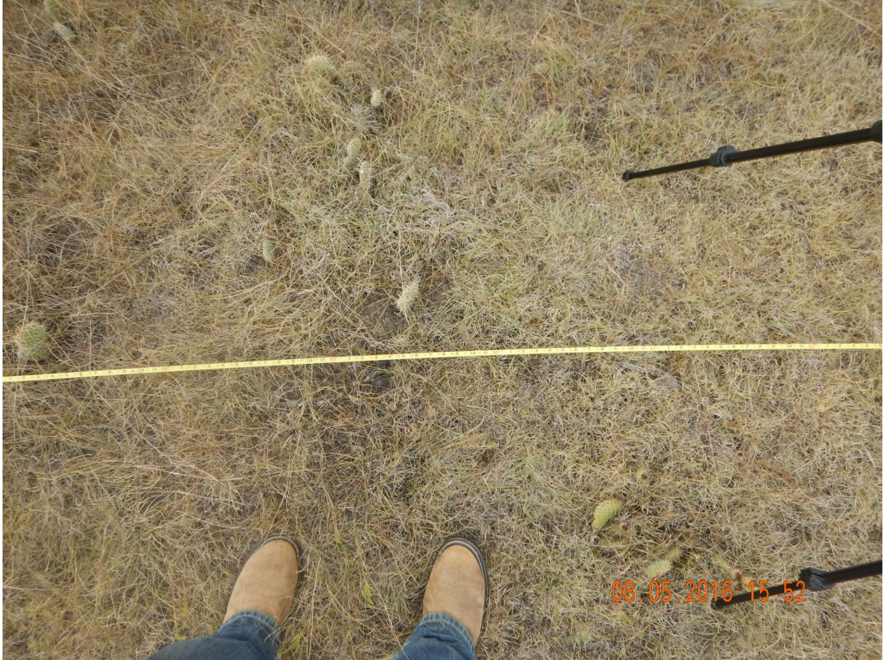
Figure 10: Photo of vegetation at the 50th point of the reference transect.