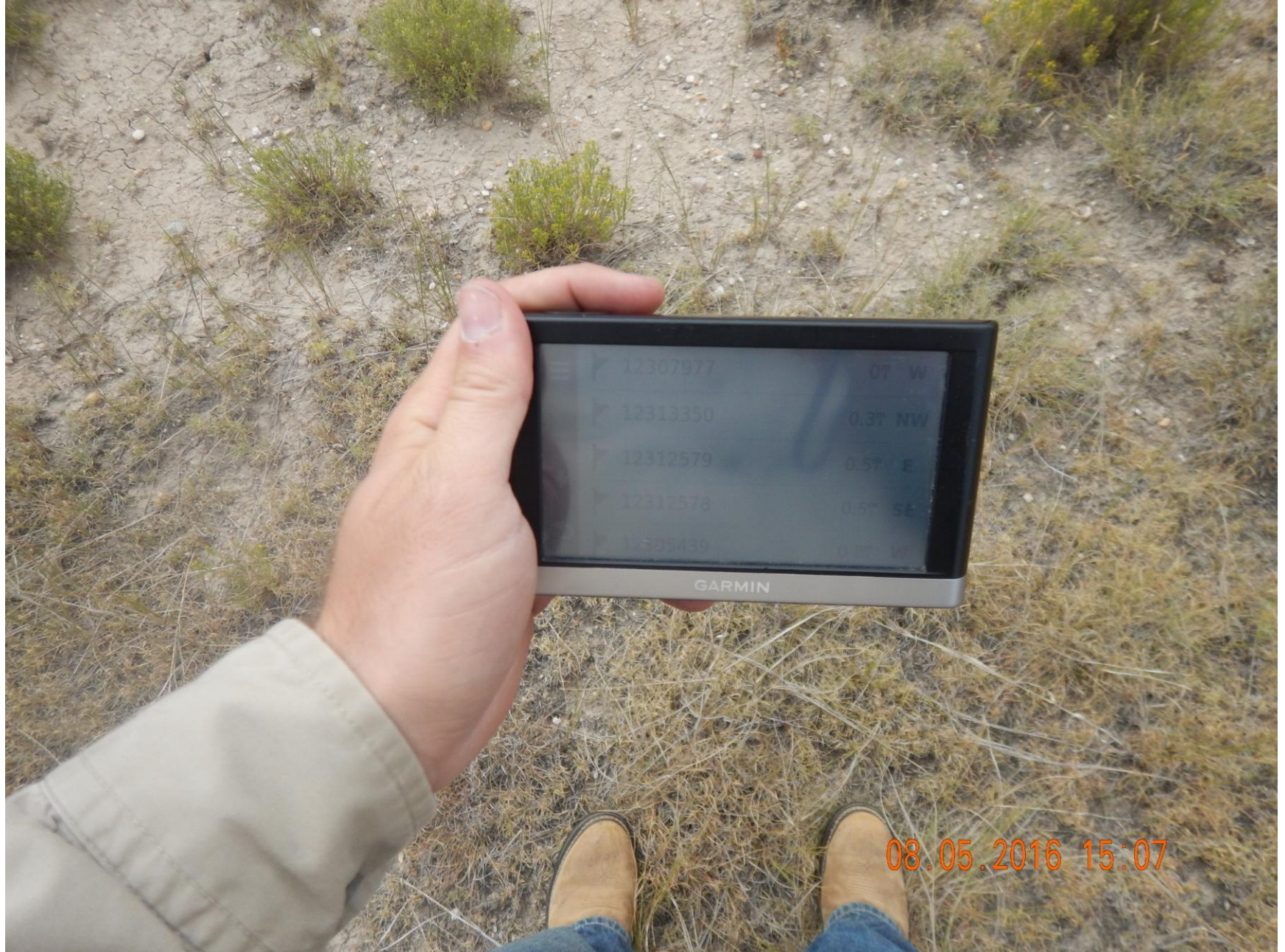
Figure 1: Photo of GPS confirming location.