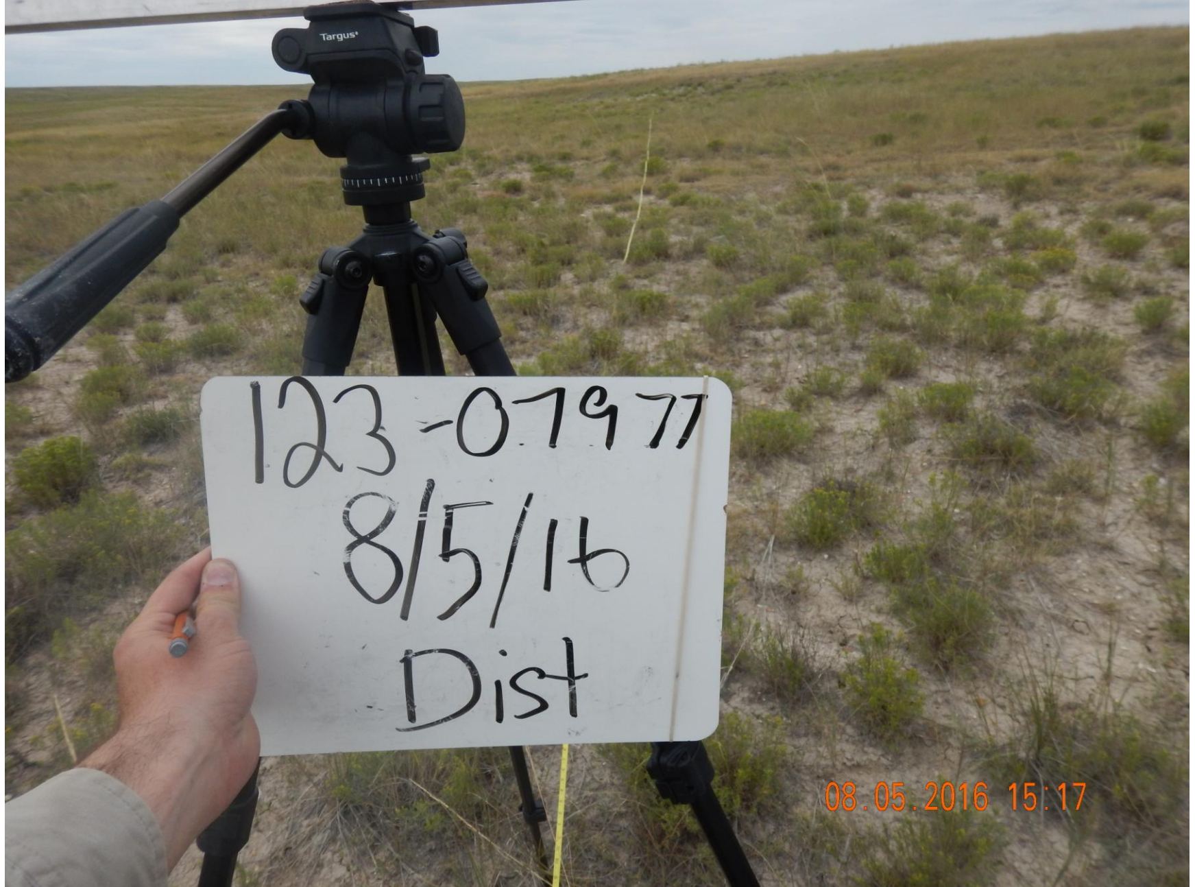
Figure 2: Photo of the starting point for the disturbance transect, facing north.