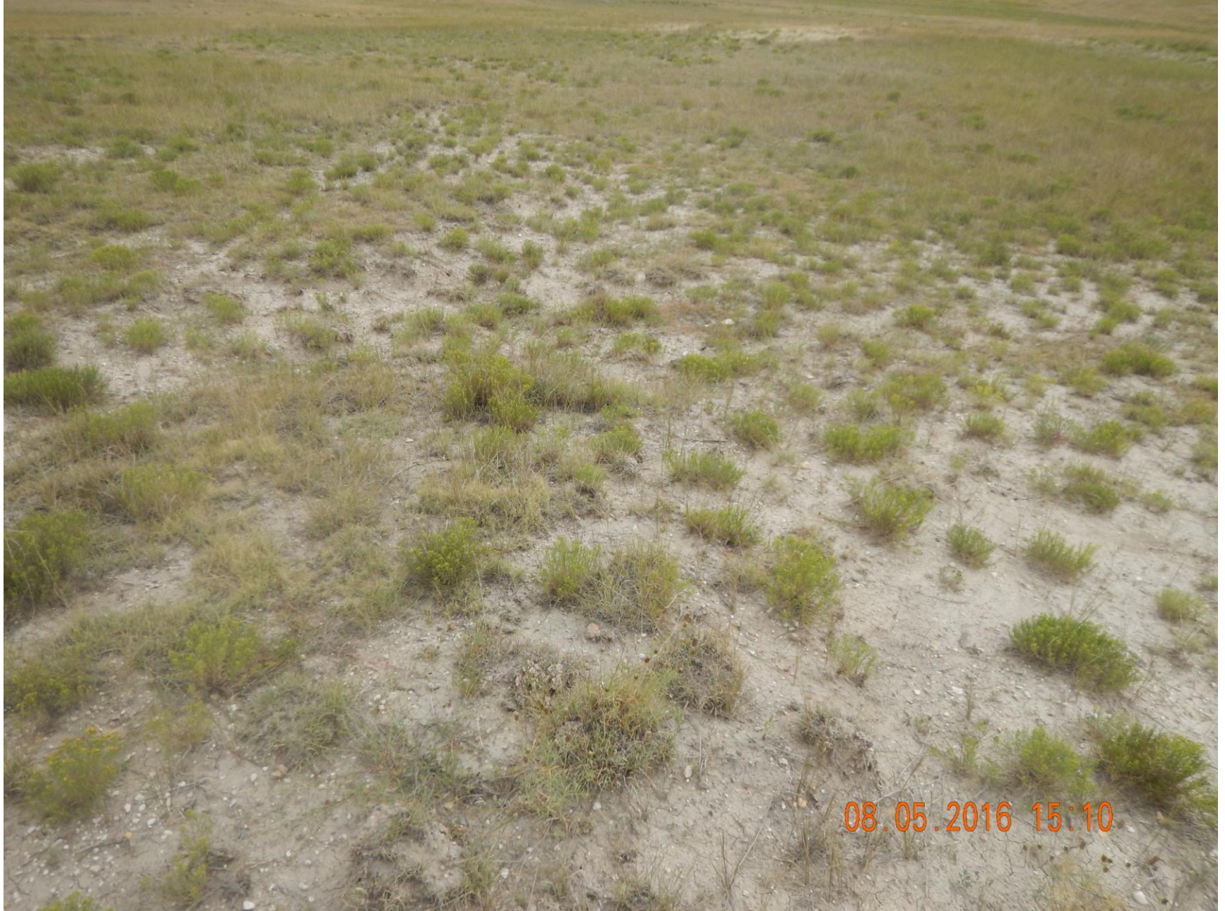
Figure 19: Photo taken from the northeast corner of the location, facing south. Photo shows vegetation over the reclamation area. Note area experiencing erosion.