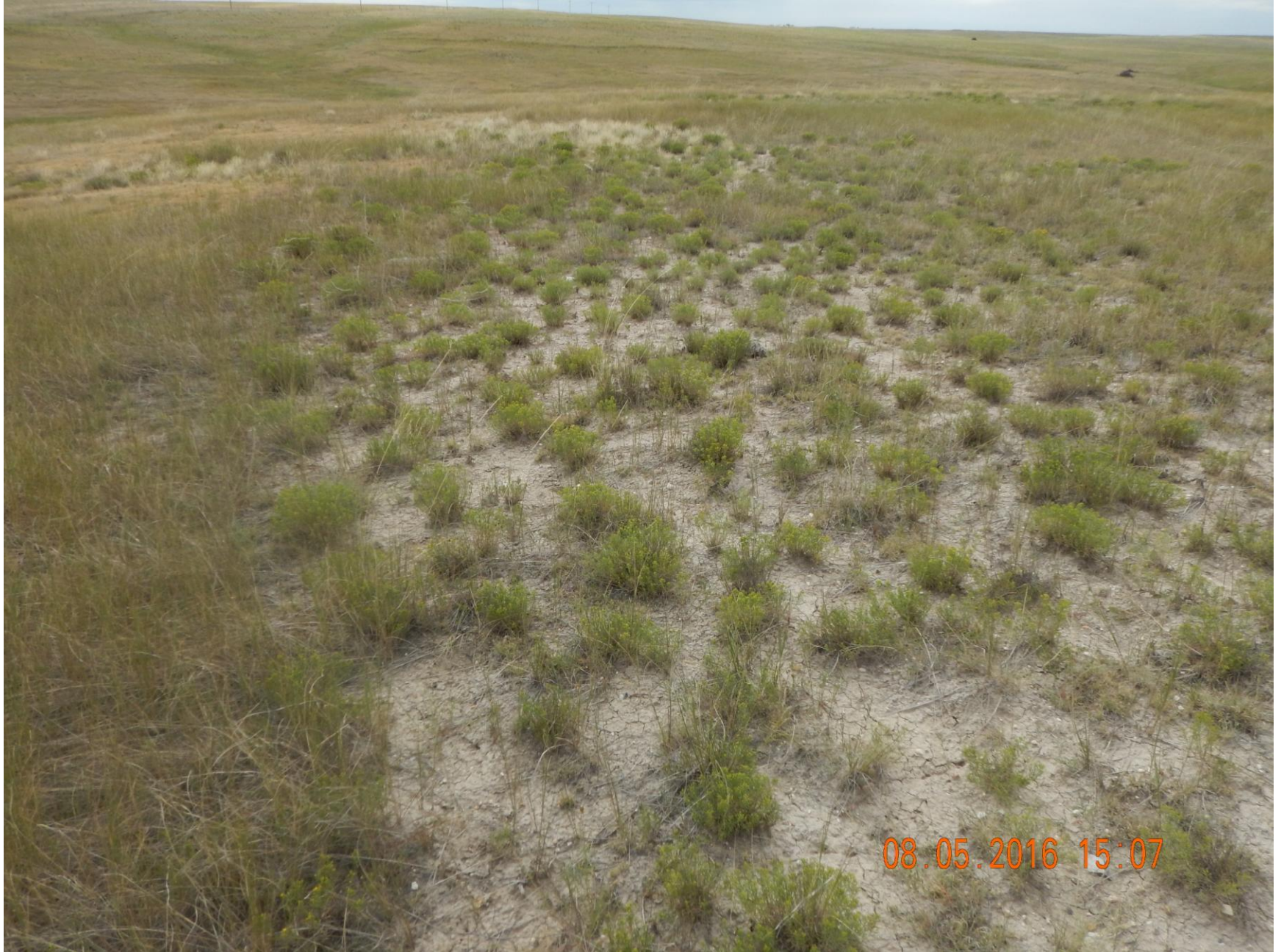
Figure 13: Photo taken from the southeast corner of the location, facing west. Photo shows vegetation over the reclamation area. Note vegetation has not achieved uniform cover.