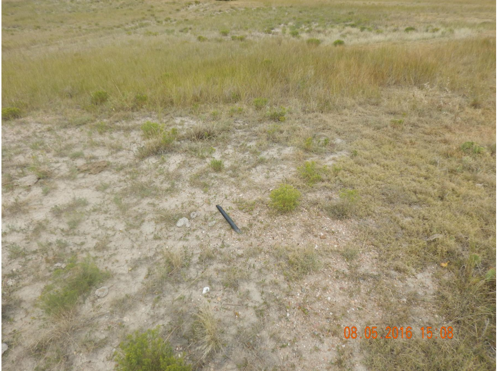
Figure 14: Photo taken from the southwest corner of the location, facing east. Photo shows vegetation over the reclamation area. Note vegetation has not achieved uniform cover.