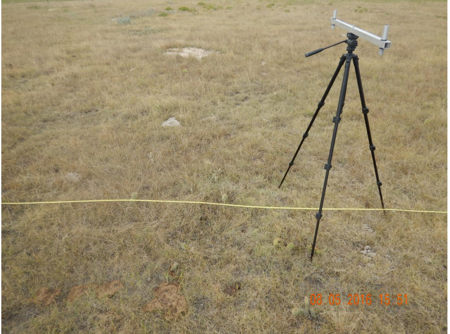
Figure 8: Photo of vegetation at the 50th point of the reference transect, facing north.