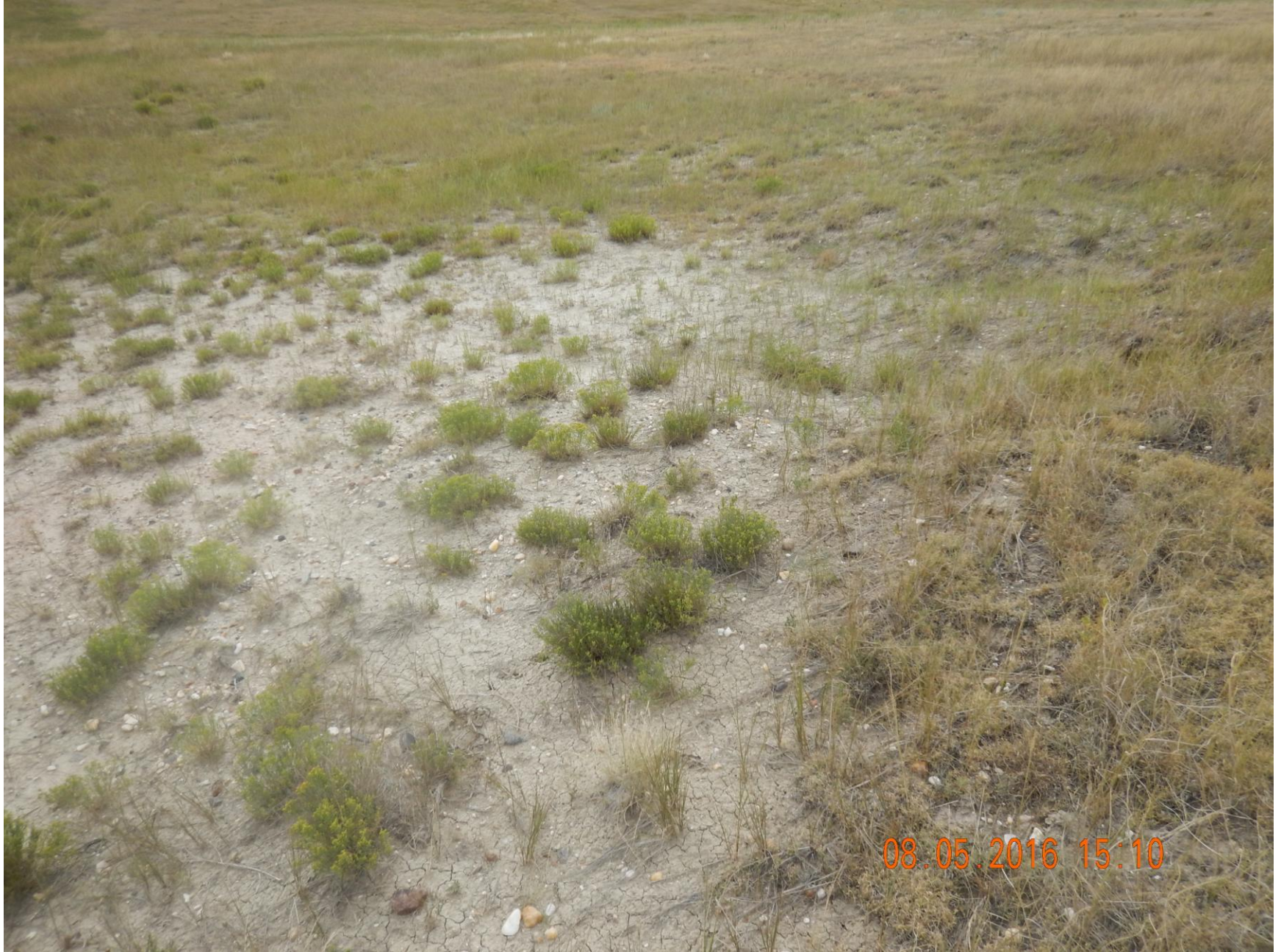
Figure 18: Photo taken from the northeast corner of the location, facing east. Photo shows vegetation over the reclamation area. Note area experiencing erosion.