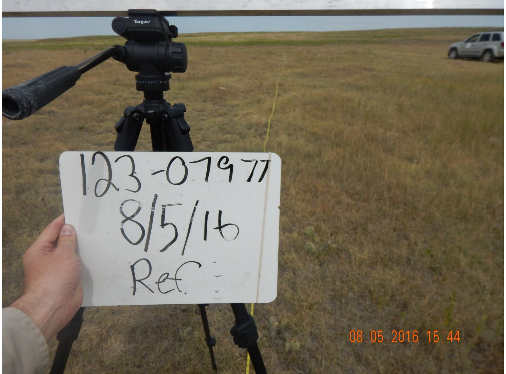
Figure 7: Photo of the starting point for the reference transect, facing east