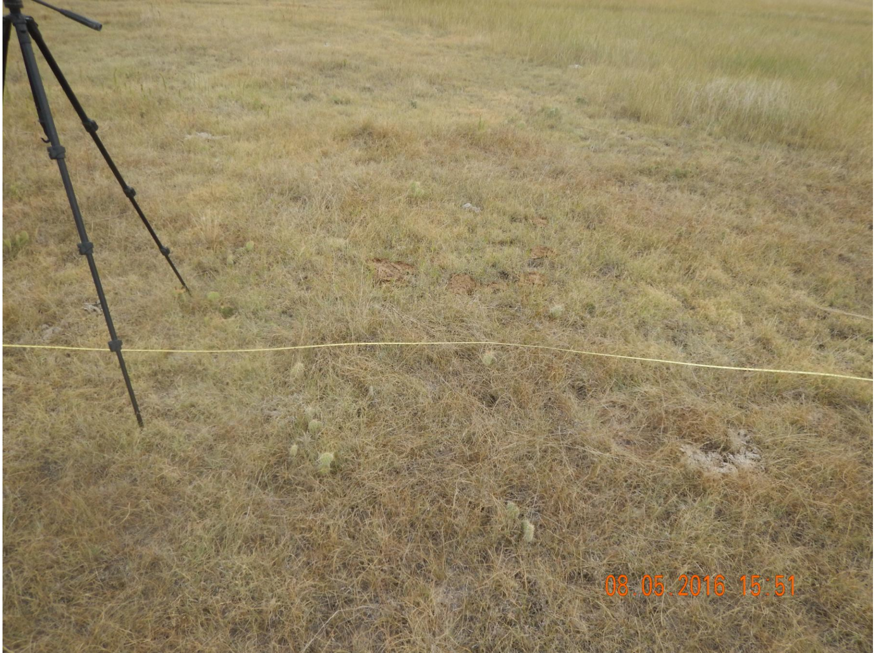
Figure 9: Photo of vegetation at the 50th point of the reference transect, facing south.