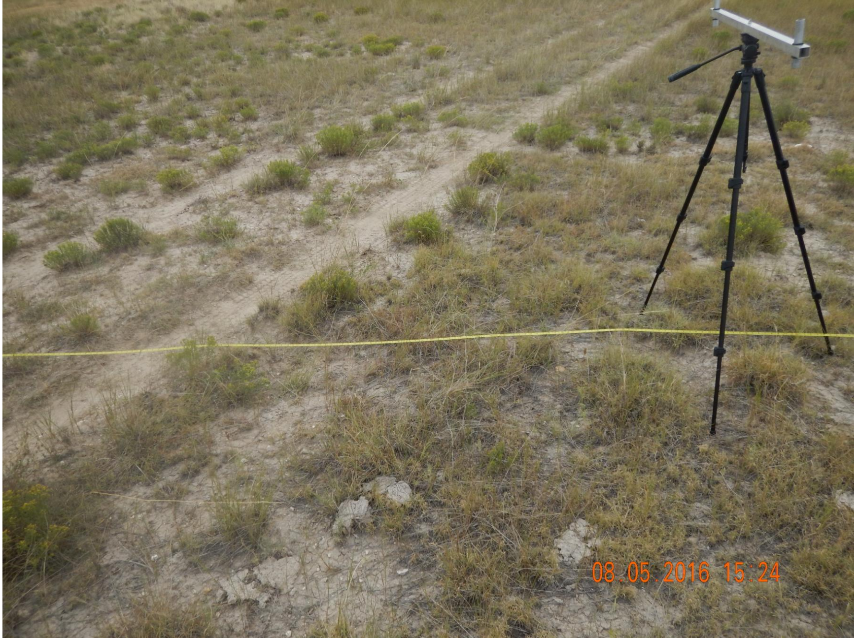
Figure 3: Photo of vegetation at the 50th point of the disturbance transect, facing west.