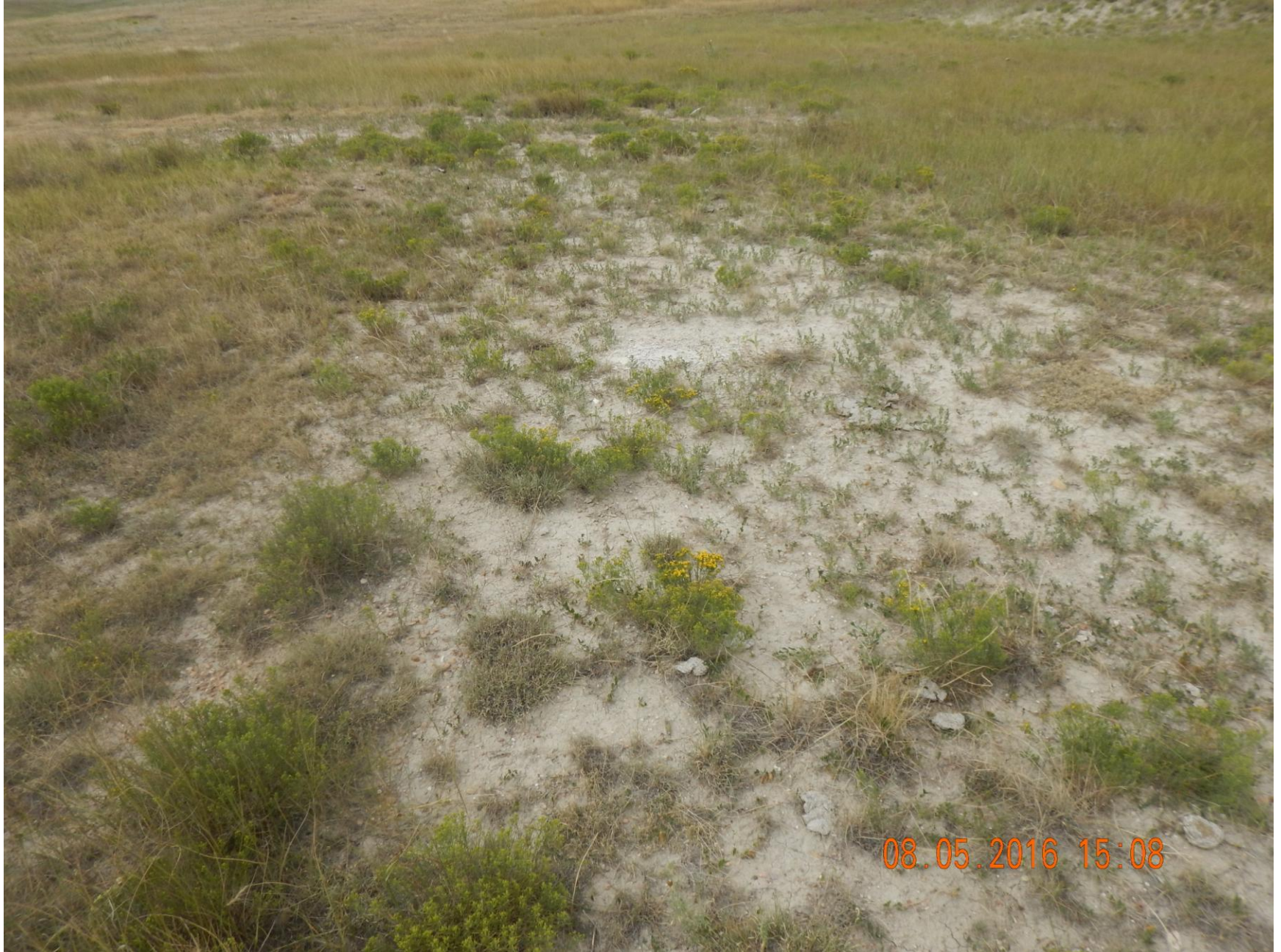
Figure 15: Photo taken from the southwest corner of the location, facing north. Photo shows vegetation over the reclamation area. Note vegetation has not achieved uniform cover.