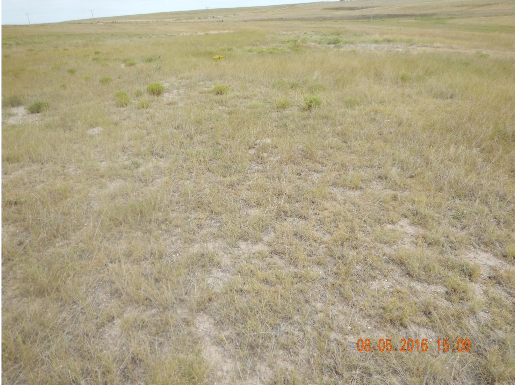
Figure 16: Photo taken from the northwest corner of the location, facing south. Photo shows vegetation over the reclamation area.