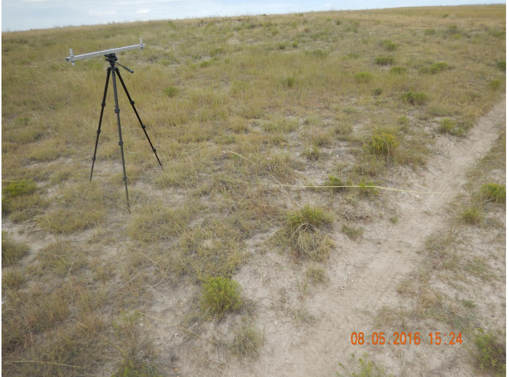
Figure 4: Photo of vegetation at the 50th point of the disturbance transect, facing east.