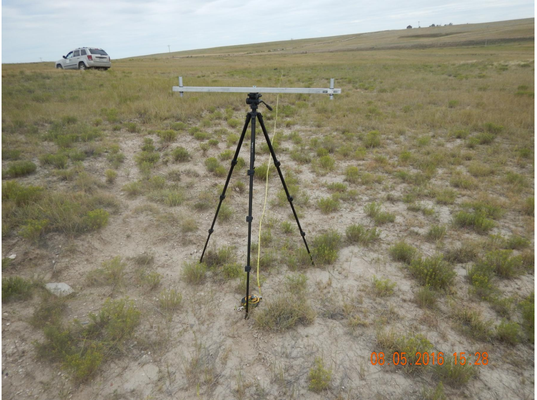
Figure 6: Photo of the end point for the disturbance transect, facing south.