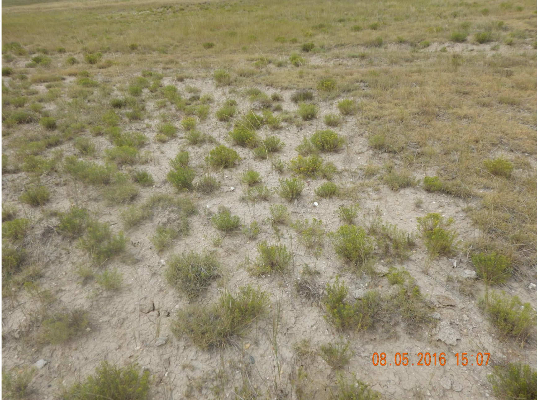
Figure 12: Photo taken from the southeast corner of the location, facing north. Photo shows vegetation over the reclamation area. Note vegetation has not achieved uniform cover.