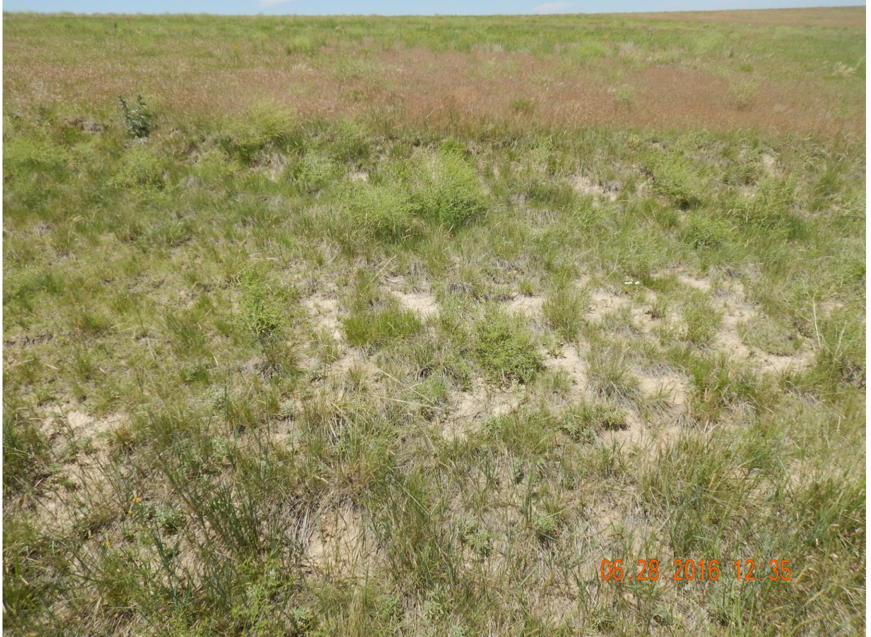
Figure 10: Photo taken from the access road, southwest of the location, facing northwest. Photo shows access road had not been recontoured.