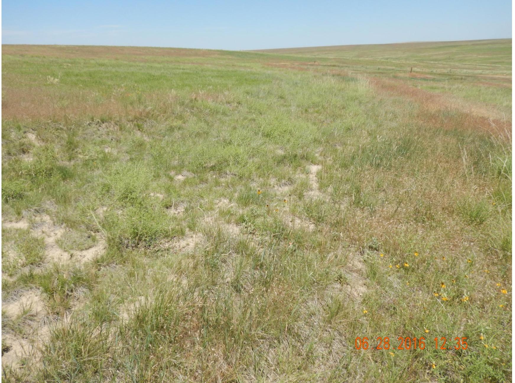
Figure 11: Photo taken from the access road, southwest of the location, facing north. Photo shows access road had not been recontoured.