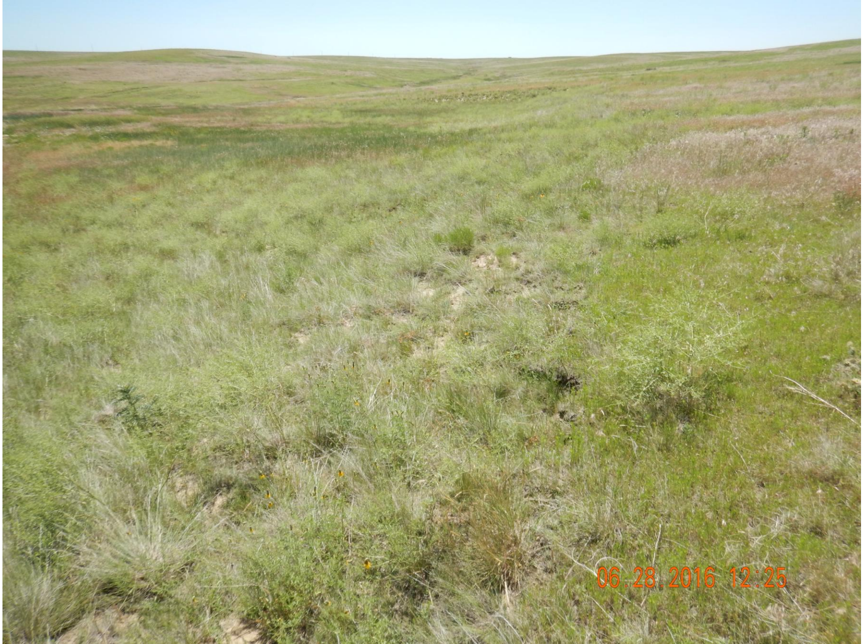
Figure 6: Photo taken from the northwest corner of the well location, facing south. Photo shows interim reclamation areas appear to be adequately vegetated.