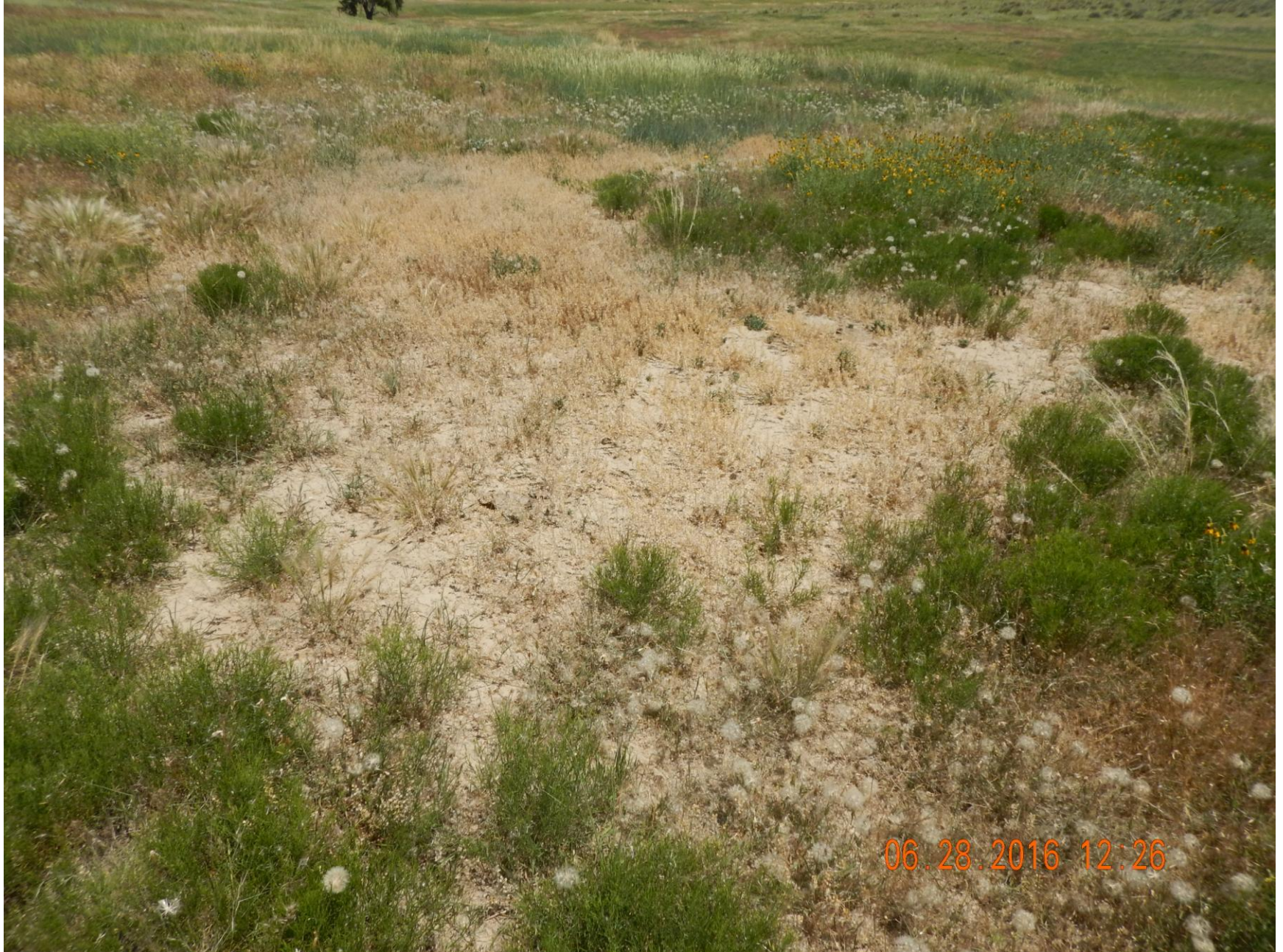
Figure 7: Photo taken from the site of the well, facing north. Photo shows the well location has not achieved uniform perennial vegetative cover. Plants seen are predominantly annual Thlaspi arvense