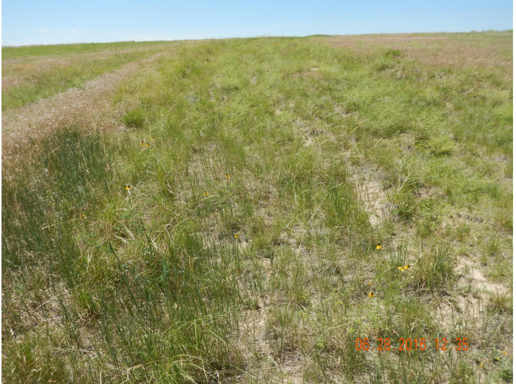
Figure 9: Photo taken from the access road, southwest of the location, facing west. Photo shows access road had not been recontoured.