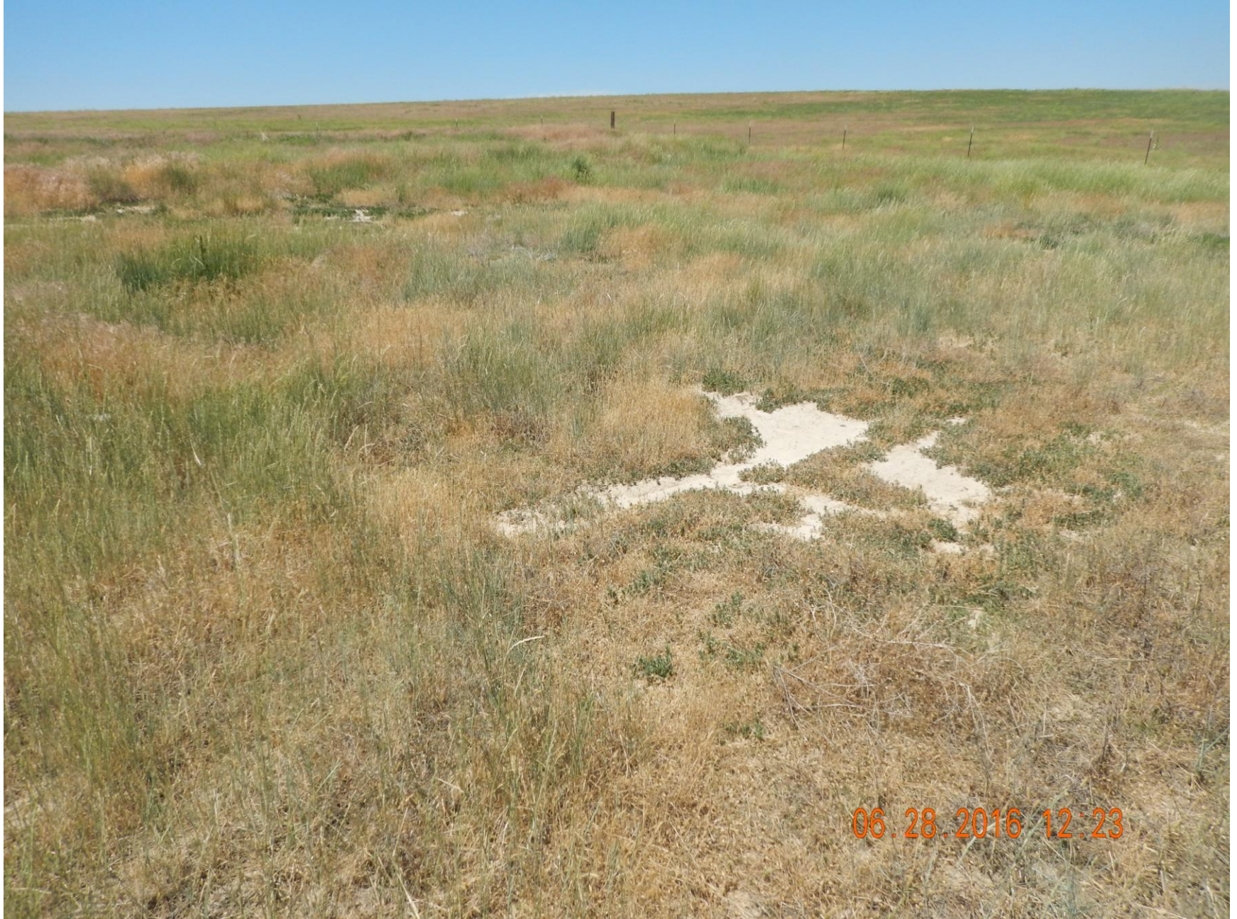
Figure 5: Photo taken from the fenced area on the north end of the location, facing north. Photo shows areas of possible salt kill still remaining within the fenced remediation area.