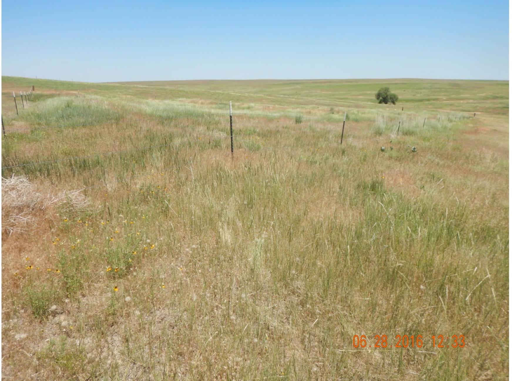
Figure 3: Photo taken from the east end of the pit area, facing northeast. Photo shows fenced off, salt kill area from figure 2.