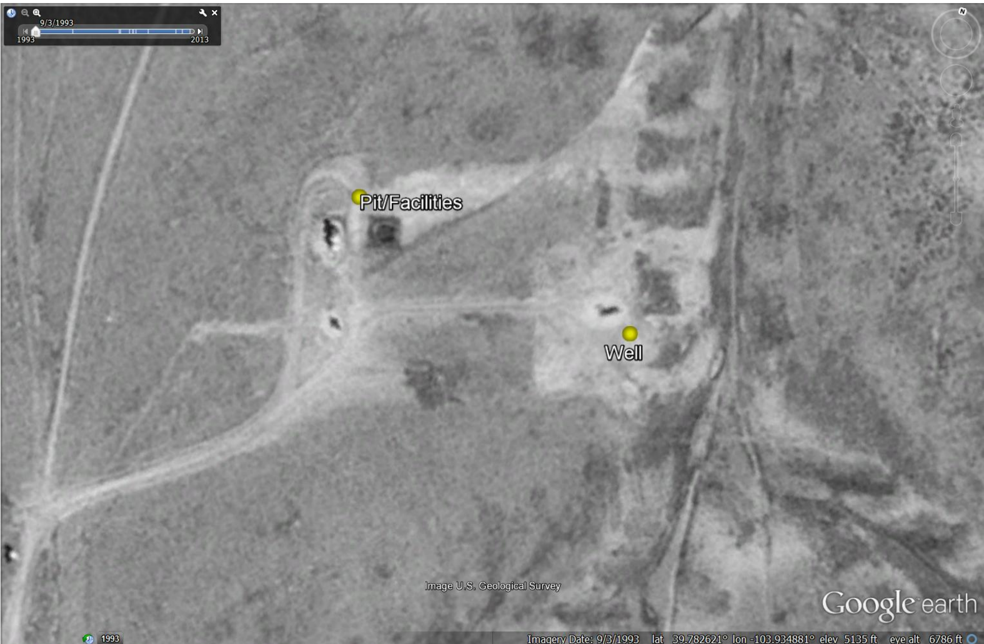
Figure 1: 1933 Aerial imagery showing location of Pit, facilities and well.