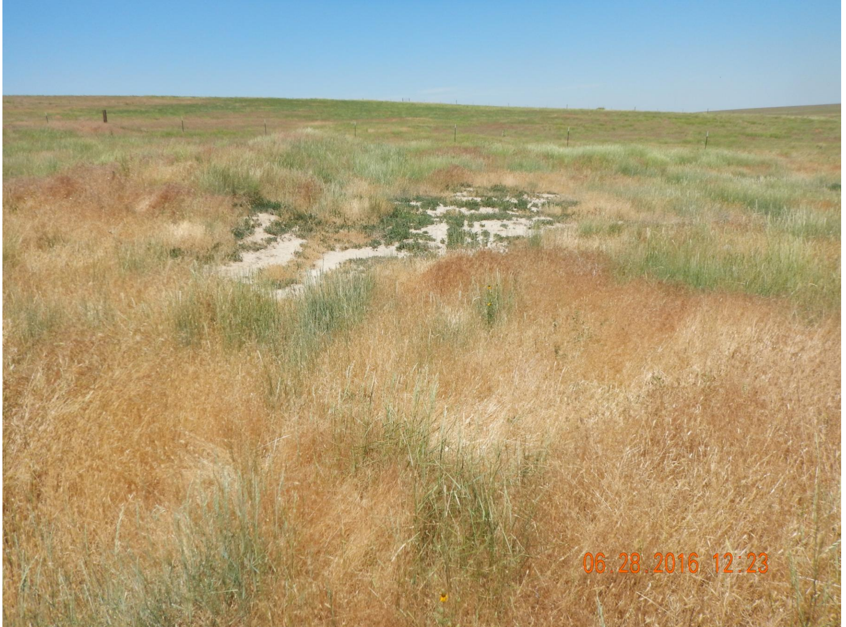
Figure 4: Photo taken from the fenced area on the north end of the location, facing north. Photo shows vegetation on location has not achieved uniform distribution. Possible salt kill remains.