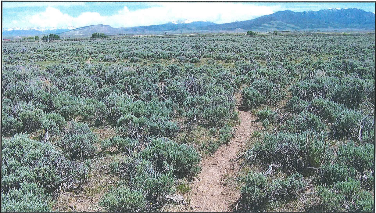
PHOTO: VIEW OF REFERENCE AREA