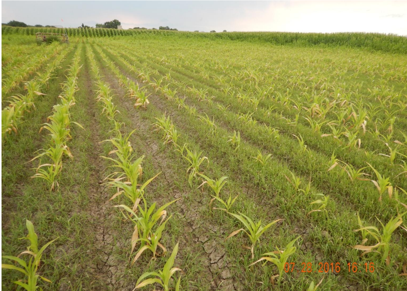
Photo 3. Photo taken from eastern location, facing West, illustrating discrepancy between reference and interim areas. Interim area density and height not representative of reference area.