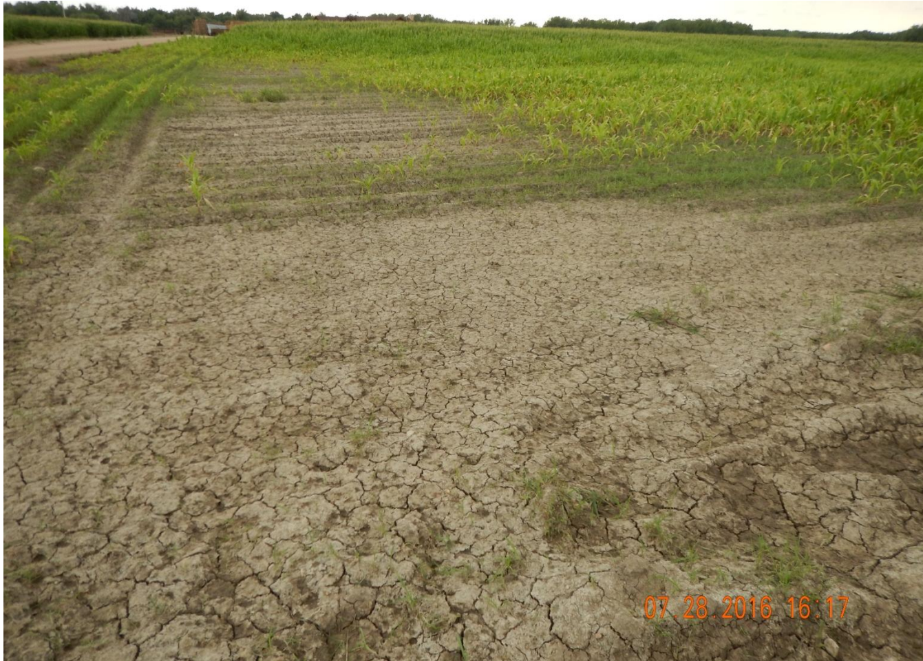
Photo 4. Photo taken from eastern location, facing South, illustrating areas with no crop growth.