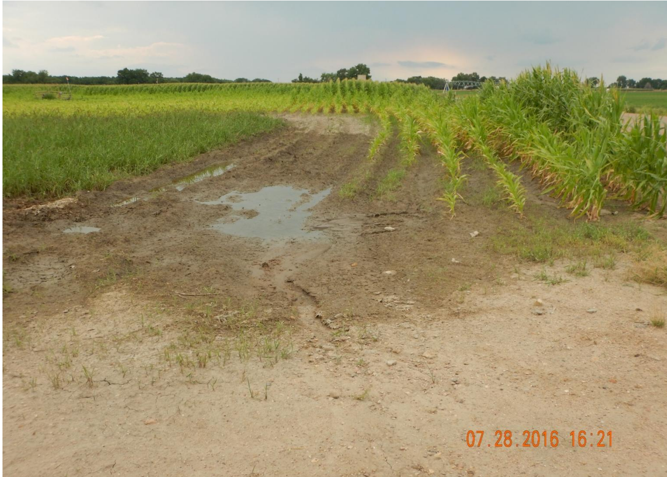
Photo 5. Photo taken from northeast location, facing West, illustrating areas with no crop growth and/or stunted crop growth.