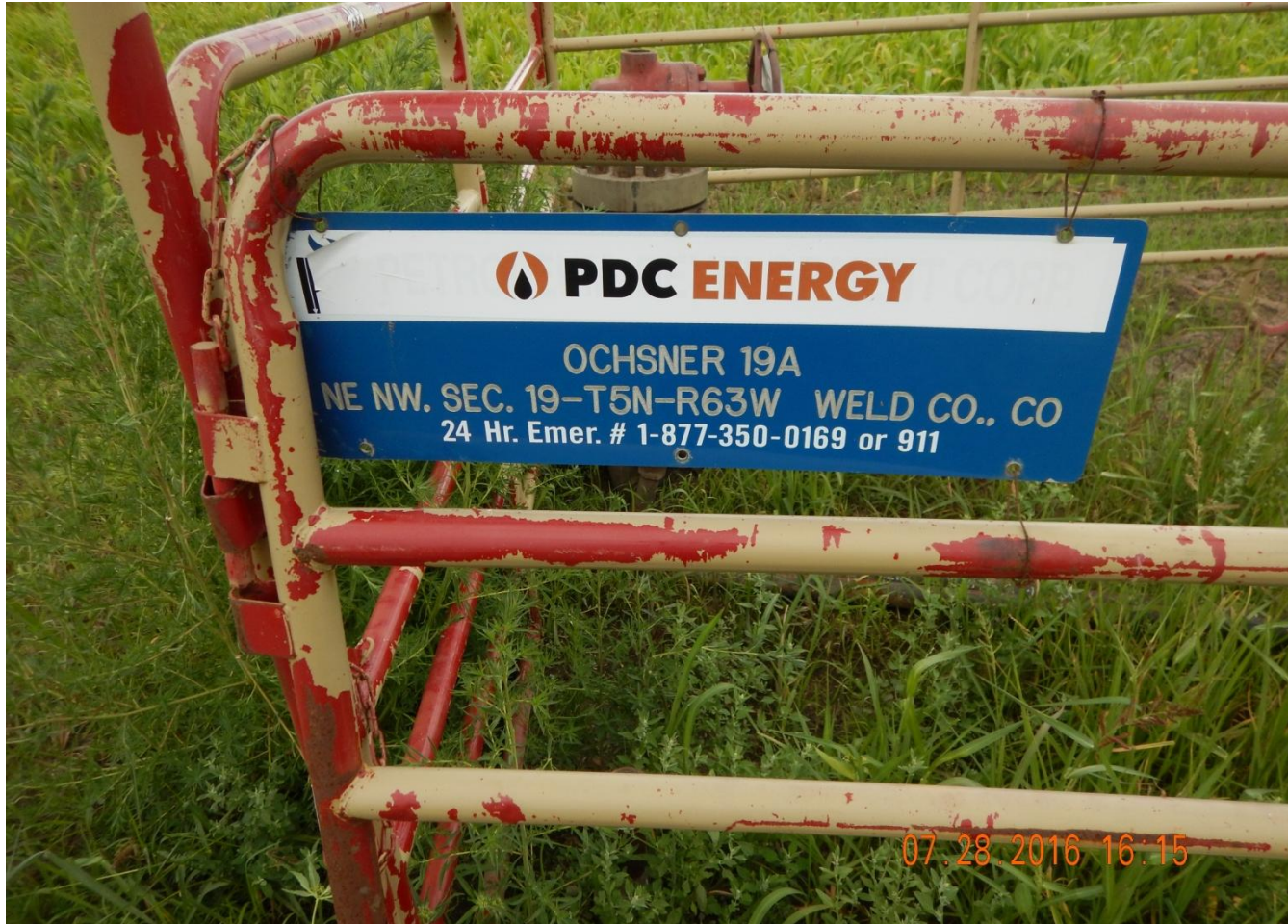
Photo 1. Photo taken of PR well sign for API #123-31153.