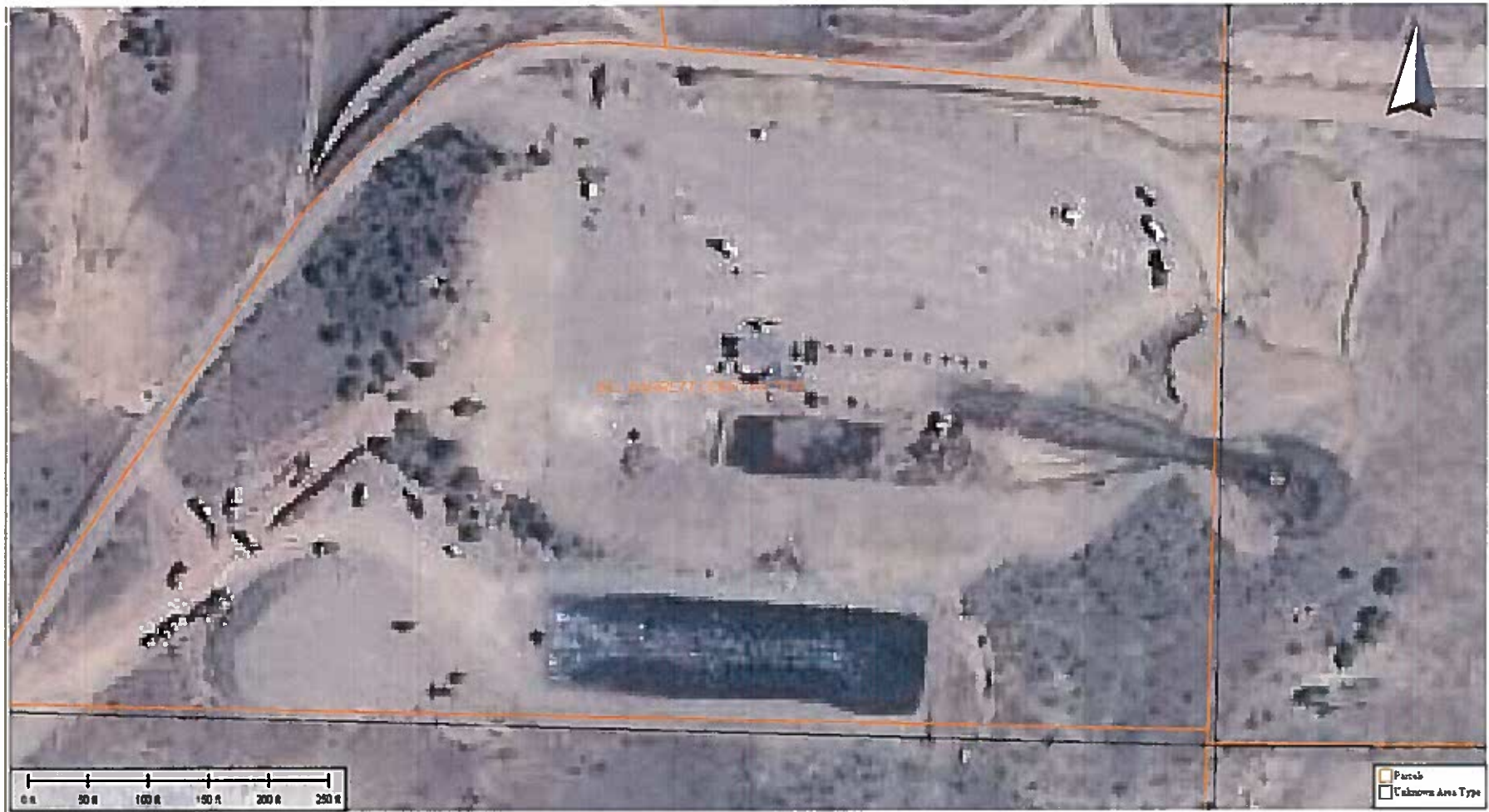
Figure 2: Site Map