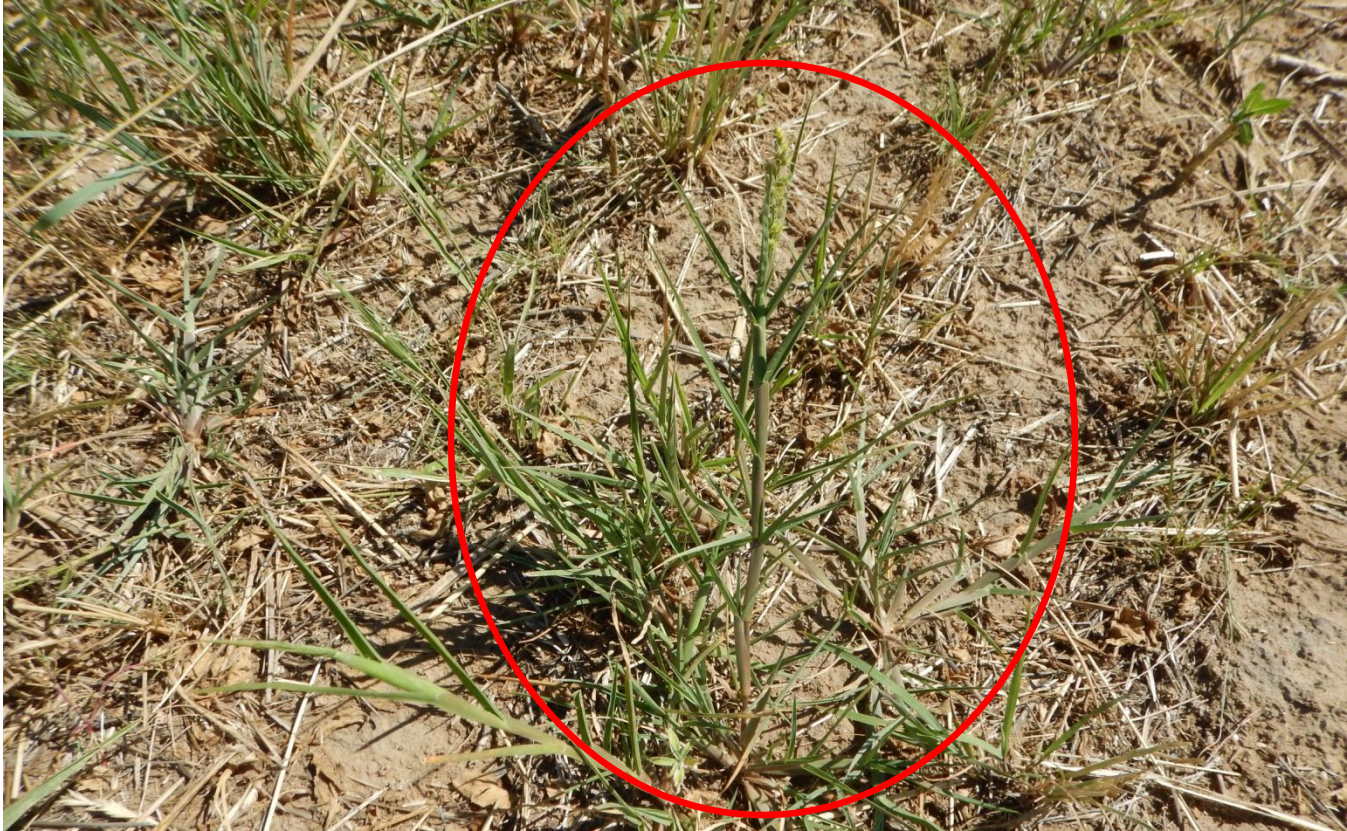
Photo 3. Photo taken from western flowline area of an individual sandbur.

Location ID 438023- Follow up inspection