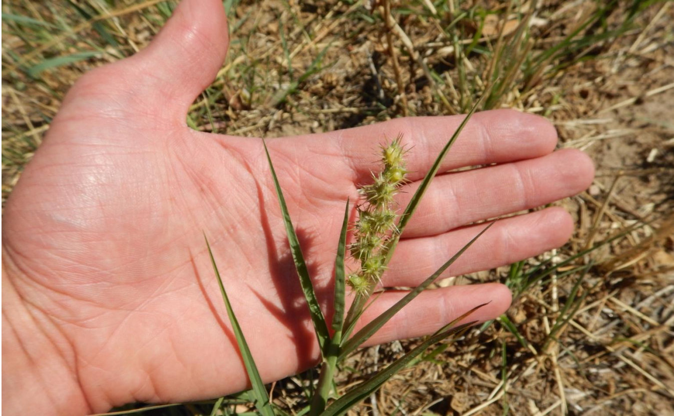
Photo 2. Close up photo taken from western flowline area of an individual sandbur.

Location ID 438023- Follow up inspection