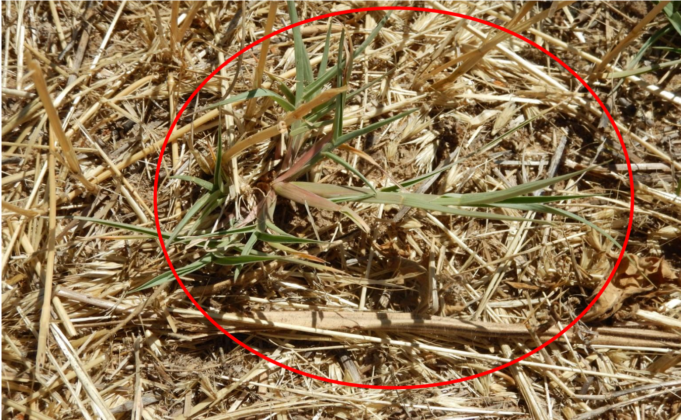
Photo 4. Photo taken from the well pad (API: 123-15275) area of an individual sandbur.