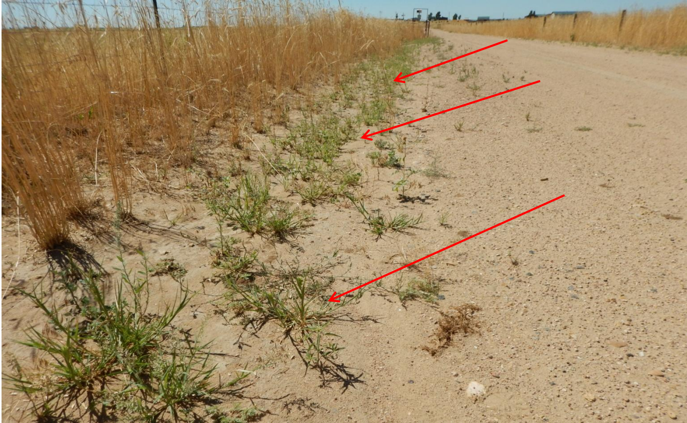
Photo 5. Photo taken along the eastern side of the access road, facing South, illustrating longspine sandbur establishment.