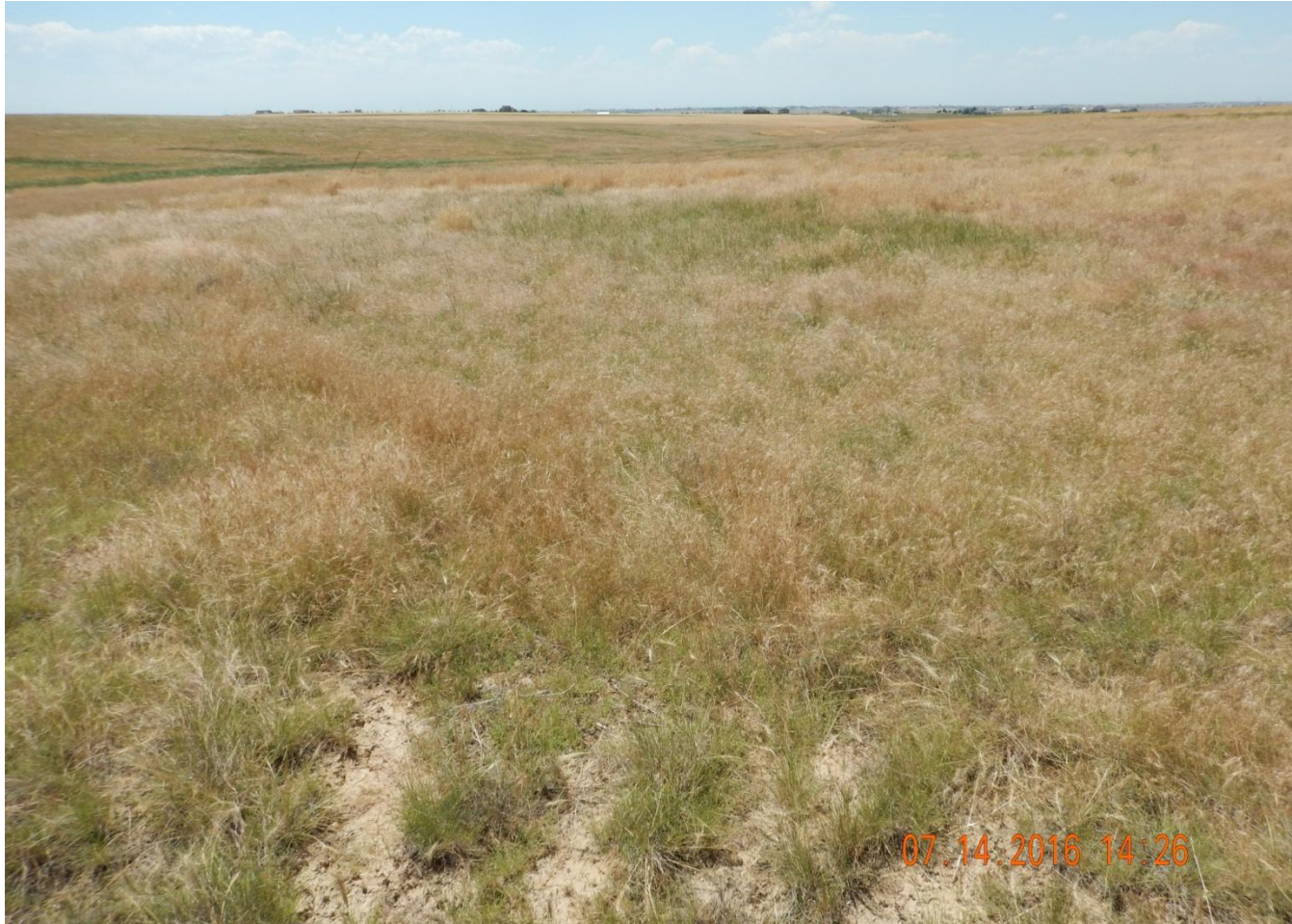
Photo 1. Photo taken from center of location, facing West. Vegetative growth appears to be reflective of reference areas. A number of native, perennial grass species were observed throughout location. However, location was not recontoured and 3 guy line anchors were left behind.