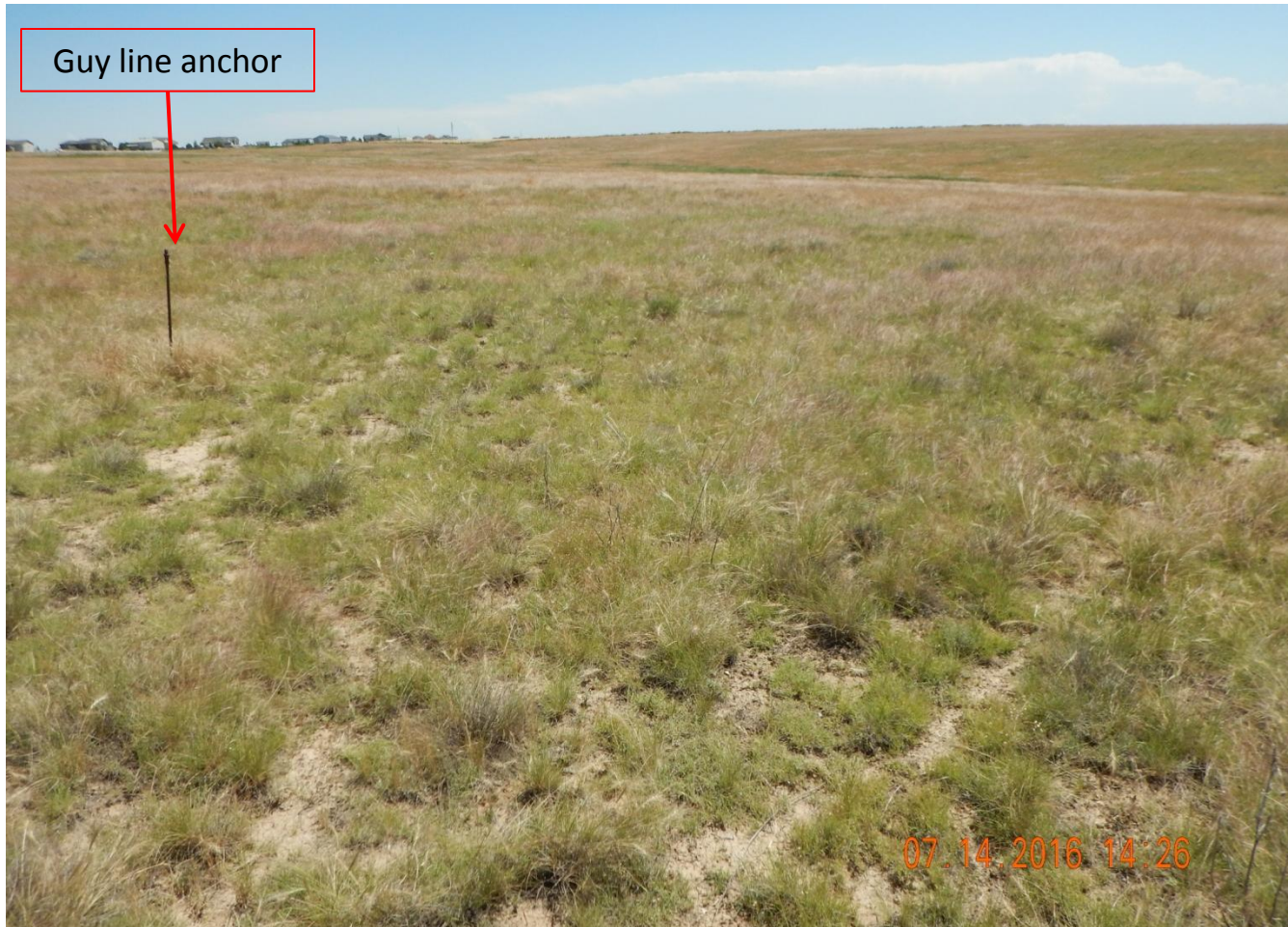
Photo 4. Photo taken from center of location, facing North. Vegetative growth appears to be reflective of reference areas. A number of native, perennial grass species were observed throughout location. However, location was not recontoured and 3 guy line anchors were left behind.