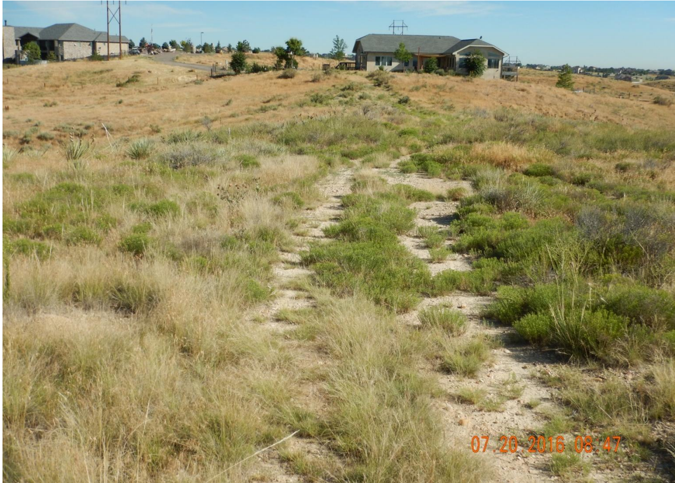
Photo 3. Photo taken from well location, facing North. Main access not reclaimed and gravel not removed.