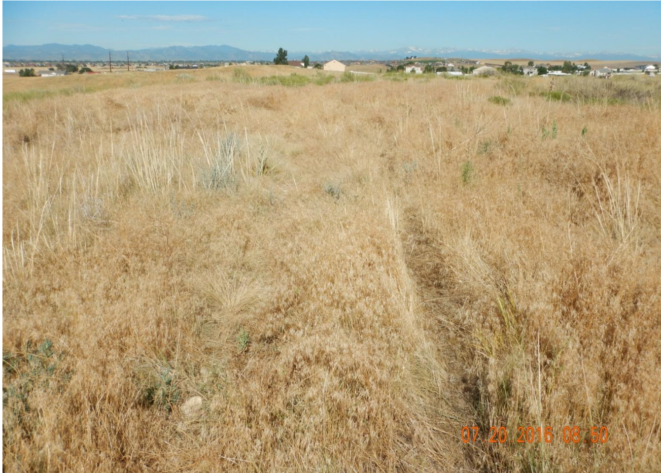
Photo 5. Photo taken from the eastern location, facing West. Cheatgrass observed in high densities.