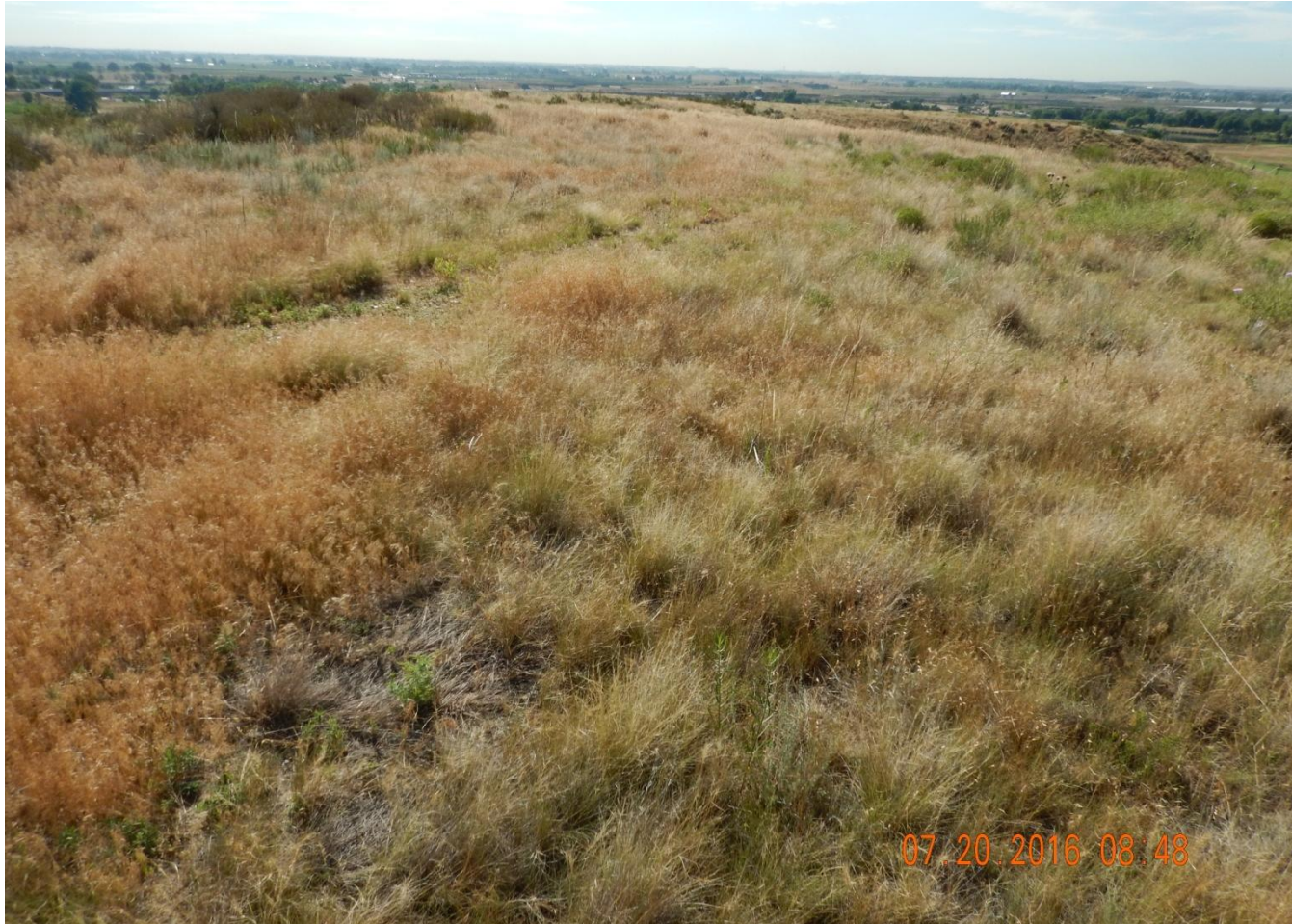
Photo 4. Photo taken from northern well location, facing East. Location has native grasses and shrubs, but also has a high density of cheatgrass. Cheatgrass also exists throughout this entire local region, not just this well location.