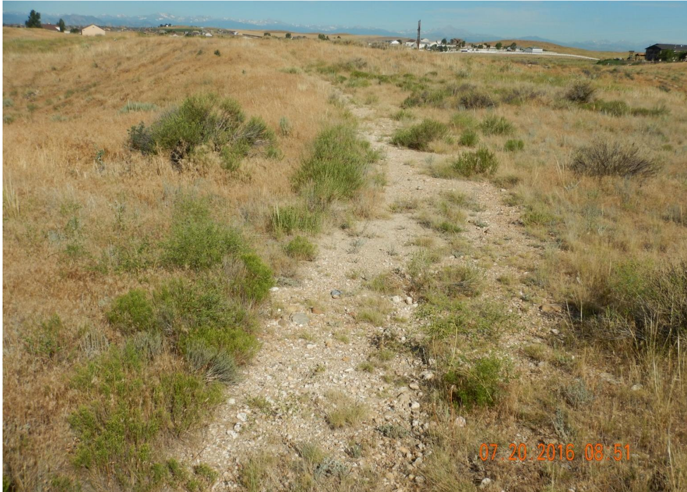
Photo 7. Photo taken from the eastern portion of what may have been used as an access road. Access road not reclaimed and gravel was not removed.