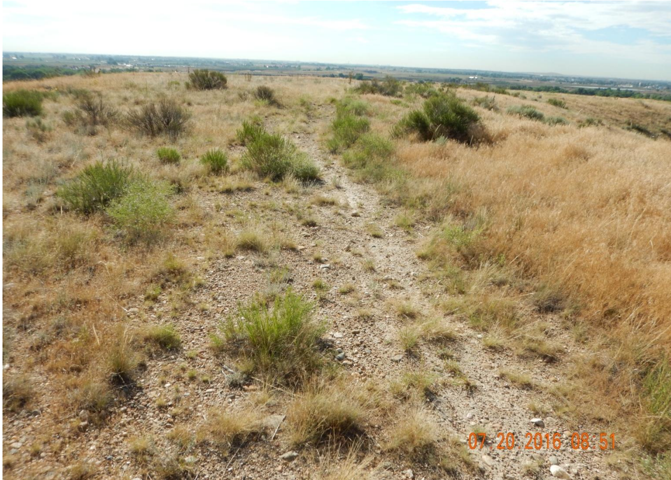
Photo 6. Photo taken from previous photo location, facing Southeast. Gravel not removed but several native species exist throughout location.