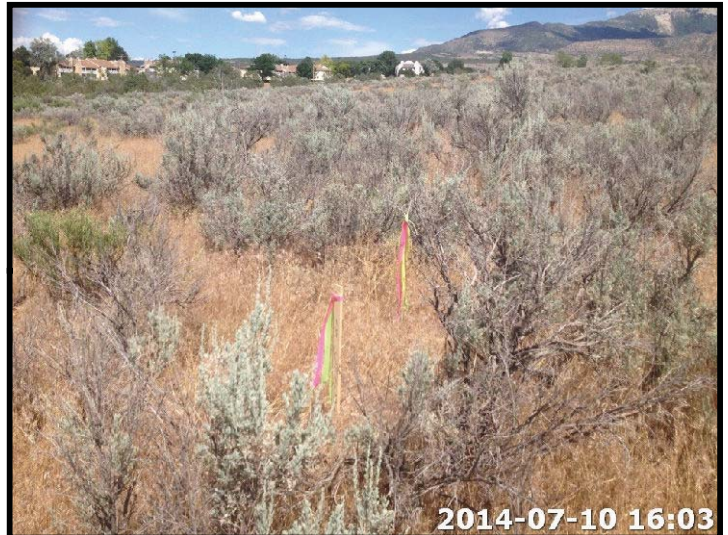
BMC D Looking East