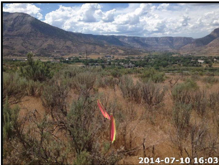
BMC D Looking West