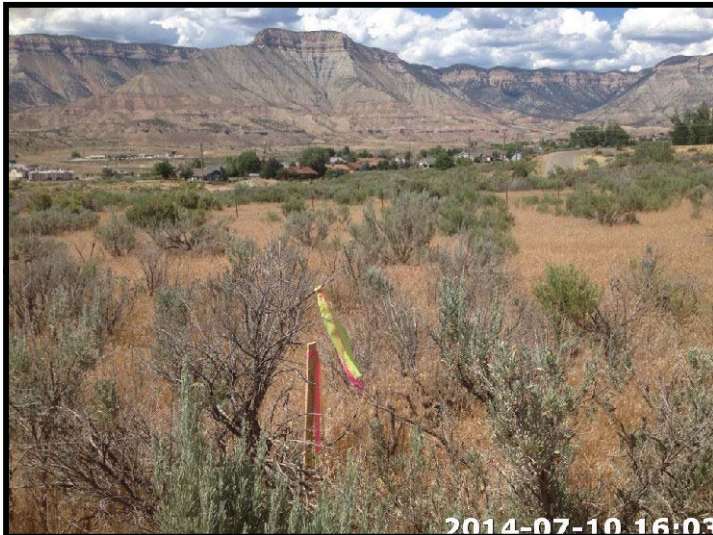
BMC D Looking North